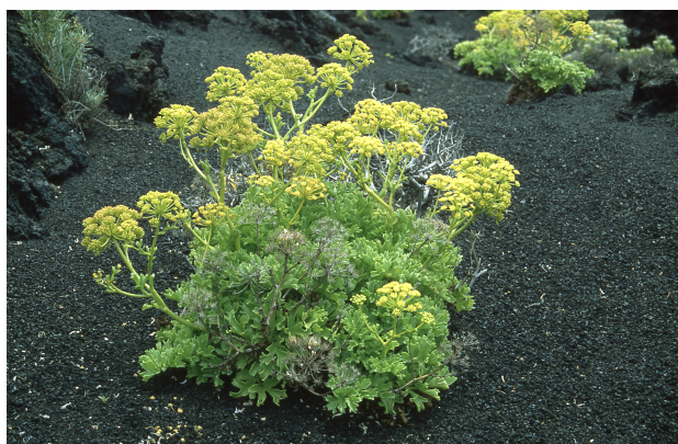
Astydamia latifolia on volcanic sea cliff. Island of La Palma, Spain

B3.1c Macaronesian rocky sea cliff and shore