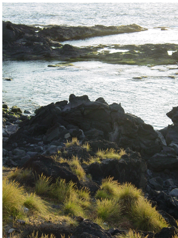
Euphorbia azoricae-Festucion petraeae in Azores, Portugal (Photo: Jorge Capelo).