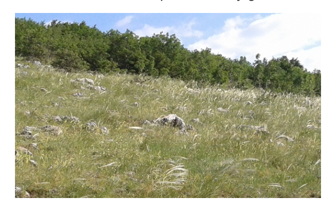
Mediterranean tall perennial dry grassland on the Askio Mountain in northwestern Greece.

E1.3b Mediterranean tall perennial dry grassland