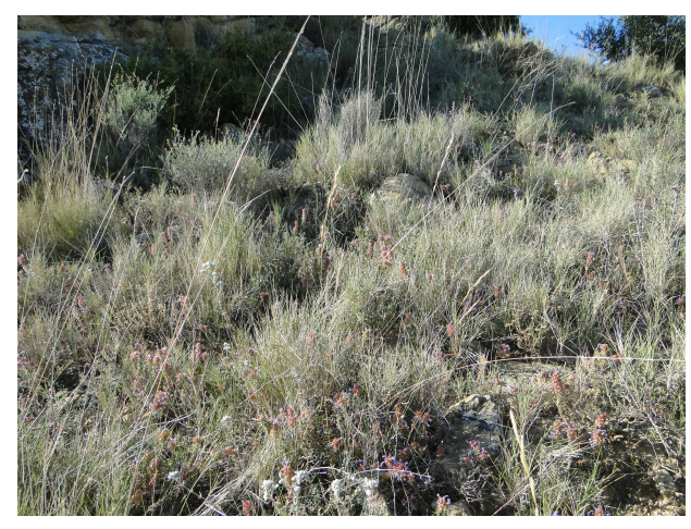
Brachypodium retusum dominated grassland in southern Navarre, Spain.