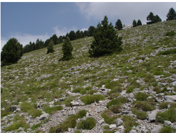
Festuca scoparia grassland on limestone, Sierra del Cadí, Pyrenees, Spain (Photo: J.A. Campos).

E1.5b Iberian oromediterranean basiphilous dry grassland