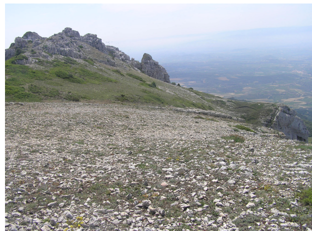
Festuca hystrix dry grassland on limestone, Toloño mountain, Araba, Basque Country, Spain