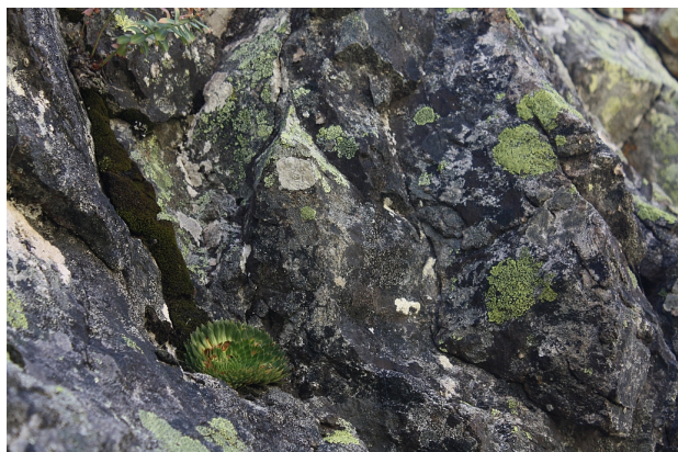
Siliceous cliff with endemic Saxifraga florulenta in the Mercantour, France.

H3.1d Mediterranean siliceous inland cliff