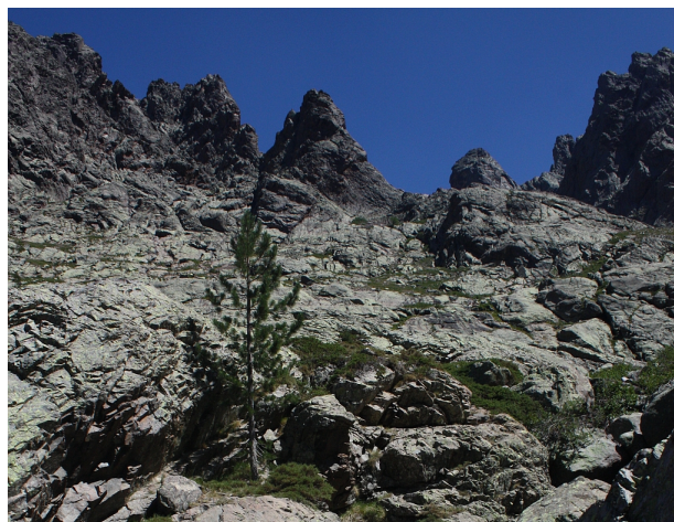
Siliceous cliffs in the higher mountains of Corsica (Photo: John Janssen).