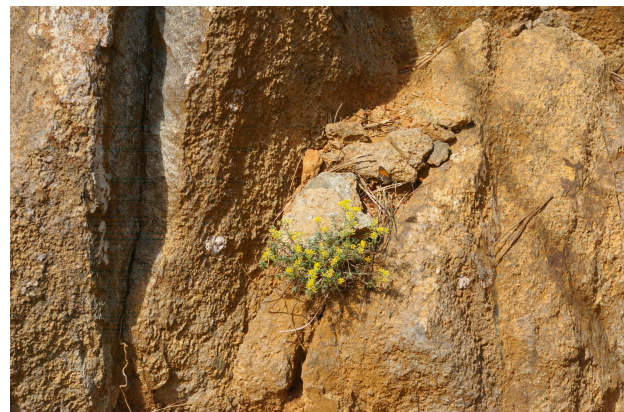
Crevice on peridotite cliff in Sierra Bermeja, Málaga, Spain, with the nickel hyperaccumulator Alyssum serpyllifolium subsp. malacitanum (Photo: B. Díez Garretas and Alfredo Asensi).