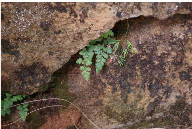
Serpentine cliff in Sierra Bermeja, Málaga, Spain, with Asplenium adiantum-nigrum var. corunnense.

H3.2g Mediterranean ultramafic inland cliff