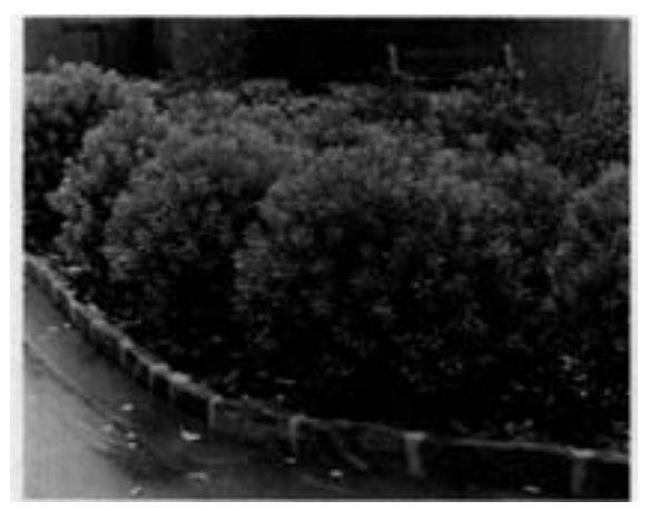
Ilex glabra 'Densa,' photographed at Longwood Gardens by M. Dirr.

'Densa' — This clone develops an oval-rounded uniform outline with upright branches. The