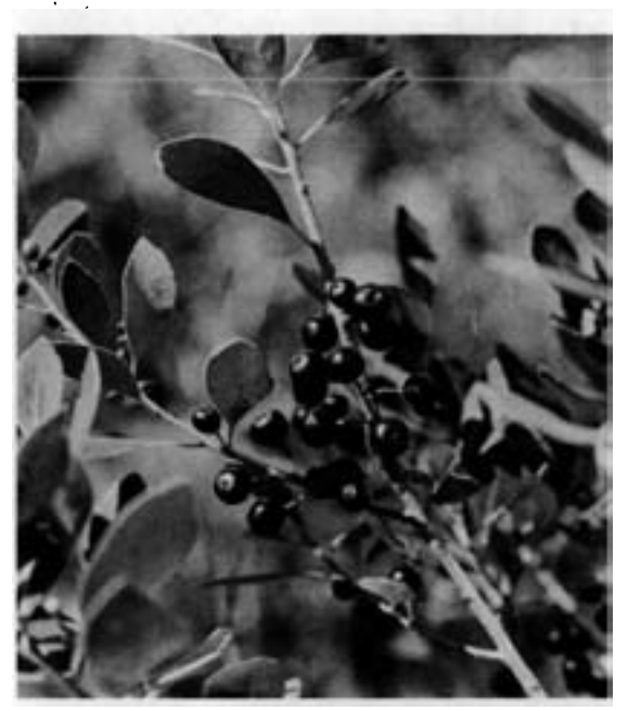
The glossy black fruit of inkberry.

Compelling reasons for the rebirth of interest in I. glabra are its landscape toughness and environmental adaptability. The species displays a penchant for survival under conditions ranging from full sun to moderate shade and from wet to dry, clayey to sandy soils of acid to neutral pH. Inkberry is easily transplanted, literally by pulling it out of the ground and relocating it. Jim Cross of Environmentals Nursery of Cutchogue, New York, relates that it is one of the few broadleaf evergreens that survive in heavy clay soils where irrigation systems continue to operate whether needed or not. Most cultivars, as well as the species, are both field- and containergrown, and are easily transplanted on a yearround basis. Dr. Donald Wyman (1970) mentioned the rejuvenation of weak and spindly plants at the Arnold Arboretum: plants 2.5 meters tall (8 feet) were cut to about 15 centimeters (6 inches) from the ground in April,