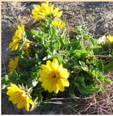
( Balsamorhiza rosea ) Rosy balsamroot Bloom: mid spring