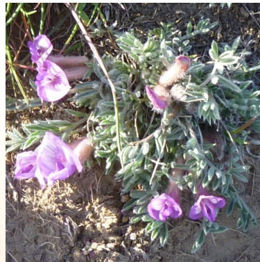
( Astragalus purshii ) Pursh's milk-vetch, woolypod milkvetch Bloom: early spring