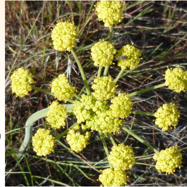
( Lomatium triternatum ) nineleaf biscuitroot Bloom: early spring