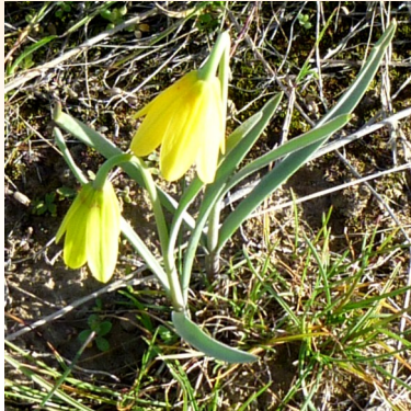
( Fritillaria pudica ) yellowbells Bloom: early spring