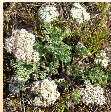
( Lomatium macrocarpum ) bigseed biscuitroot, large fruited lomatium Bloom: spring