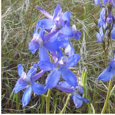
( Delphinium nuttallii ) upland larkspur, twolobed larkspur Bloom: mid spring