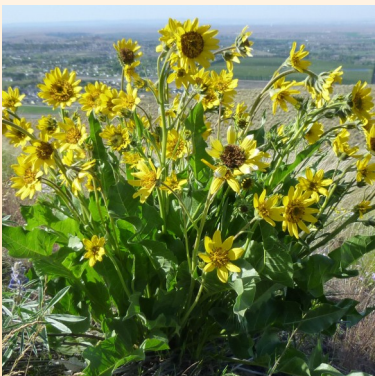
( Balsamorhiza careyana ) Carey's balsam- root Bloom: late spring