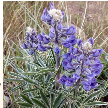
( Lupinus sericeus ) silky lupine Bloom: spring