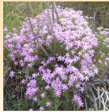
( Phlox longifolia ) long-leaf phlox Bloom: early spring