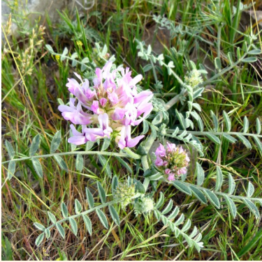
( Astragalus succumbens ) Columbia milkvetch, sprawl- ing rattle-weed, crouching locoweed Bloom: late spring