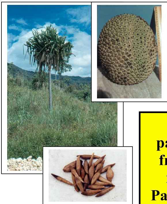
Karuka ( Pandanus julianettii ) grows at 1800 to 2500 m altitude in the Highlands