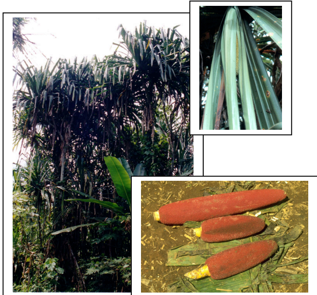
Marita ( Pandanus conoideus ) is used for its red or yellow fruit made into a sauce in mid altitude zones