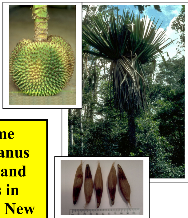
Wild karuka ( Pandanus brosimos ) grows in the high mountains between 2500 and 3100 m altitude