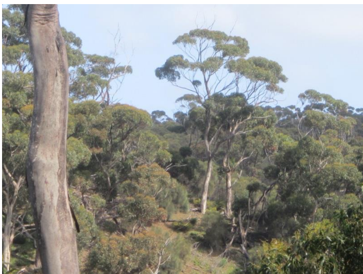
Above & left: Remnant tall Sugar Gum woodland in the Western River Conservation Park on the North West coast of Kangaroo Island.