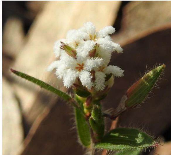
Right: Leucopogon concurvus was inadvertently labelled Hibbertia virgata