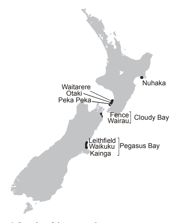
Figure 1: Location of sites surveyed.