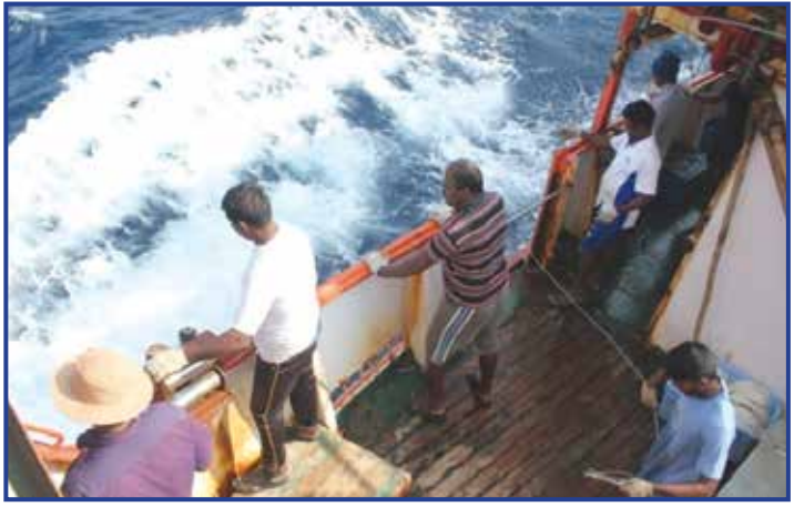
Trainees engaged in hauling the longline onboard Matsya Drushti

The training programme on the capacity building and training on "Tuna longlining to traditional fishers" was conducted jointly by Fishery Survey of India and CIFNET. The training programme was conducted with the financial assistance from National Fisheries Development Board, Hyderabad (NFDB). The scientists of Chennai Base of Fishery Survey of India had been deputed for delivering theory classes.