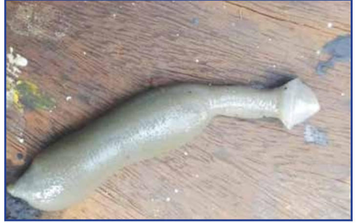
(Communicated by Shri Solly Solomon, Sr. Scientific Assistant, Mormugao Base)

Though not a sorted item for consumption in Indian market, they are widely used in North East asian countries and various island nations of South east asia. In India, large sized species are used in the biological laboratories for different scientific experiments as well as in educational