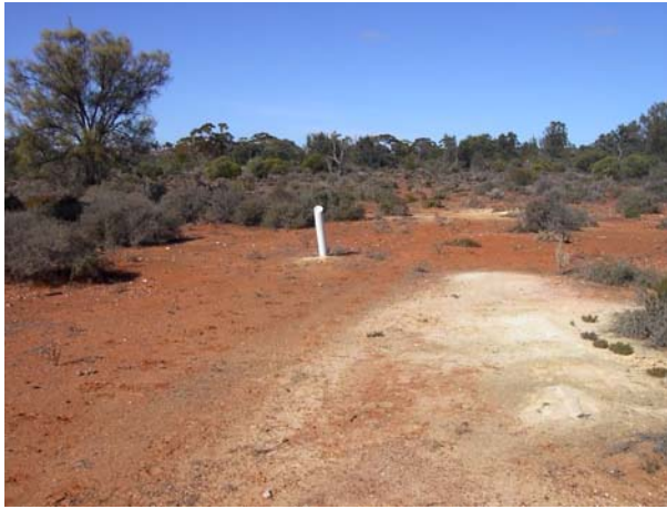
Photograph 14: Uncapped drill holes are common on the eastern side of the hills.