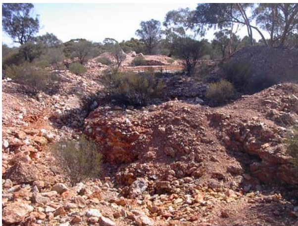
Photograph 12: Early diggings on the top of the hill. A recent drill pad can be seen in the background.