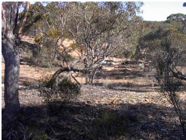
Photograph 9: Drainage Channel vegetation in a gully descending from the top of one of the hills.