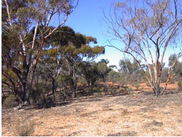
Photograph 4: Eucalypt Woodland on the top of the hills in the Natal area.