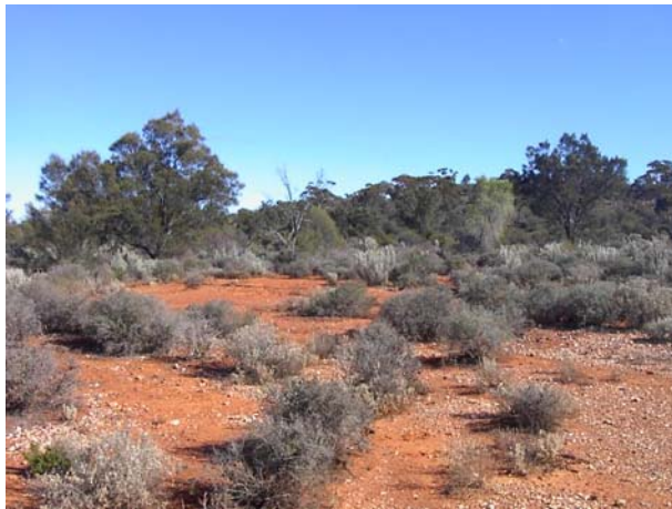
Photograph 8: Casuarina Open Woodland located within areas of Eucalypt Open Woodland.