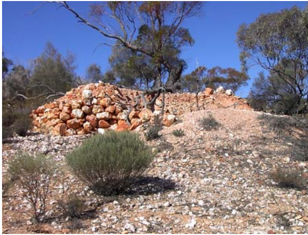
Photograph 11: An historic shaft on the Natal hill.