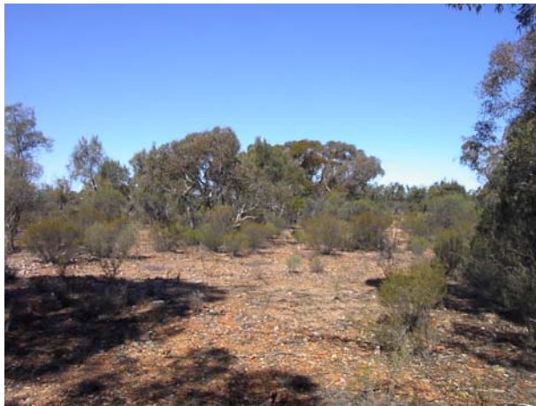
Photograph 5: More dense Eucalypt Woodland on the top of the hills.