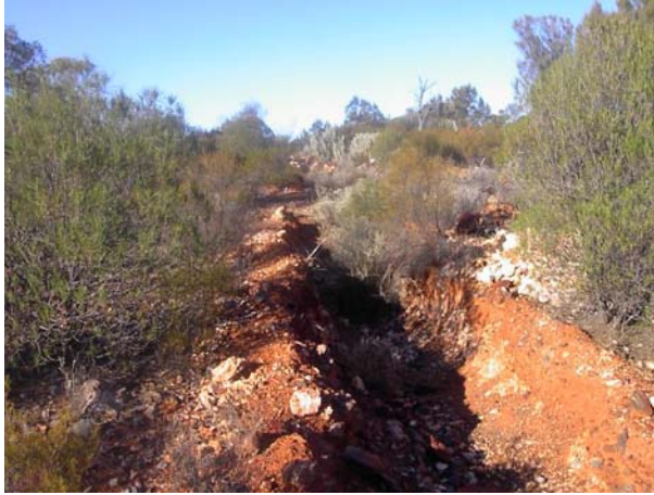
Photograph 13: A costean on the north eastern side of the Natal Project.