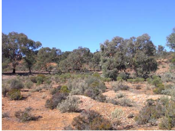
Photograph 7: Eucalypt Open Woodland typical of that surrounding the hills.