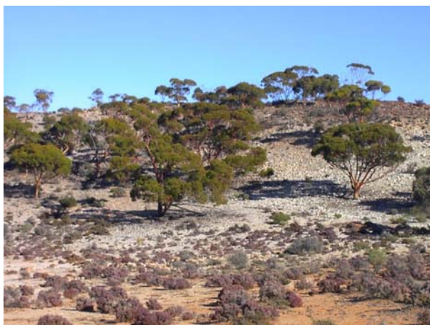
Photograph 3: E. salubris below the Break-away on the eastern side of the Natal hills.