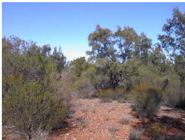
Photograph 6: Casuarina Woodland, also found on top of the Natal hills .