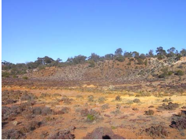
Photograph 1: Vegetation typical of the areas described as Salt Lake Margin.