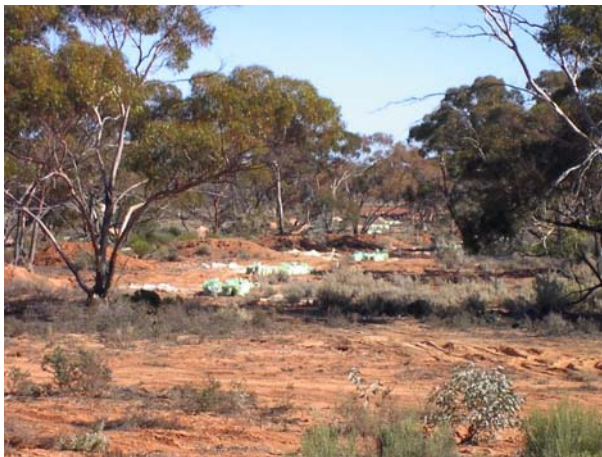
Photograph 15: Recent exploration activity has mainly concentrated on the western side of the hills.