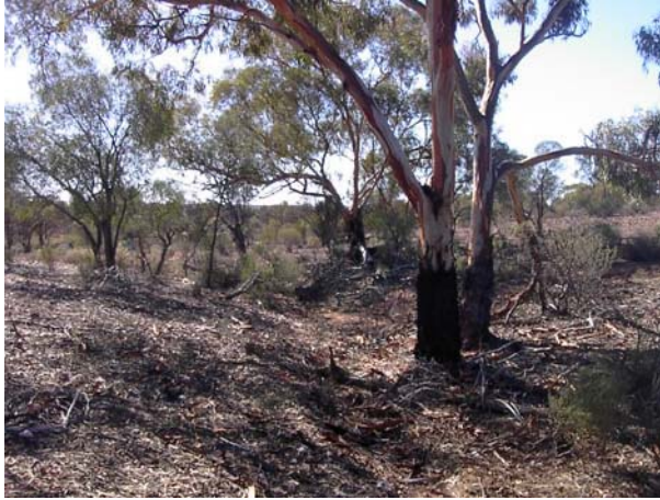
Photograph 10: A more gentle sloping gully on the northern side of the survey area.