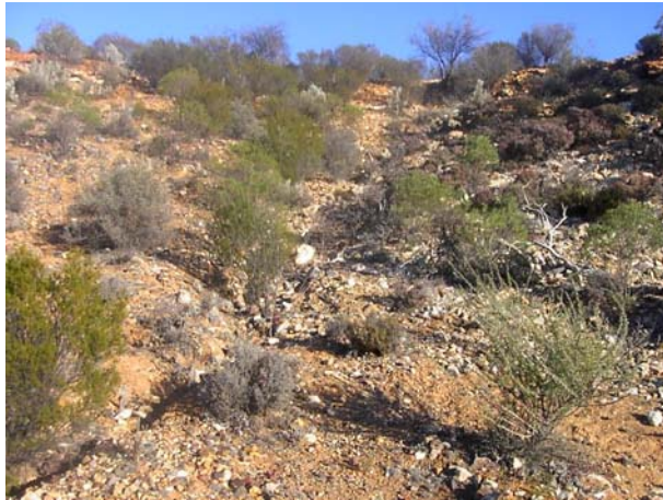
Photograph 2: Vegetation typical of areas described as Break-away.