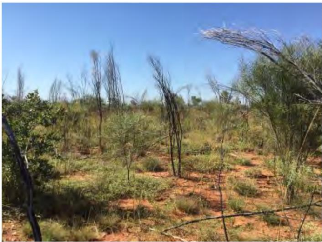
Figure 8 Q05: Brachychiton diversifolius subsp. diversifolius, Corymbia zygophylla, Acacia eriopoda shrub, Chrysopogon fallax, Sorghum plumosum, Eragrostis eriopoda, tussock grass. -18.0513, 122.6563. Photo taken in a western direction.