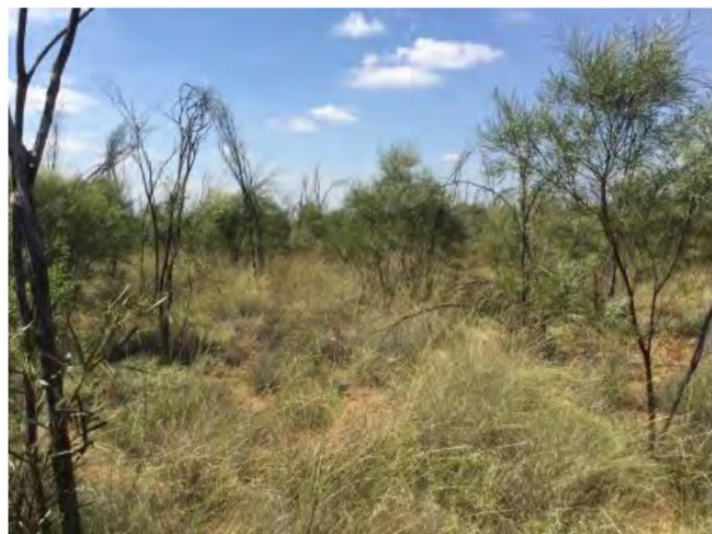
Figure 12 Q09: Brachychiton diversifolius subsp. Diversifolius, Acacia eriopoda shrub, Aristida holathera var. latifolia, Chrysopogon fallax, Eragrostis eriopoda, tussock grass. -18.0377, 122.6626. Photo taken in a Northern direction.