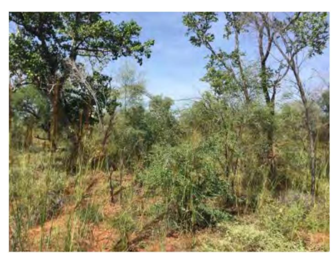
Figure 5 Q02: Corymbia zygophylla, Brachychiton diversifolius subsp. diversifolius, Bauhinia cunninghamii, Acacia eriopoda, Sorghum plumosum, Triodia caelestialis, tussock grass, hummock grass. -18.0530, 122.6464. Photo taken in a north-western direction.