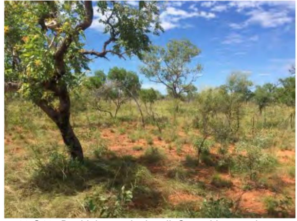
Figure 16 Q19: Bauhinia cunninghamii, Corymbia greeniana, Corymbia zygophylla, Chrysopogon fallax, Acacia platycarpa, tussock grass, shrub. -18.0636, 122.6306. Photo taken in a northeastern direction.