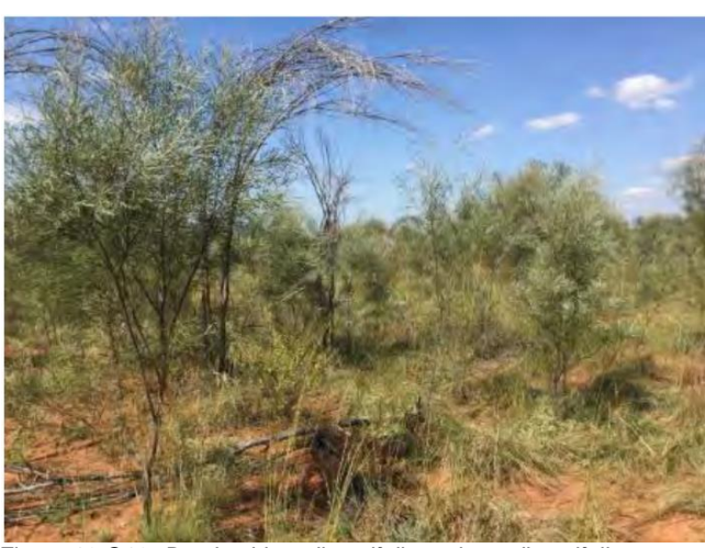
Figure 13 Q10: Brachychiton diversifolius subsp. diversifolius, Bauhinia cunninghamii, Acacia eriopoda shrub, Chrysopogon fallax, Sorghum timorense, Eragrostis eriopoda, tussock grass. -18.0444, 122.6675.