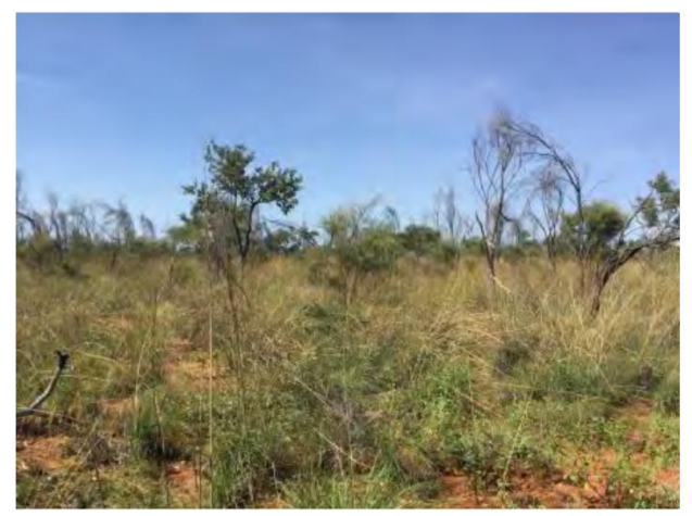
Figure 10 Q07: Corymbia zygophylla, Acacia eriopoda, Waltheria indica, Sorghum plumosum var. plumosum, tussock grass. -18.0648, 122.6405. Photo taken in a north-western direction.