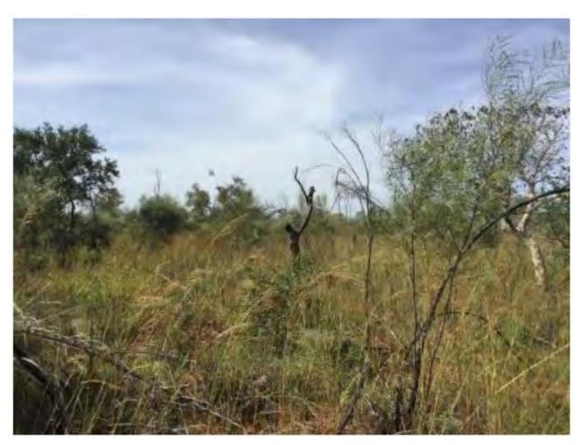
Figure 14 Q12: Corymbia zygophylla, Bauhinia cunninghamii, Brachychiton diversifolius, Acacia eriopoda shrub, Sorghum plumosum, tussock grass. -18.0702, 122.6694. Photo taken in a north-western direction.