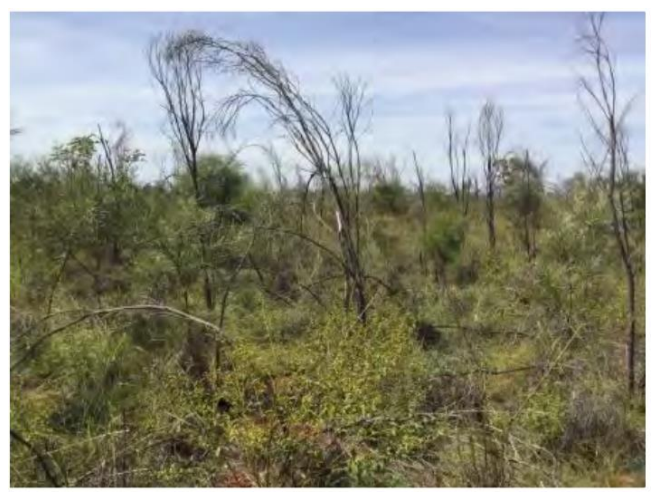
Figure 6 Q03: Acacia eriopoda, Waltheria indica shrub, Chrysopogon fallax, Whiteochloa airoides, tussock grass. -18.0654, 122.6649. Photo taken in a north-western direction.