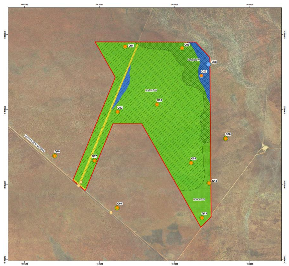
Figure 3: Flora and Fauna survey locations with dots of where site photos have been taken.