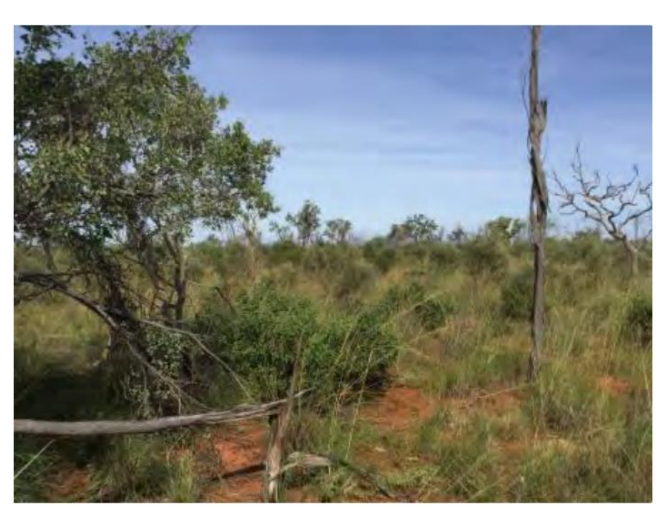
Figure 7 Q04: Brachychiton diversifolius subsp. diversifolius, Bauhinia cunninghamii, Acacia eriopoda shrub, Chrysopogon fallax, Triodia caelestialis, Sorghum plumosum, tussock grass, hummock grass. -18.0762, 122.6462. Photo taken in a north-eastern direction.