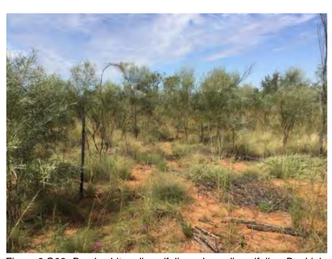
Figure 9 Q06: Brachychiton diversifolius subsp. diversifolius, Bauhinia cunninghamii, Acacia eriopoda shrub, Sorghum timorense, Aristida holathera var. holathera, Eragrostis eriopoda, tussock grass. -18.0595, 122.6736. Photo taken in a north-eastern direction.