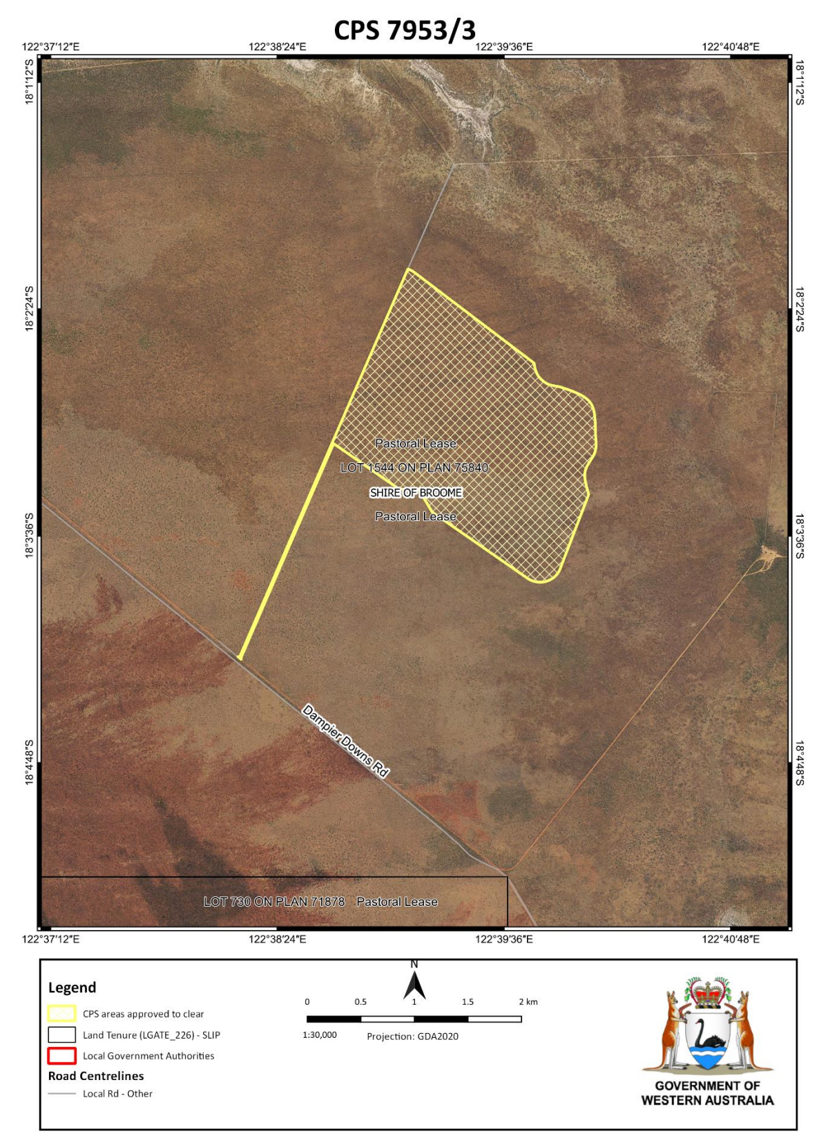
Figure 1 : Map of the application area. The area crosshatched yellow indicates the area authorised to be cleared under the granted clearing permit.