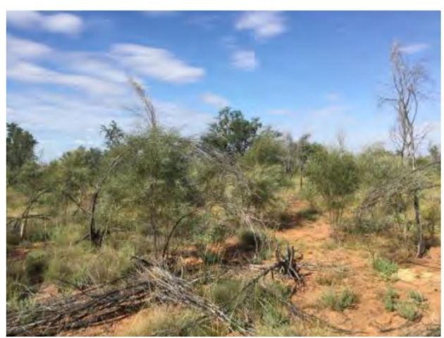
Figure 11 Q08: Bauhinia cunninghamii, Acacia eriopoda shrub, Aristida holathera var. Iatifolia tussock grass. -18.0416, 122.6693. Photo taken in a northern direction.