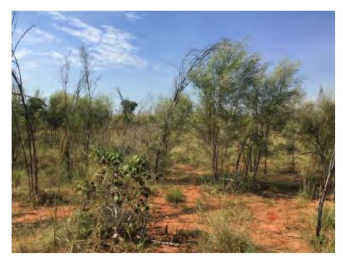
Figure 4 Q01: Brachychiton diversifolius subsp. Diversifolius, Acacia eriopoda, Sorghum plumosum , Triodia caelestialis , Aristida holathera var. latifolia , tussock grass, hummock grass. -18.0373, 122.6483. Photo taken in a north-western direction.