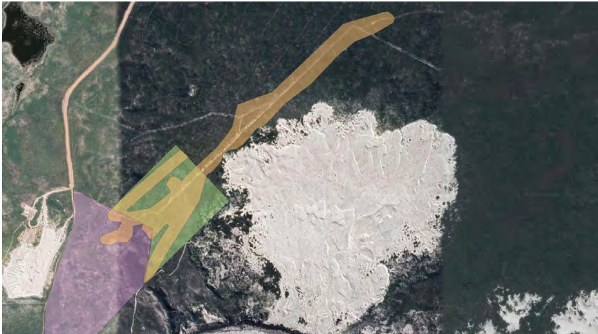
Figure 1: Austrostipa echinata search area (shaded orange). Original survey area shaded violet, extended survey area shaded green.

distinguishing between these species in the field, specimens having long awns and fine pointed leaves were collected and forwarded to the WA Herbarium for formal identification.