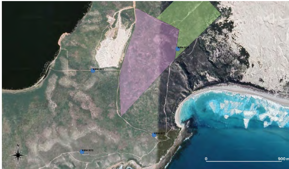
Figure 4: Collection location of Austrostipa mundula specimens within and beyond the survey site.