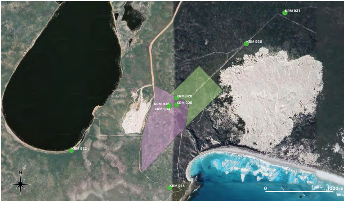
Figure 3: Collection location of Austrostipa flavescens specimens within and beyond the survey site.

No species of Austrostipa were found in either burnt or unburnt sections of the coastal area at Shelly Beach.