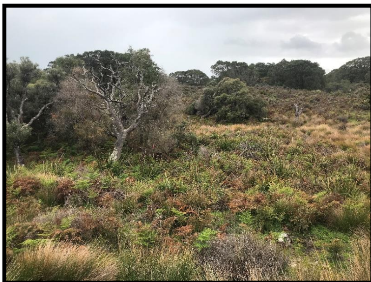
Plate 2: Lepidosperma gladiatum Sedgeland

A very small patch of Lepidosperma gladiatum Sedgeland at the western end was dense but contained numerous kangaroo tracks on which to walk and observe (Plate 2).