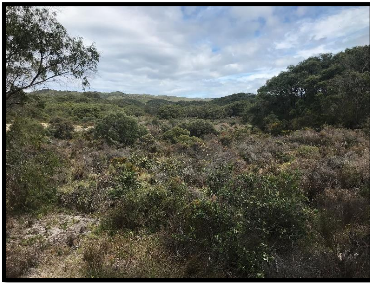
Plate 1: Open Heath Vegetation

A very small patch of Lepidosperma gladiatum Sedgeland at the western end was dense but contained numerous kangaroo tracks on which to walk and observe (Plate 2).