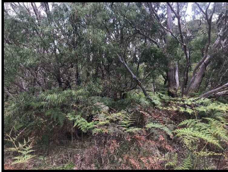
Plate 3. Bullich-Agonis Woodland

No Threatened flora species were recorded during the survey.