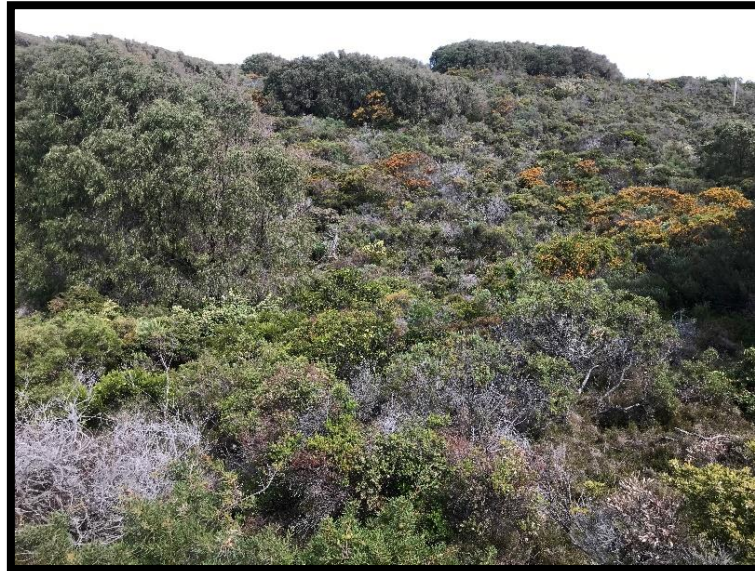
Plate 4: Vegetation on the Lime Pit Site

The dense vegetation made surveying along parallel transects impossible. Instead, as much ground as possible was walked in a grid pattern through the dense vegetation with greater coverage on the slightly less dense upper slopes and ridges.