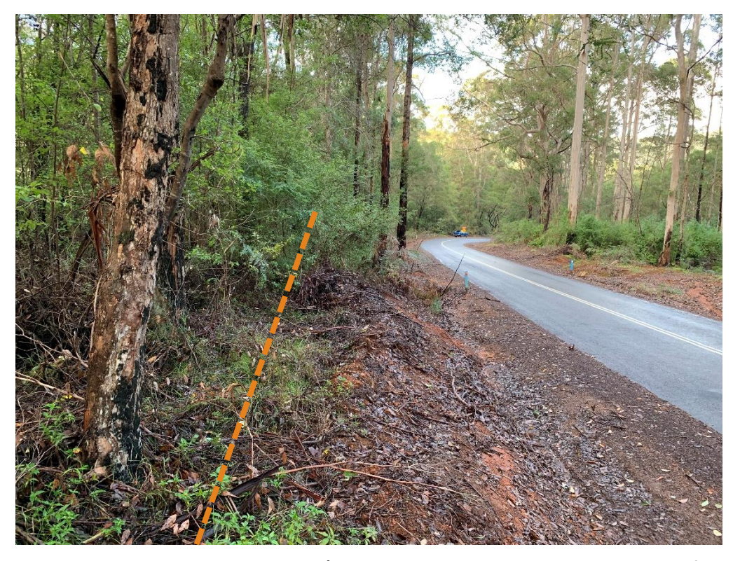
Plate 2: Representative photograph (dashed orange line represents boundary of application area)