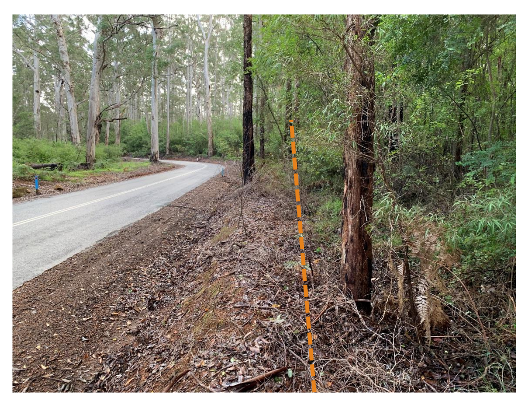
Plate 3: Representative photograph (dashed orange line represents boundary of application area)