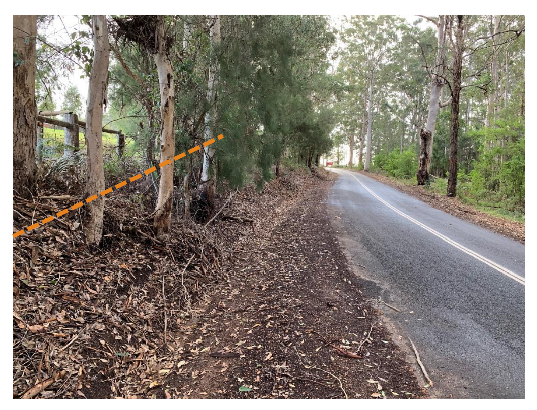
Plate 1: Representative photograph (dashed orange line represents boundary of application area)