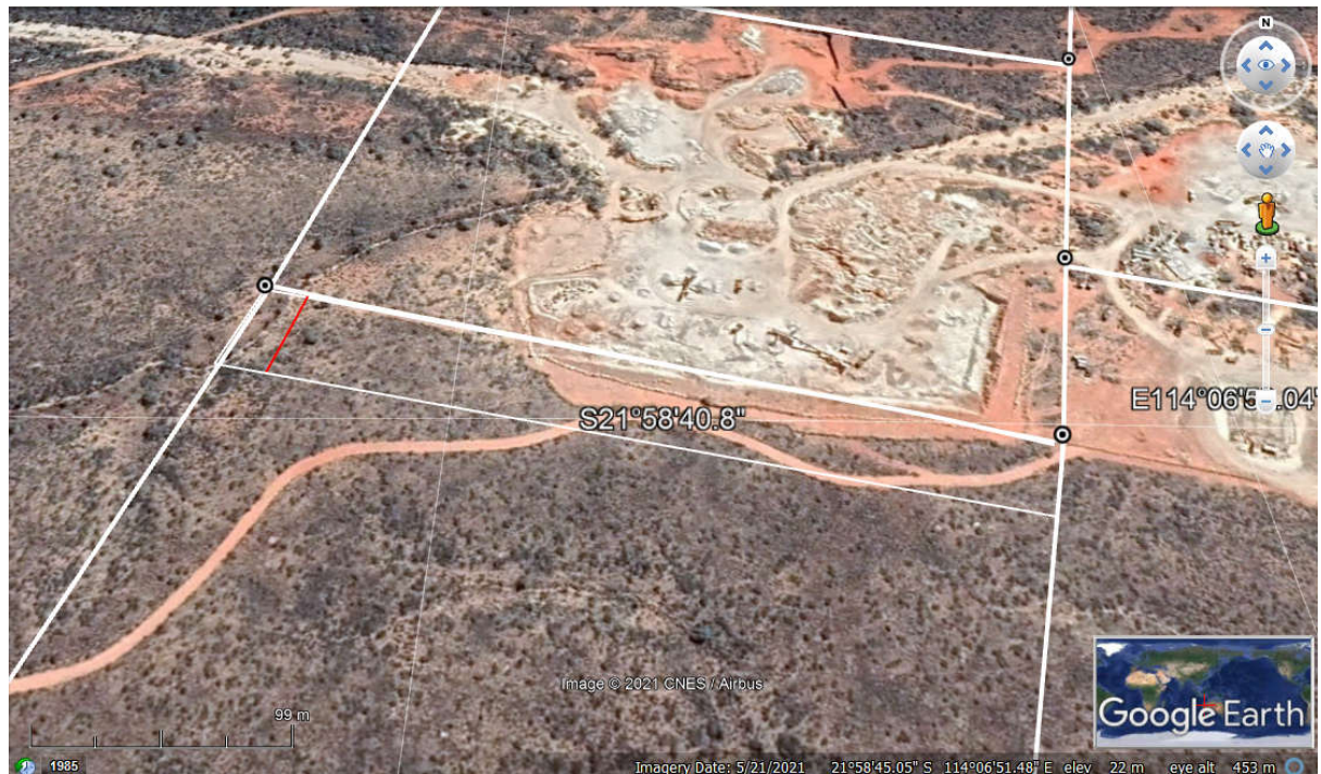
Figure 1. Aerial view of proposed clearing area, red line indicates limit of clearing.

Aerial photographs and site photographs of the area proposed to be cleared. Provided as polygon shape file and figures 1- 4.