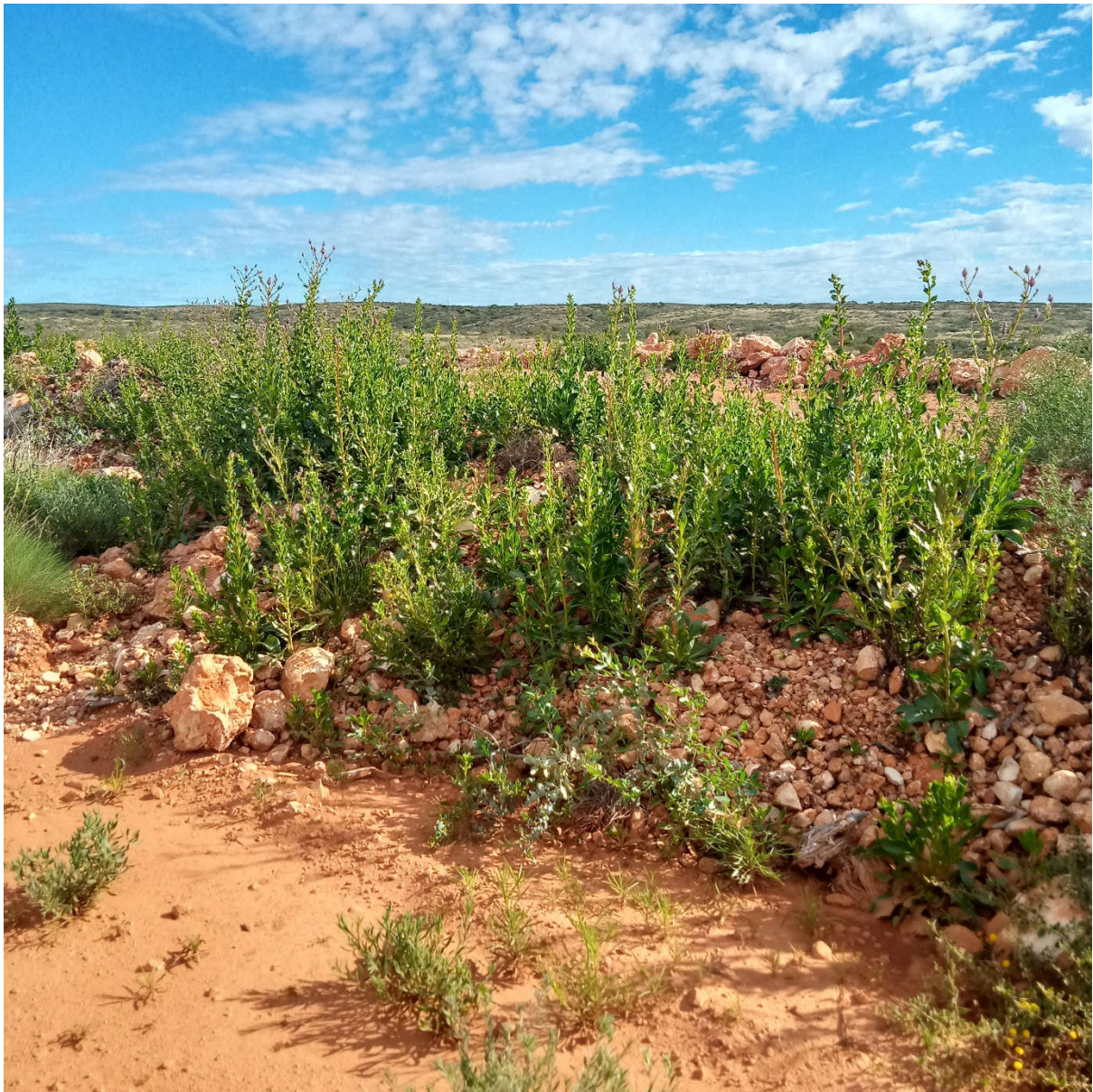
Figure 3. Topsoil bund, sprouting Mulla Mulla sp. after recent rains, limestone safety barrier in the background.