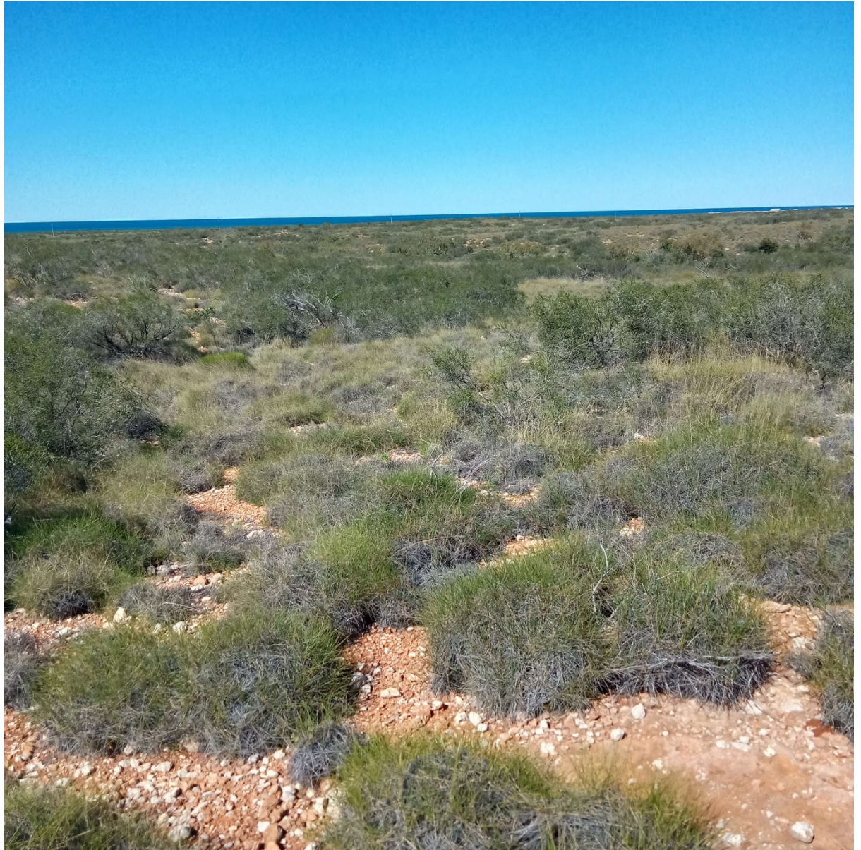
Figure 2. Typical vegetation and soil in the undisturbed section of proposed clearing area.