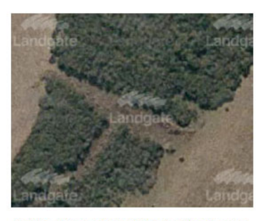
Picture 3: Image from 2007 showing the area cleared of existing native vegetation.