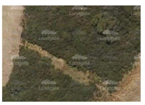
Picture 4: Image from 2017 showing limited vegetation regrowth over a 10 year period.