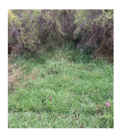
Figure 3. Representative photographs of the application area