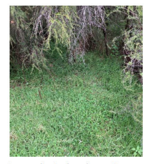
Pictures 5, 6, 7 & 8: Taken from within the proposed clearing area showing how the area is now primarily made up of kikuyu and other weeds