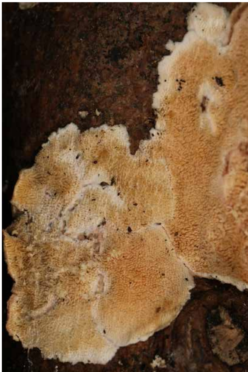
Crustomyces aff. Subabruptus