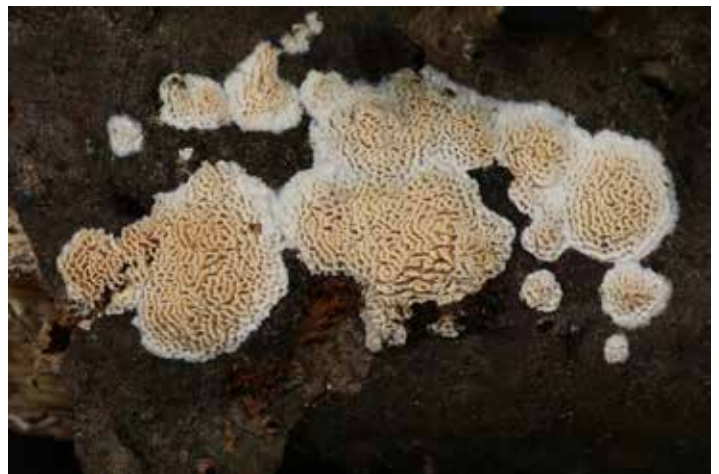
Schizopora radula

Crust fungi are probably not for everyone but if we can motivate and train a few people in every club, we can make progress on these fascinating fungi. In this way, our workshop could be a model for other groups of fungi at future NAMA or NEMF forays: Get experts on a group of difficult fungi – say Russula or Cortinarius or most any ascomycete group – to lead a workshop to train eager participants and document and sequence a couple of dozen specimens. The former will build the skills of serious amateurs; the latter will make a valuable contribution to science.