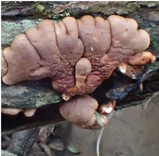
Tea-tree Fingers ( Hypocreopsis ampletens , SJM McMcMullan-Fisher)