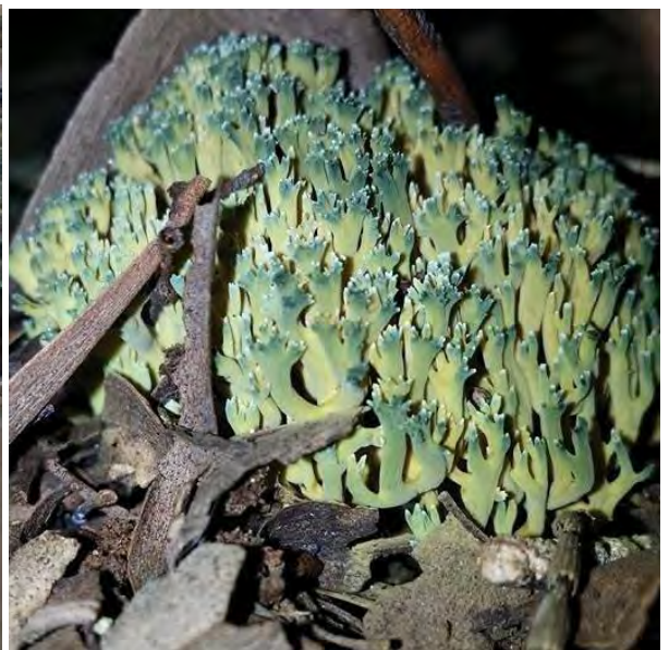
Green-staining Coral ( Phaeoclavulina abietina)