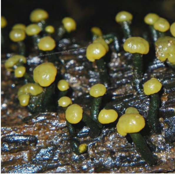
Two-tone Pin ( Chlorovibrissea bicolor,)