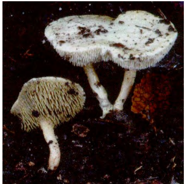
Beenak Long Tooth ( Beenakia dacostae,)