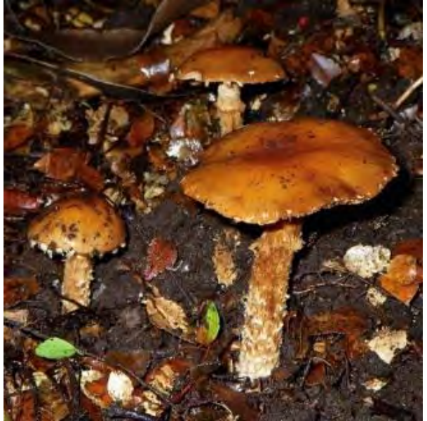
Russet Rozites ( Cortinarius perfoetens,)