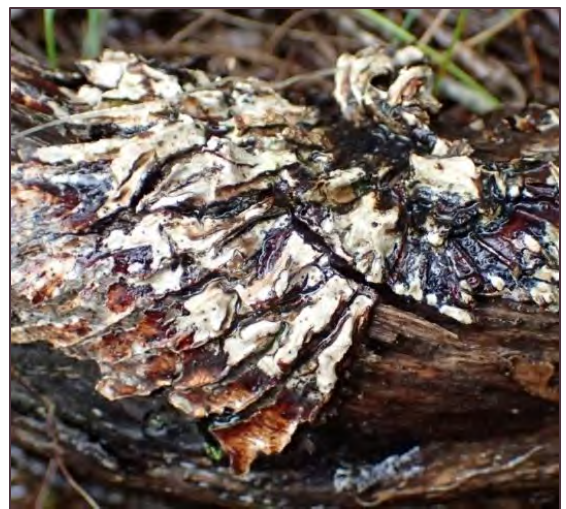
Photo-monitor by taking photos every month or two from the same position during the growing season (~Feb – October). Please take several images of fruit bodies from different angles each time you monitor. Include a scale like a ruler in some of the pictures.