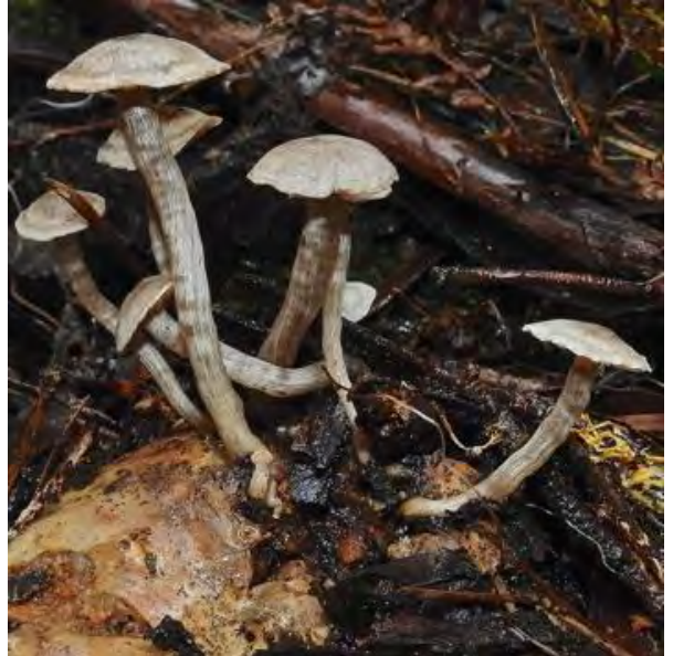
Grey Jockey ( Asterophora mirabilis,)