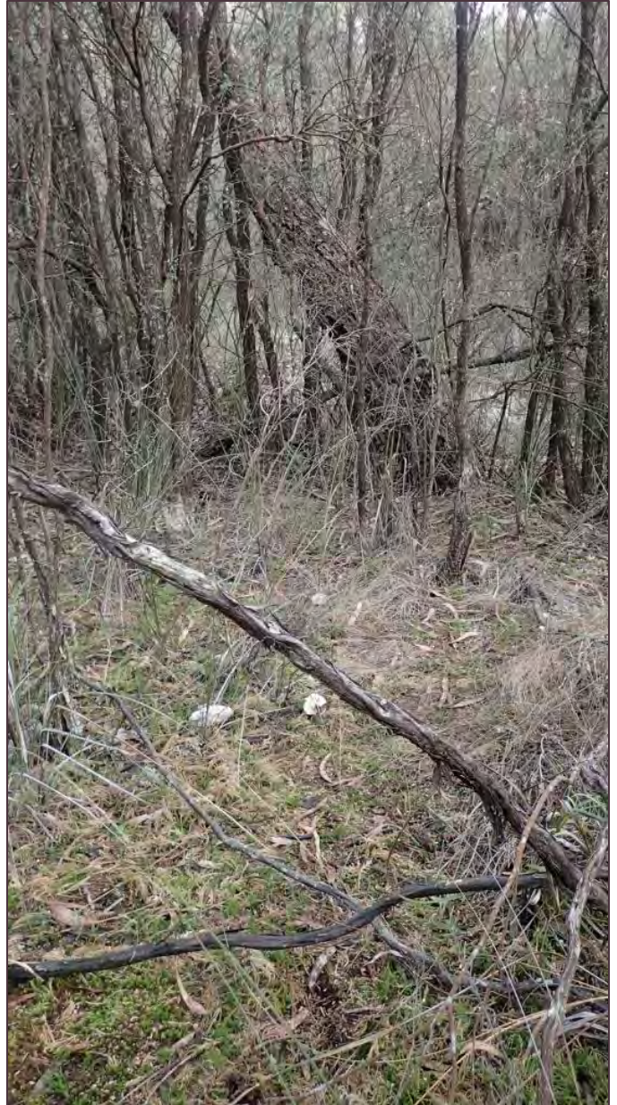
SJM McMullan-Fisher CC-BY-SA

Typically it favours wood that is dead but not yet lying on the ground.