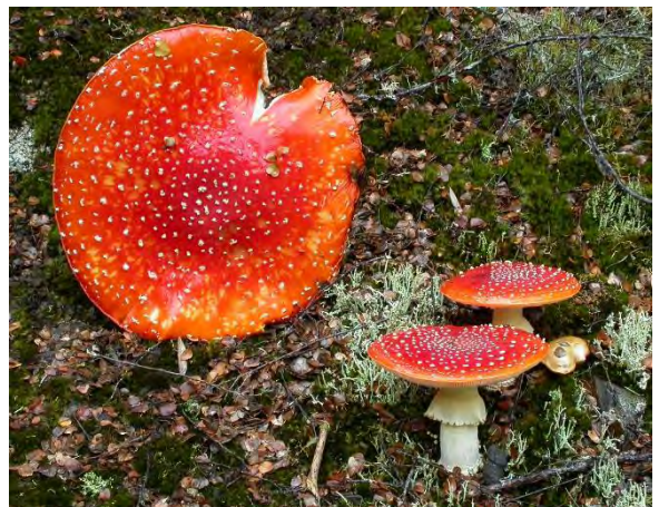
☹️ Fly Agaric ( Amanita muscaria , Ian Bell)

This weedy mycorrhizal fungus came in with Pine trees. As well as many exotic trees it is a less useful partner to Eucalypts and Myrtle Beech trees.