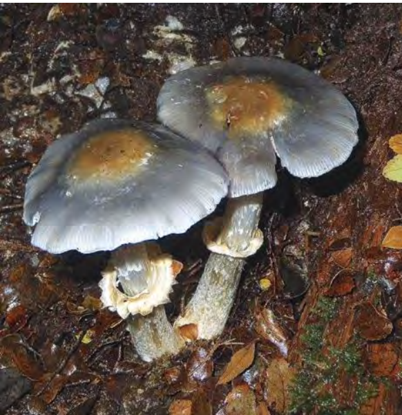
Steel-blue Rozites ( Cortinarius metallicus,)