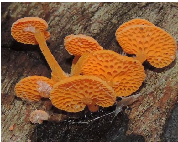
☹️ Orange Ping-pong Bats ( Favolaschia calocera , Richard Hartland)

This weedy wood rot fungi pushes out the diversity of native fungal recyclers. They can spread spores from high in the canopy so best to prevent them getting into your local bushlands.