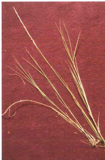
Salt water couch