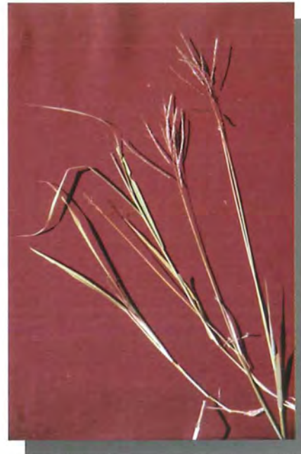
Indian bluegrass or couch