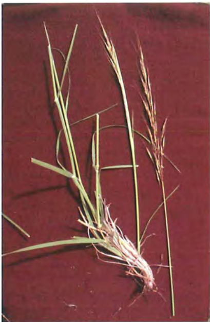
Ribbon or golden beard grass