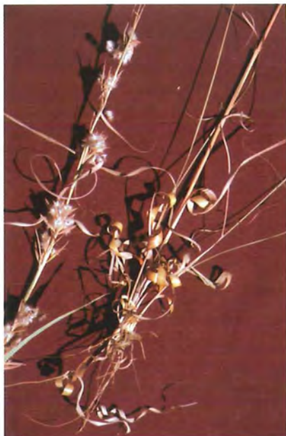
Silky oil grass