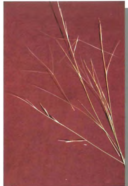
Northern kerosene wiregrass