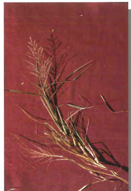
Spiny mud grass