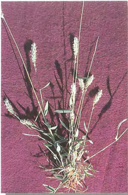
Mulga mitchell grass