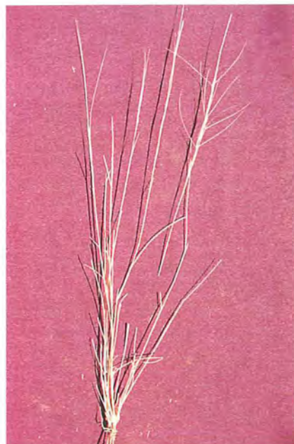
Bunched kerosene grass