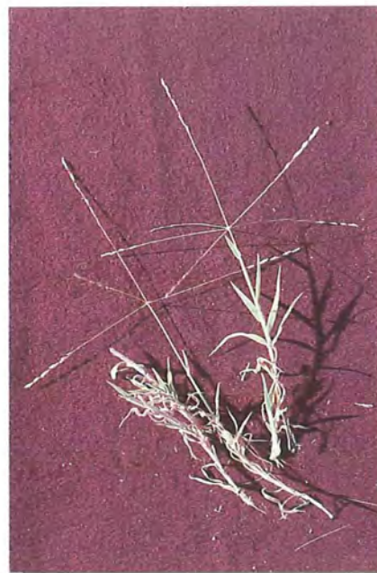
Silky umbrella grass