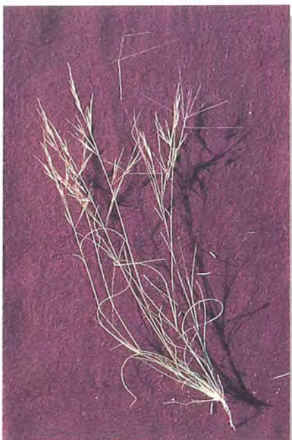
Erect kerosene grass