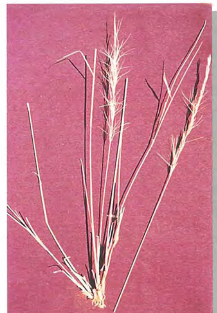
Another common wiregrass