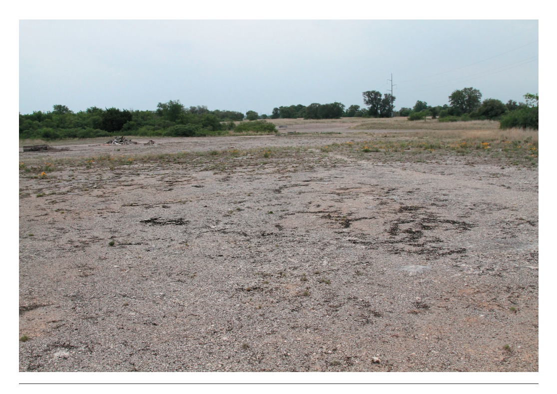
Fi6. 3. Typical Dalea reverchonii habitat, Rocky Walnut Limestone glade with thin soil over exposed bedrock. Photo taken 24 Apr 2011, Utley site, Parker County, Texas.

cedar glades as D. reverchonii does in the Walnut Limestone glades. Both species in Series Purpureae thrive in shallow soil and cracks in exposed limestone bedrock (Barneby 1977). Baskin and Baskin (1988) suggest that marginal populations of widespread species, through catastrophic selection, "could result in narrow edaphic endemics...[and] may have played a role in the evolution of some of the rock outcrop endemic taxa, especially those that are closely related to widely distributed taxa within their geographic region." Both D. gattingeri and D. reverchonii are on the margins of the geographic range of the closely related D. purpurea Vent. Catastrophic selection in marginal D. purpurea populations may have resulted in the evolution of both limestone glade endemic taxa.