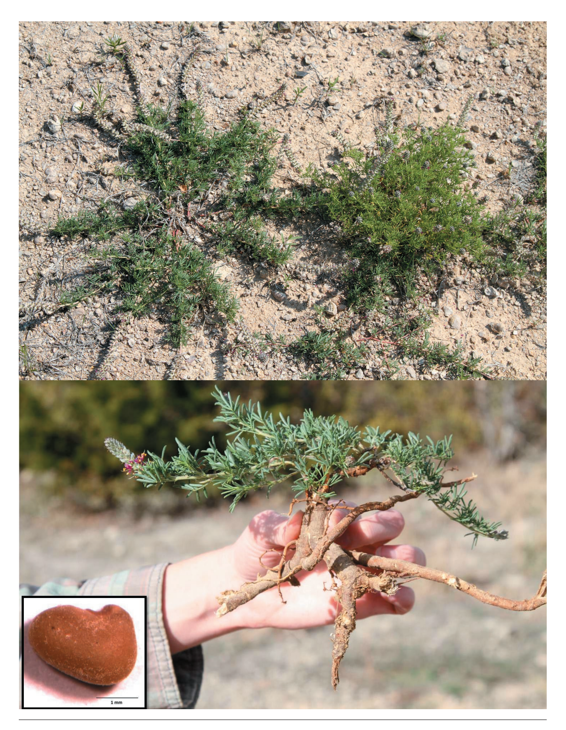
FiG. 2. Top – Dalea reverchonii plants showing prostrate habit of older plants (left) and more erect habit of younger growth (right). Photo taken 7 May 2011, New Highland Rd. site, Parker County. Bottom – Dalea reverchonii plant showing woody taproot and seeds (inset). Seeds have a hard coat and are 1.7 × 2.7 mm. Photo taken 11 Nov 2011, Summit Ridge glade site, Parker County.