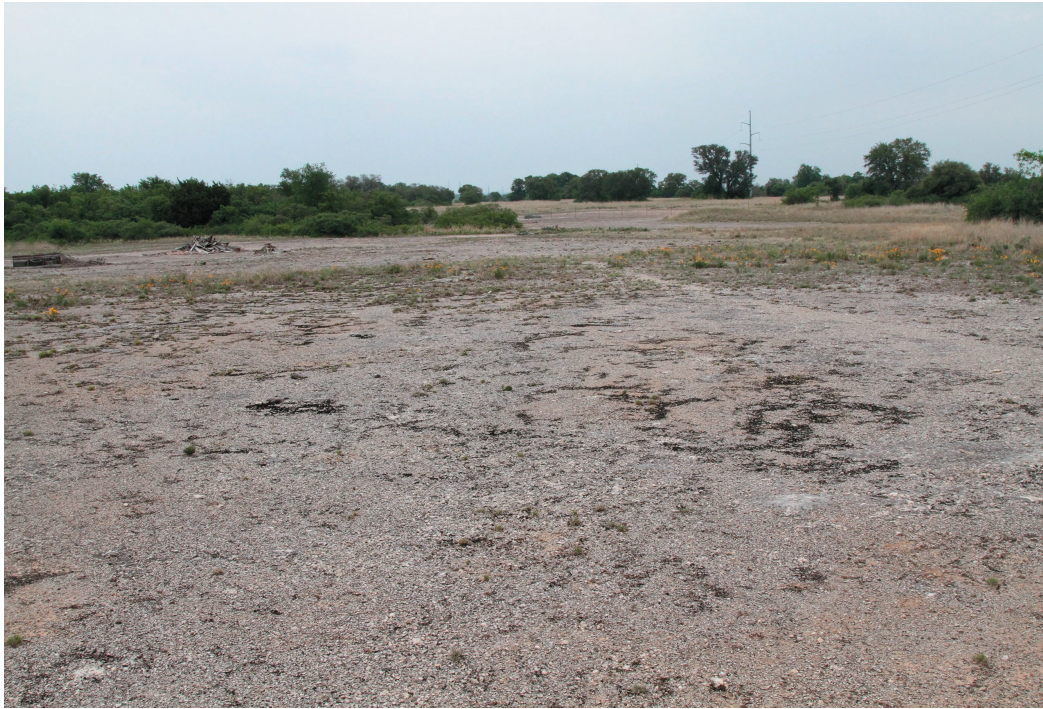
FIG. 3. Typical Dalea reverchonii habitat, Rocky Walnut Limestone glade with thin soil over exposed bedrock. Photo taken 24 Apr 2011, Utley site, Parker County, Texas.

cedar glades as D. reverchonii does in the Walnut Limestone glades. Both species in Series Purpureae thrive in shallow soil and cracks in exposed limestone bedrock (Barneby 1977). Baskin and Baskin (1988) suggest that marginal populations of widespread species, through catastrophic selection, “could result in narrow edaphic endemics...[and] may have played a role in the evolution of some of the rock outcrop endemic taxa, especially those that are closely related to widely distributed taxa within their geographic region.” Both D. gattingeri and D. reverchonii are on the margins of the geographic range of the closely related D. purpurea Vent. Catastrophic selection in marginal D. purpurea populations may have resulted in the evolution of both limestone glade endemic taxa.