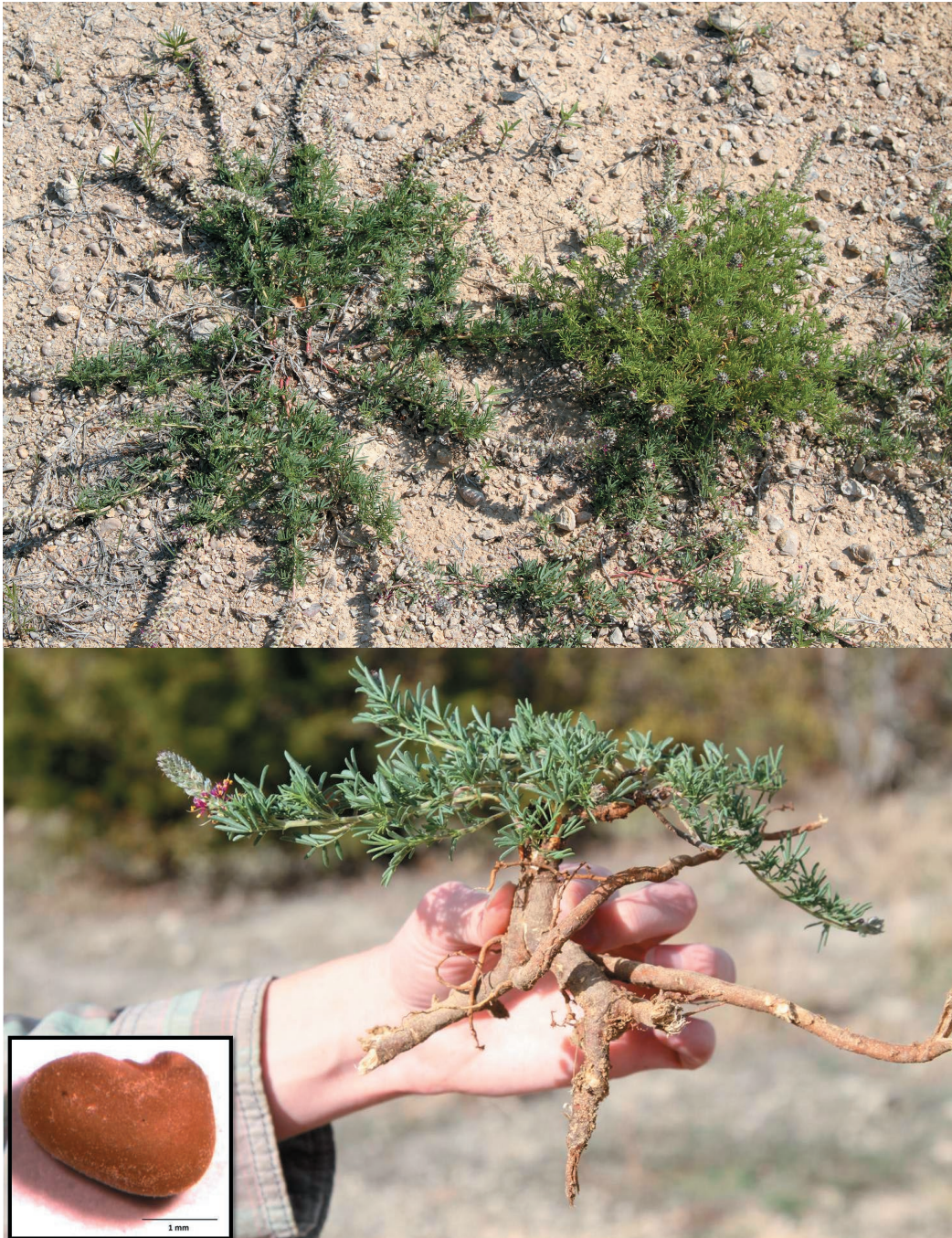
FIG. 2. Top – Dalea reverchonii plants showing prostrate habit of older plants (left) and more erect habit of younger growth (right). Photo taken 7 May 2011, New Highland Rd. site, Parker County. Bottom – Dalea reverchonii plant showing woody taproot and seeds (inset). Seeds have a hard coat and are 1.7 \times 2.7 mm. Photo taken 11 Nov 2011, Summit Ridge glade site, Parker County.