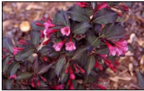
Wine And Roses ('Alexandra')