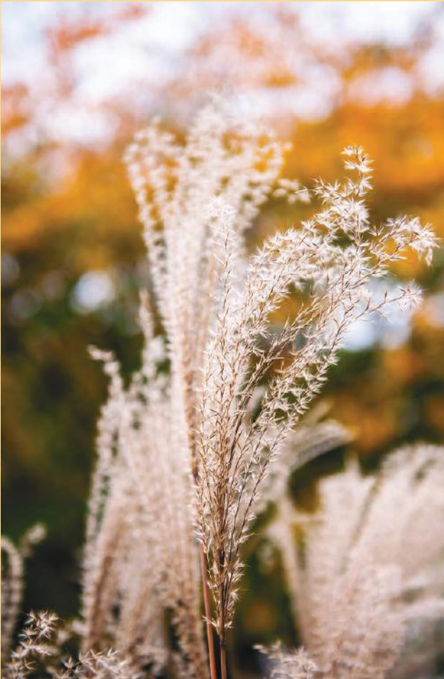
Photos from the Duke Gardens/ Nasher Museum of Art workshop "Collections Come to Light,". Photos feature koi in the Fish Pool, maiden grass ( Miscanthus sinensis 'Morning Light'), and Ginkgo biloba leaves.