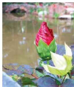
The Welch Woodland Garden Overlook (top); hibiscus ( Hibiscus moschutos ) in the Woodland Garden (center). Facing page: Cardinal flower ( Lobelia cardinalis ) in the Woodland Garden.

The Spring Woodland Garden's new design is an exciting transformation from its understated past, and as we add new plantings through the fall, it will look better still. We are thankful to Bert Welch for his enthusiastic support of this exciting new feature.