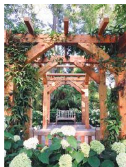
Clockwise from top left: Crane sculptures in the Virtue Peace Pond; students in the Fisher Amphitheater; new pergola in the Page-Rollins White Garden.

Two large crane sculptures that had been in storage for several years emerge now from the pond, an elegant addition that our wedding clients particularly love. And the pond-side pergola was growing unstable from age, so we replaced it, working with landscape architect David Swanson on a new design. The new red cedar pergola suits the landscape beautifully, with curved lines that softly echo the grand arches of the Gothic Pavilion at the other end of the garden, as well as the nearby “Celebration” sculpture that visitors can admire through the frame of the pergola.