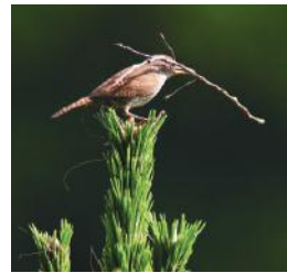
Clockwise from top: Baby pam pie pumpkin growing in the Charlotte Brody Discovery Garden; bluet blooms and mosses in the Asiatic Arboretum; wren on a pine branch; and fevertree ( Pinckneya bracteata ) at the Sunny Pond in the Blomquist Garden of Native Plants.