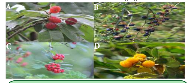
Fig. 1. Wild edibles fruits (A) Myrica esculanta (B) Prinsepia utilis C) Pyracantha crenulata (D) Rubus ellpticus

raw medicinal herbs of Indian origin from the Western nations. The demand for traditional herbal drugs is also increasing rapidly mainly because of the harmful effects of synthetic chemical drugs and also because of an expansion of pharmacies manufacturing natural drug formulations. Our country is the proud possessor of an impressive medical heritage which encompasses various systems of medicine, viz., Ayurveda, Siddha, Unani and grandma medicine. India has an invaluable treasure trove of various scriptures on diverse medical systems. India is endowed with incredible natural plant resources of pharmaceutical and nutraceutical value and can become potential supplier of phytopharmaceutical, alkaloids а raw medicinal herbs for the emerging word market. and