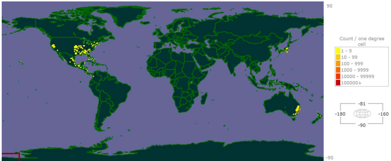
Figure 2: GBIF worldwide distribution for Andropogon virginicus . Records are missing in the EPPO region (France, Georgia and in the Russian Federation).

Biodiversity occurrence data accessed through GBIF Data Portal, data.gbif.org, 2014-04-03.