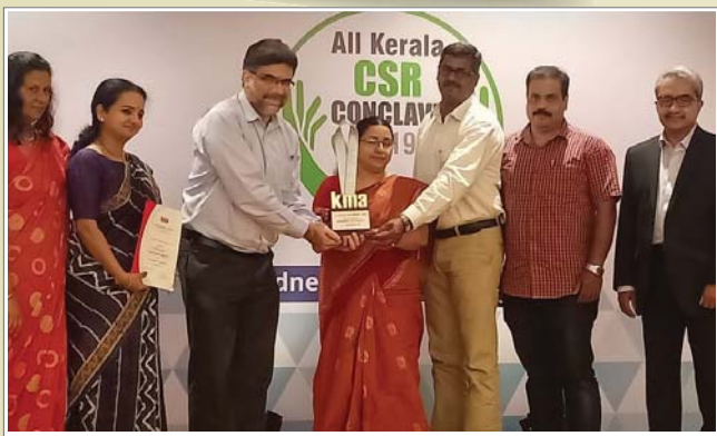
CSR Award in Environment & Greenery Category