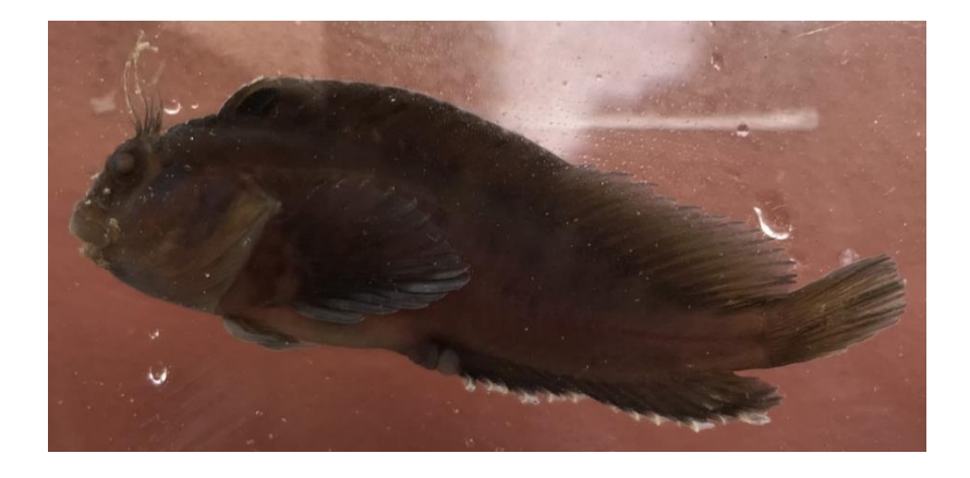
17 Quick Guide to Georgia Fish Families

Blenniidae (combtooth blennies): Most species are small (< 15cm) and naked (scaleless) with a strongly sloping head. Fleshy projections (cirri) may be present on head. Jaws with comblike teeth. Soft and spiny-rayed fins. Marine