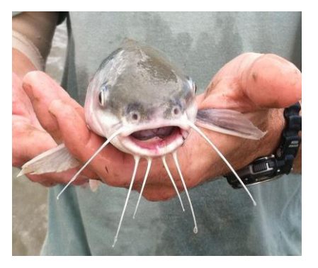
Ictaluridae (N. American freshwater catfishes): single dorsal fin, pelvic fins on belly, spines in dorsal and pectoral fins, scales absent, adipose fin present, four pairs of barbels, including one set near the nares. Primarily Freshwater.