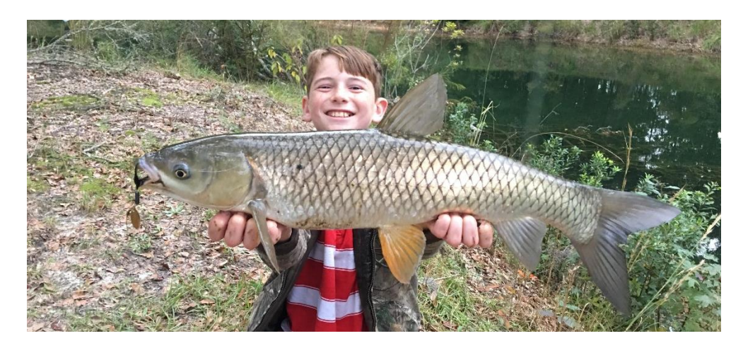
8 Quick Guide to Georgia Fish Families, Copyright Brett Albanese 2023

Xenocyprididae (east Asian minnows or sharp bellies): Only 1 introduced species in Georgia, the grass carp (Ctenopharyngodon idella).