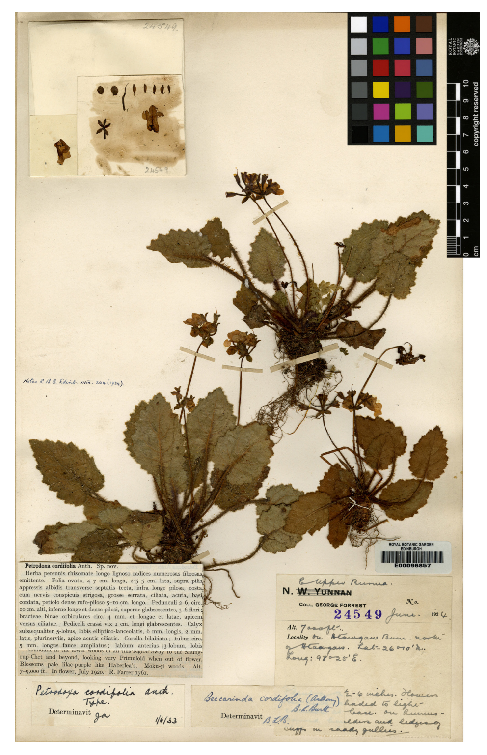
Figure 2. Holotype sheet of Beccarinda cordifolia (G. Forrest 24549, E barcode E00096857, <a href="https://data.rbge.org.uk/search/herbarium/?specimen_num=119340&cfg=zoom.cfg&filename=E00096857.zip">https://data.rbge.org.uk/search/herbarium/?specimen_num=119340&cfg=zoom.cfg&filename=E00096857.zip</a>).

Primula erythra Fletcher subsp. subansirica (G.D. Pal) Halda (1992, p. 179). Primula firmipes Balf. f. et Forrest subsp. subansirica (G.D. Pal) Basak et Maiti (2014, p. 365).