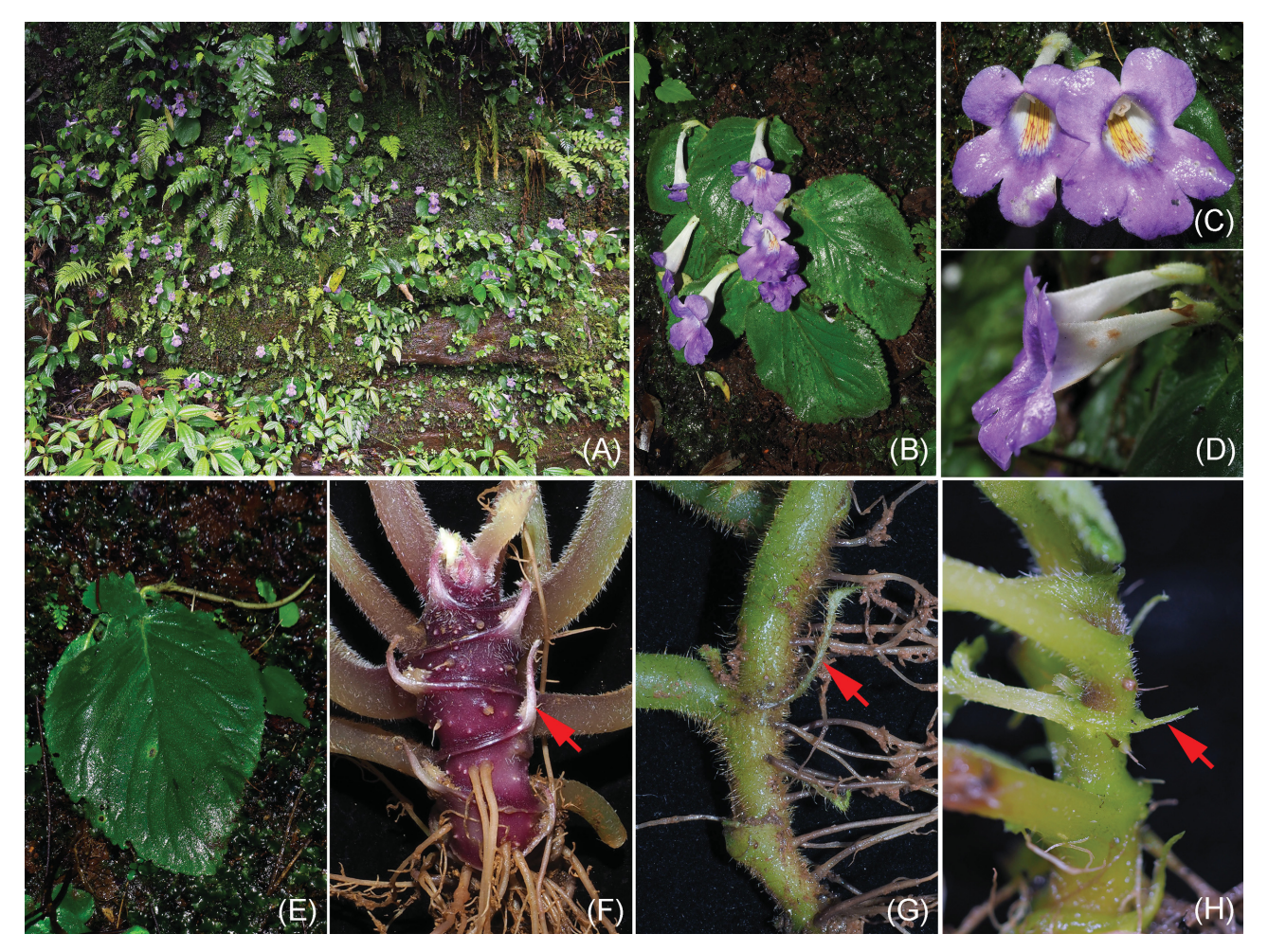
FIGTURE 3. Henckelia inaequalifolia Li H. Yang & X.Z. Shi. (A–E) and three other species (F–H) with a small lanceolate leave at the opposite position of a large one. (A) habitat, (B) flowering plants in nature, (C) flower in front view, (D) flower in side view, (E) fruiting plant, (F) H. fruticola (H.W. Li) D.J. Middleton & Mich. Möller, (G) H. speciosa (Kurz) D.J. Middleton & Mich. Möller, (H) H. grandifolia A. Dietr.. Red arrows show the small leaves. Photos of H. inaequalifolia were taken from its type locality, and photos of H. fruticola , H. speciosa , and H. grandifolia were taken from greenhouse of SCBG.