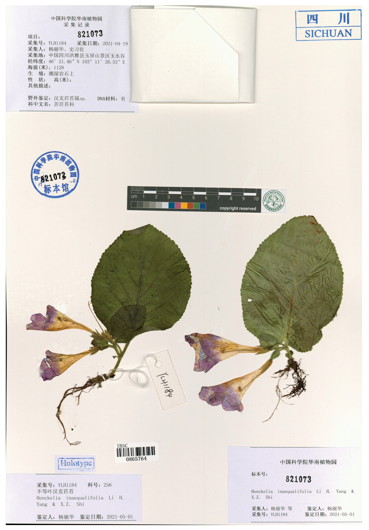
FIGTURE 2. Holotype (IBSC-0865764) of Henckelia inaequalifolia Li H. Yang & X.Z. Shi.