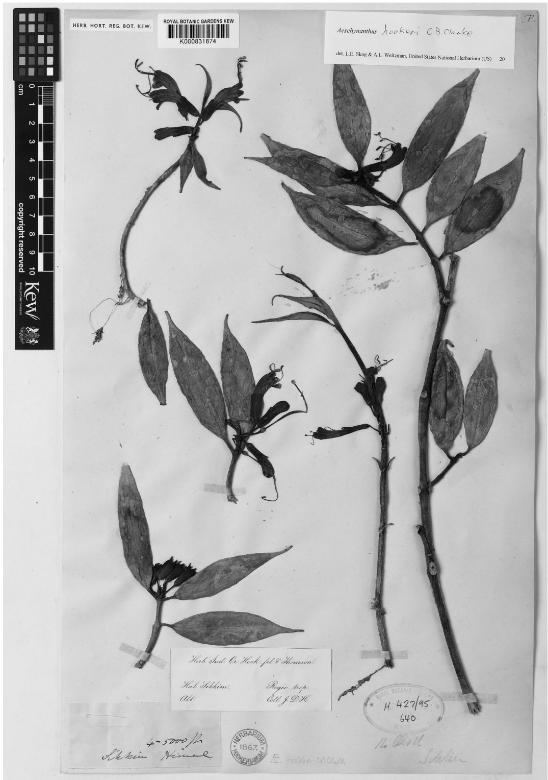
Fig. 1. Lectotype of Aeschynanthus hookeri C. B. Clarke ( http://specimens.kew.org/herbarium/K000831874 ).