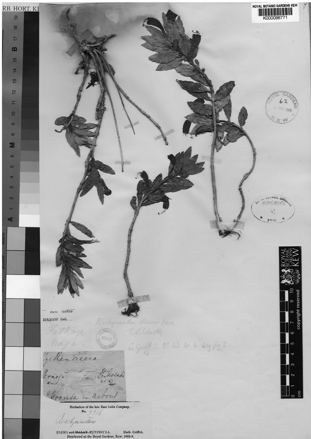
Fig. 2. Lectotype of Aeschynanthus mannii Kurz ex C. B. Clarke ( http://specimens.kew.org/herbarium/K000096771 ).