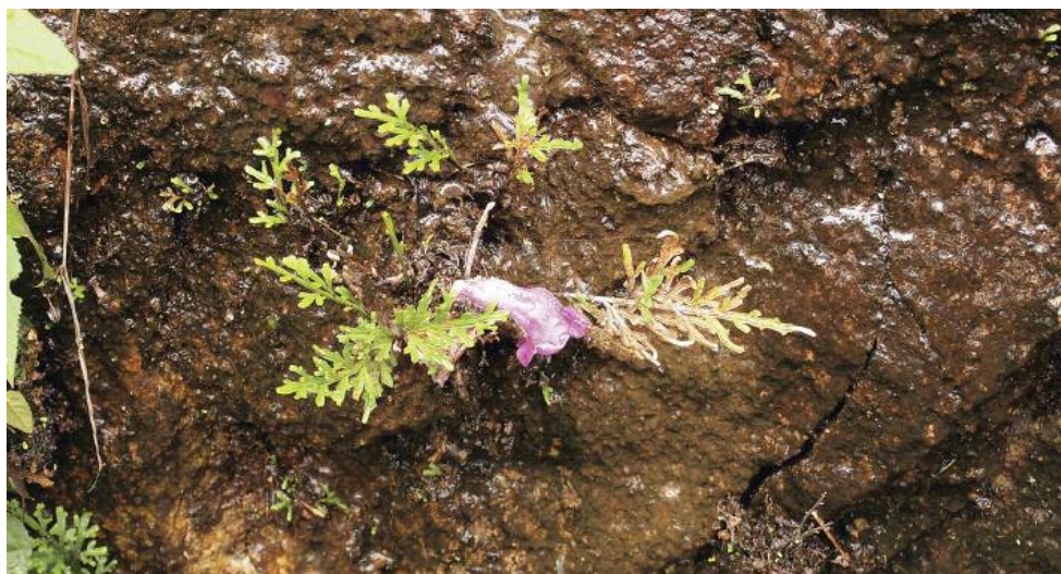
A shed corolla of Sinningia aghensis resting on a sprig of Selaginella at the base of the wet granite rock.