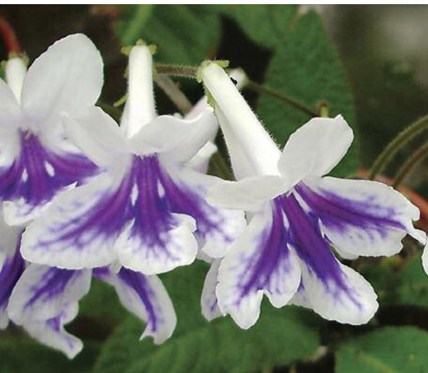
Streptocarpus 'Moon River'

Streptocarpus 'Pink Champagne' , 2012, IR121199, Kim Williams, UK. ( S. 'Double Delight' × S. 'Franken Ziva'). Cross made and planted 2011, first flowered 2012. Reproducible only vegetatively. Medium sized rosette. Leaves medium green, 10 in. long × 4 in. wide, lanceolate with serrate margin, acute tip and cuneate base. Calyx green, split. Peduncle 9 in. tall with 2 flowers. Corolla salverform, 2.5 in. long × 2.5 in. wide, bright pink with darker veining over the whole flower.