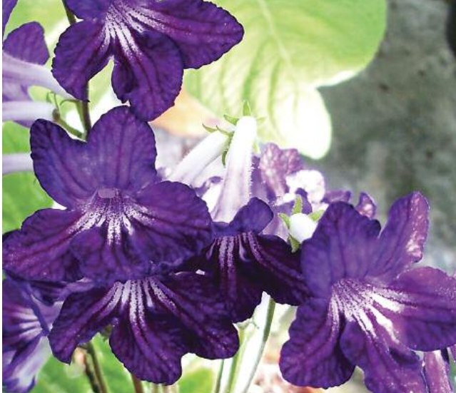
Streptocarpus 'Little Lottie'

Reproducible only vegetatively. Small sized rosette. Leaves medium green, 8 in. long × 2.5 in. wide, lanceolate with serrate margin, acute tip and cuneate base. Calyx green, split. Peduncle 7 in. tall with up to 6 flowers. Corolla salverform, 1.5 in. long × 1.5 in. wide, purple with white suffusion in throat.