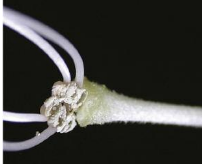
Pollination: placing pollen on the stigma

stigma. The filaments on anthers can show diversity in that some have extra hairs and some are brightly colored or even striped.