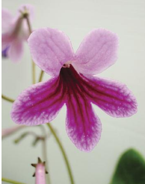
Streptocarpus 'Pink Ink'

Streptocarpus 'Pink Ink' , 2012, IR121200, Kim Williams, UK. ( S. 'Penelope' × S. 'Inky Fingers'). Cross made and planted 2011, first flowered 2012. Reproducible only vegetatively. Medium sized rosette. Leaves medium green, 8 in. long × 3 in. wide, lanceolate with serrate margin, acute tip and cuneate base. Calyx green, split. Peduncle 9 in. tall with 4 flowers. Corolla salverform, 2 in. long × 2.5 in. wide, light pink upper lobes, lower lobes darker pink with dark lines extending from throat, a pink version of 'Inky Fingers'.