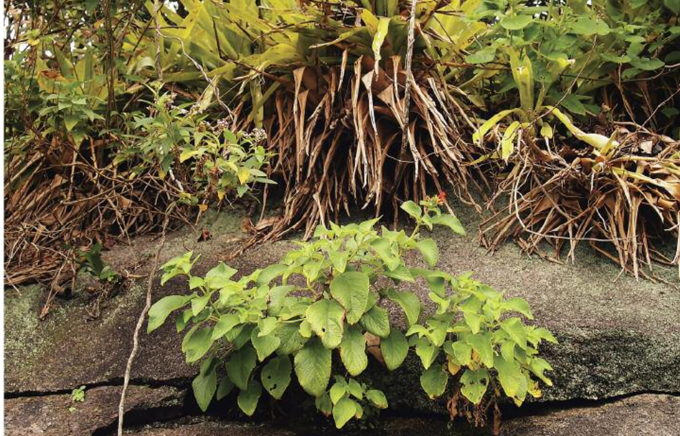
Sinningia aggregata growing with bromeliads on a rock above the beach at Indaiá, SP.

take us on a botanical excursion for 40 reis (about $20), which seemed like a bargain to me. Lucio took us to a place called Jirau, where the forest was quite dense. There were open areas within the forest, and it was here that Sinningia richii grew in great profusion. There were so many plants that in some spots they were like a ground cover. Most were not in flower, but we managed to find several with buds and were able to confirm that the population had yellow flowers.