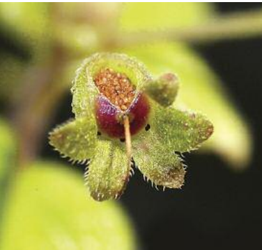
Diastema latiflorum 9669: splash-cup fruit with seeds and 3 black nectaries

The peduncles , which are commonly called "flower stems," usually emerge from leaf nodes. See Alan LaVergne's website for excellent definitions and diagrams concerning flowers at: http://www.burwur.net/sinns/3inflor.htm .