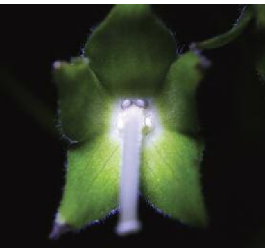
Sinningia hybrid calyx and nectaries: top two nectaries are silvery; others are white