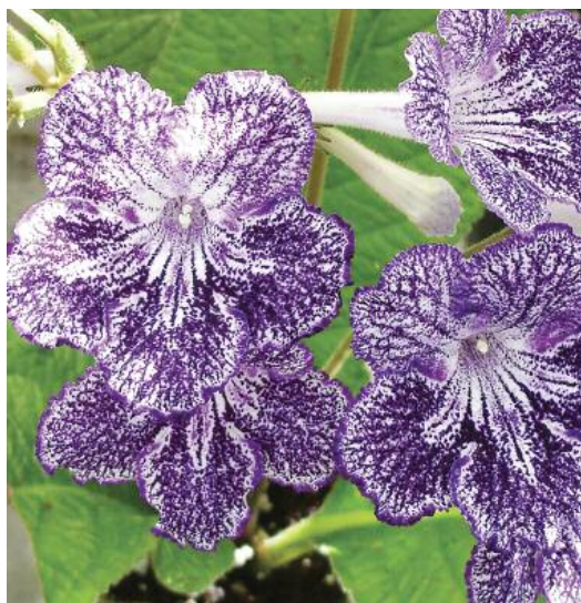
Streptocarpus 'Purple Lace'

Streptocarpus 'Raspberry Ice' , 2012, IR121203, Kim Williams, UK. ( S. 'Double Delight' × S. 'Franken Ziva'). Cross made and planted 2011, first flowered 2012. Reproducible only vegetatively. Medium sized rosette. Leaves medium green, 8 in. long × 3.5 in. wide, lanceolate with serrate margin, acute tip and cuneate base. Calyx green, split. Peduncle 7.5 in. tall with 3 flowers. Corolla salverform 2.5 in. long × 2.5 in. wide, white with raspberry spots and veins over whole flower, white throat with raspberry veins extending onto all lobes.