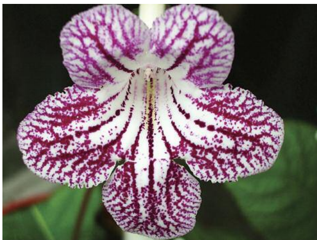
Streptocarpus 'Raspberry Ice'