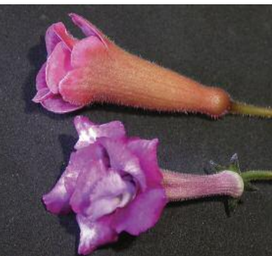
Calyx double above without a calyx; petal double on the bottom with a calyx

The pistil is the female part of the flower and consists of an ovary at the base, then a long style that ends with a stigma. Often the style is very short when the flower first opens and the stigma is not receptive but as the style lengthens over days, the stigma changes in appearance and becomes receptive to pollen. This usually occurs after the flower has been open a couple of days. Some gesneriads produce long styles so that the stigmas extend far beyond the corolla tube.