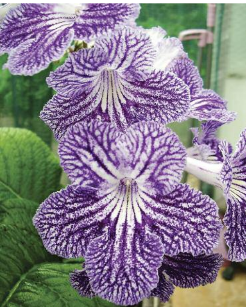
Streptocarpus 'Lavender Daze'

Reproducible only vegetatively. Medium sized rosette. Leaves medium green, 8 in. long × 3.5 in. wide, lanceolate with serrate margin, acute tip and cuneate base. Calyx green, split. Peduncle 7 in. tall with up to 5 flowers. Corolla salverform, 2 in. long × 2 in. wide, white background with heavy burgundy lacing, darkening with age, a dark burgundy "necklace" on the lower lobes.