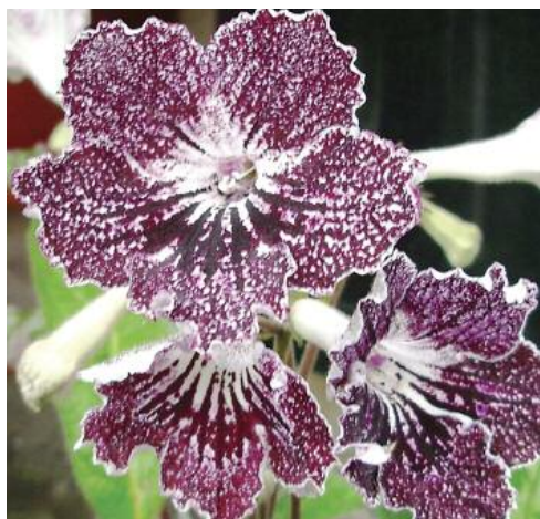
Streptocarpus 'Burgundy Lace'

Streptocarpus 'Aries' , 2012, IR121194, Kim Williams, UK. ( S. 'Penelope' × S. 'Inky Fingers'). Cross made and planted 2011, first flowered 2012. Reproducible only vegetatively. Medium sized rosette. Leaves medium green, 8 in. long × 4 in. wide, lanceolate with serrate margin, acute tip and cuneate base. Calyx green, split. Peduncle 9.5 in. tall with up to 6 flowers. Corolla salverform, 1.5 in. long × 1.5 in. wide, pinkish purple with white lines coming from the white throat onto all lobes.