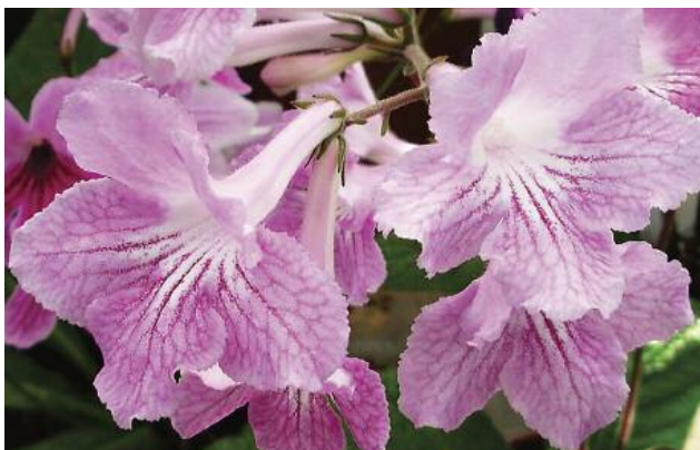
Streptocarpus 'Sugar Candy'