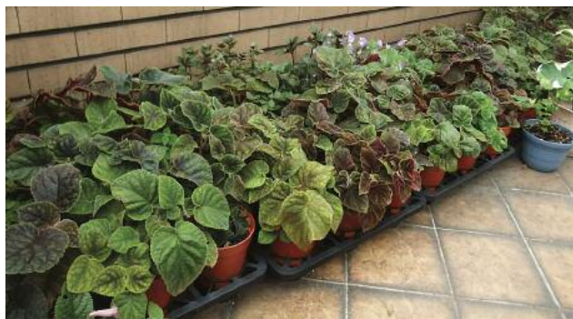
Next stage of growth.

Compared with other rhizomatous gesneriads, Smithianthas need more space to grow and require more time from sprout to bloom. If you ask me are they worth to wait? Yes! You won't regret growing them for their dramatic foliage and beautiful flowers!