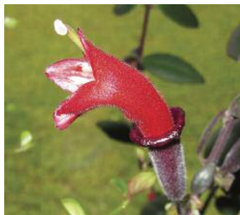
Aeschynanthus lobbianus : infundibuliform flower, fused calyx, stigma extends beyond lobes, fused upper corolla lobes

Gesneriads' rounded or elongated fruit can be a dry or fleshy capsule or berry. Among those genera producing dry capsules are Sinningia , Kohleria , and Smithiantha . Streptocarpus has long, dry fruit that is twisted and when seeds are ripe, the fruit untwists. It's