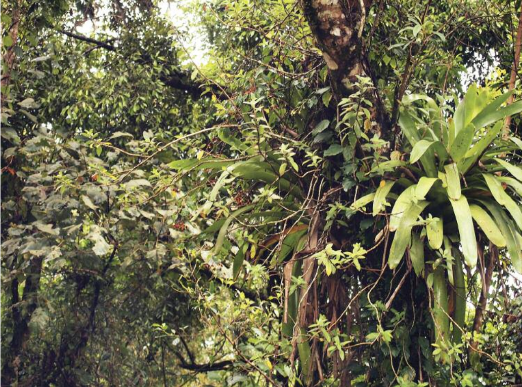
Tree with epiphytes by the side of the road from Taubate to Ubatuba, SP. There is a large Nematanthus growing on this tree – see if you can spot its red flowers (there are at least three).

We stayed at the Cegil Hotel Boulevard, as we had on the outbound part of the journey a week before.