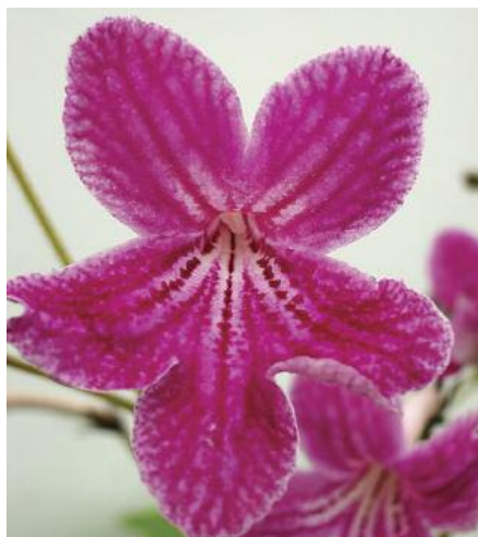
Streptocarpus 'Southern Charm'