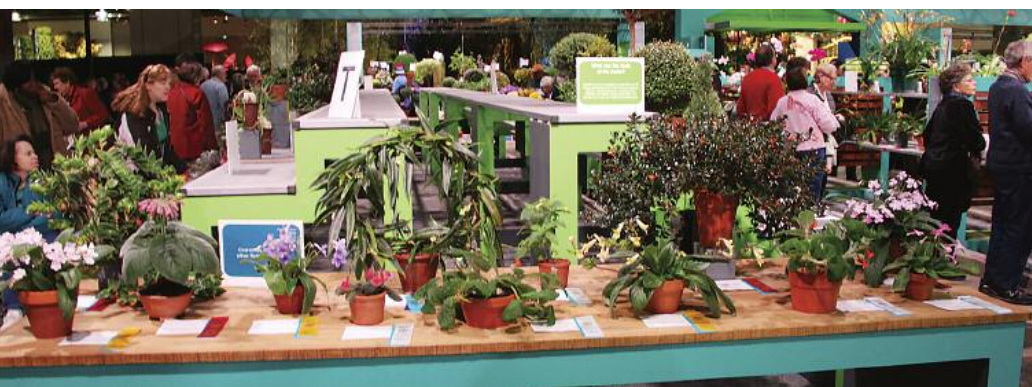
Overview of gesneriad class.