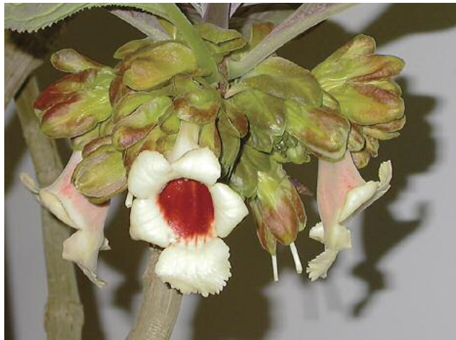
Drymonia macrantha : salverform with colorful, leafy calyces

There are many gesneriads that are best classed as oddities. One is Sinningia speciosa , which is more commonly known as the Florist Gloxinia. These plants have been bred for peloric flowers, which means that all the lobes are symmetrical and identical in shape, size, and in design/patterns. Also of interest are hybrids bred to have calyces that mutate into petals. Sometimes the calyx petals surround the main corolla but are split. Others are more tubular. When those calyx-double flowers die, the flower must be cut for removal because it will not be released by the peduncle. Calyx-double flowers cannot be used as seed parents because although they usually have normal anthers and pollen, the pistils are usually deformed and may have more than one stigma attached to the style.