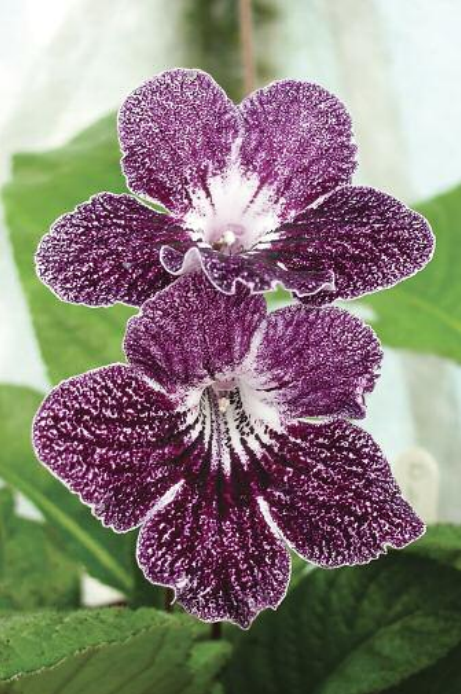
Streptocarpus 'Plum Lady'