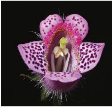
Seemannia gymnostoma : green stigma, waxy looking anthers with white pollen

Then there are Streptocarpus and Sinningias bred for extra petals in the centers of flowers where anthers have mutated into extra petals. That usually means they are missing pollen and can only be used as seed parents.