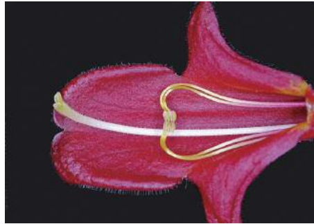
Columnnea 'Julia': hooded flower, bilobed stigma, colorful filaments

the base area of a flower. Most common gesneriad calyx types are split, leafy, and fused (forms a tube). With most gesneriads the whole flower "drops" when the flower is spent. The calyx then becomes more visible. Among the gesneriads that produce nectar for pollinators, tiny nectaries are visible with a magnifying glass. (Risking allergic reactions, I've tasted a variety of gesneriad nectars and all are very sweet.)