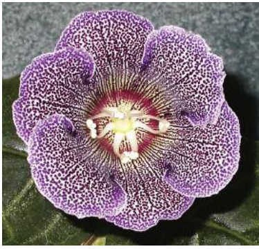
Peloric Sinningia speciosa : multiple anthers and deformed stigma