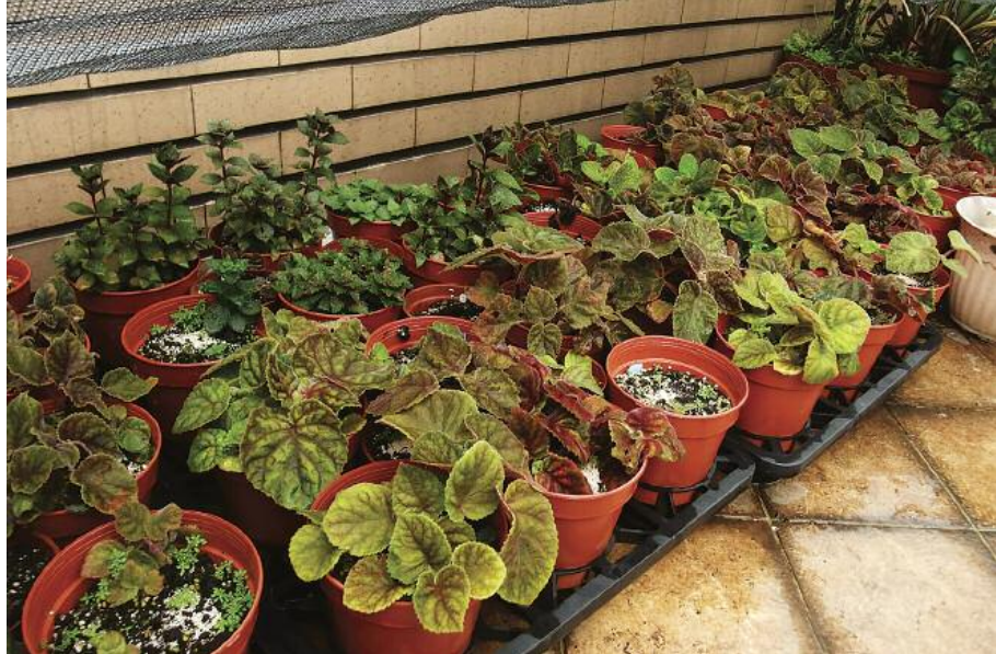
Young Smithiantha plants and other gesneriads