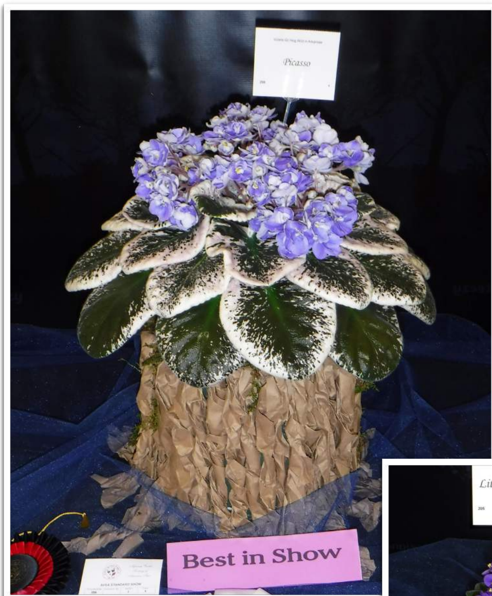
Saintpaulia 'Picasso' exhibited by Wayne Geeslin