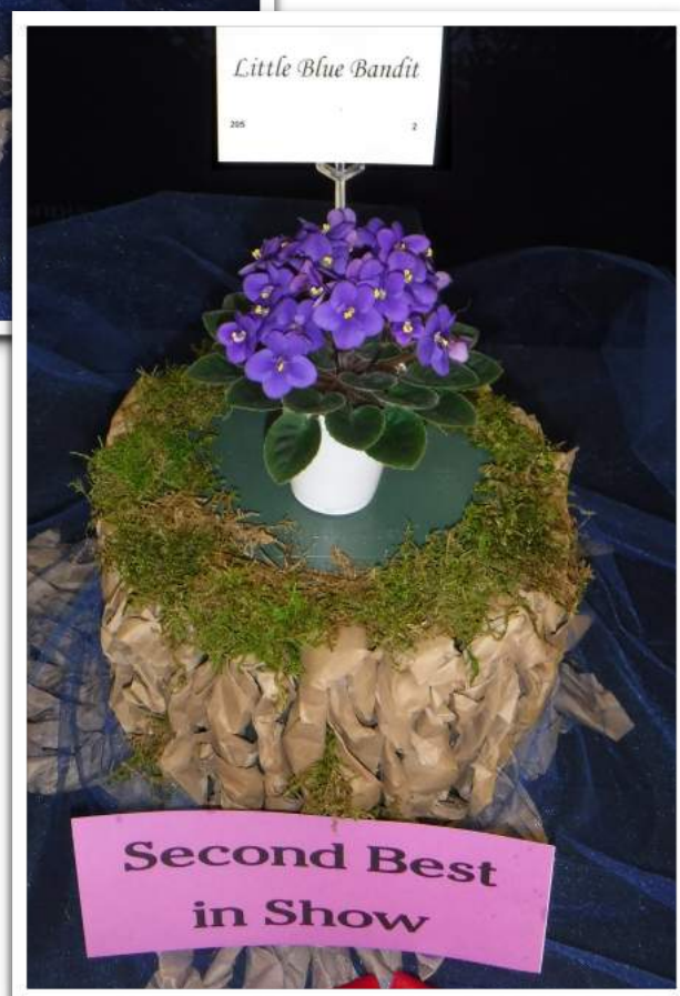
Saintpaulia 'Little Blue Bandit' exhibited by Kathy Lahti