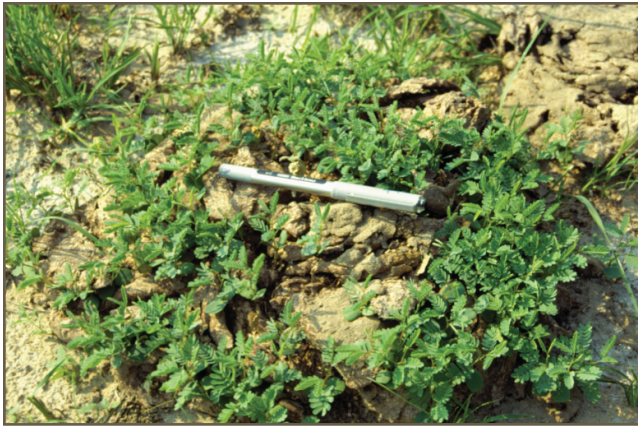
Figure 2. Mesquite seedlings germinating and emerging in cattle feces. Many animal species eat mesquite beans and disperse the seeds, which produce new plants.

Any animal that swallows an intact mesquite bean can spread the seed (Fig. 2). Cattle drives in the 1880s are thought to be partially responsible for increased mesquite density and genetic variety within stands of mesquite. A study at Texas AgriLife Research at Spur demonstrated that reinfestation can occur even when livestock are excluded from an area. This study began in 1941 (Table 2) with hand grubbing of all the mesquite in a 1-acre area. Every 5 to 7 years, all the seedlings were removed by grubbing. Over a 25-year period, 689 plants, including 473 seedlings, were removed from the area.