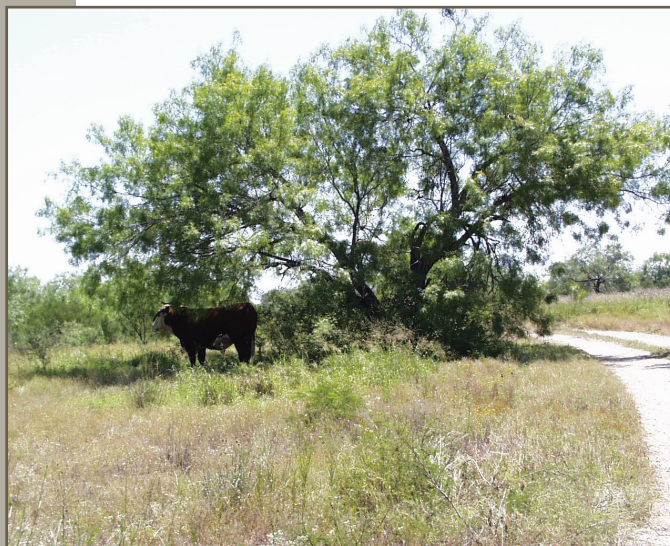
Figure 1. Bull seeking relief from the summer sun under a honey mesquite tree in South Texas.

Mesquite is native to Texas, where three major species and four varieties (Table 1) of mesquite occur. The most widespread species/variety is honey mesquite ( Prosopis glandulosa var. glandulosa ). When most people in the state talk about mesquite, they are probably referring to honey mesquite.