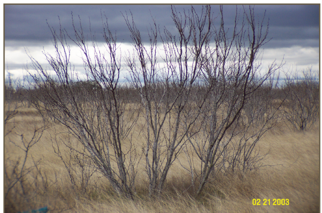
Figure 4. Mature mesquite tree exhibiting the multi-stem growth form, indicating top removal during the juvenile growth stage or later.