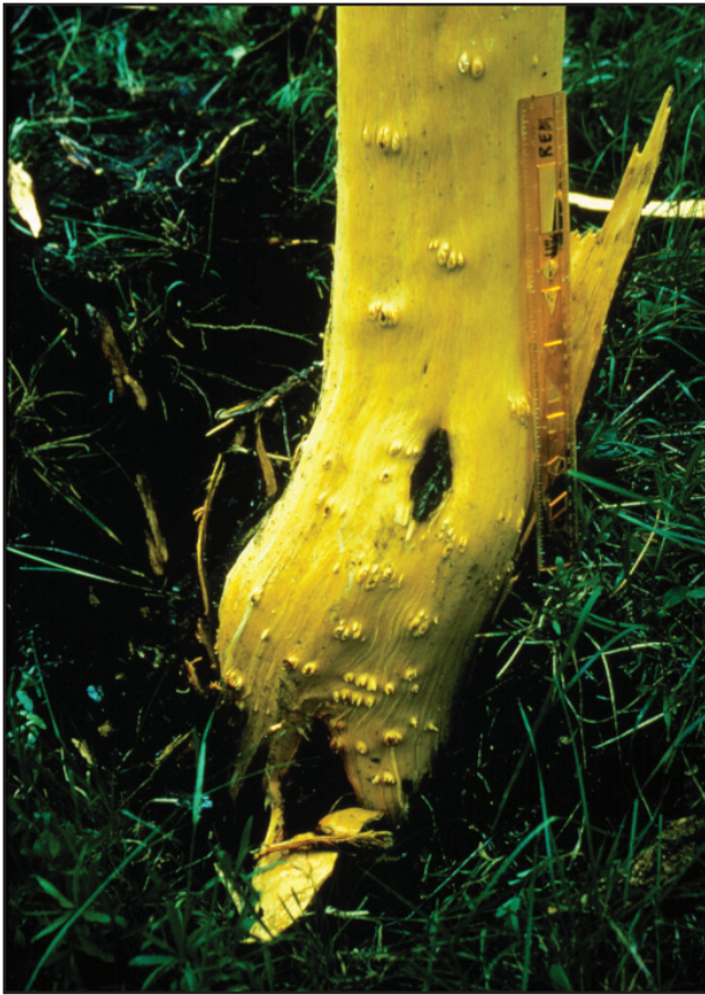
Figure 7. The below-ground central bud zone of a mesquite tree with buds that can sprout after top removal. Buds are found up to 12 to 18 inches below ground to the point where the first lateral root forms.

Another vital point is that it is unrealistic to try to eradicate mesquite once and for all. As illustrated in the Texas AgriLife Research at Spur study mentioned previously, various species of wildlife will continue to bring seeds to the property. For example, mesquite seedlings grow on Conservation Reserve Program (CRP) lands that were in cropping for decades and have not been grazed by cattle since being converted to CRP. The seedlings on these lands could not have grown from seeds long ago in the soil before it was cropland, and cattle have not brought new seeds into the site. Thus, wildlife must be bringing in new seed. Therefore, a mesquite management plan must be designed for the long term, incorporating follow-up treatments to maintain mesquite densities at a level that meets landowner goals.