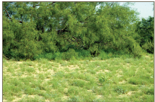
Figure 6. In South Texas, grass may thrive under a single large mesquite but may be unable to grow well in the hot open spaces between the trees.

In some cases, the presence of mesquite can actually benefit grass. In South Texas, a single large mesquite will provide shade and a nutrient-rich site and will moderate extreme soil temperatures. This situation enables stands of grass to survive and thrive under such trees, whereas the open spaces between the trees are too harsh for grass to do well (Fig. 6). However, as mesquite density increases, so does competition for light, moisture, and nutrients, and the grass does not do well.