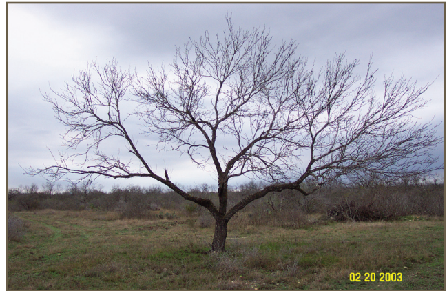
Figure 3. Mature mesquite exhibiting single stem growth form, indicating no top removal.