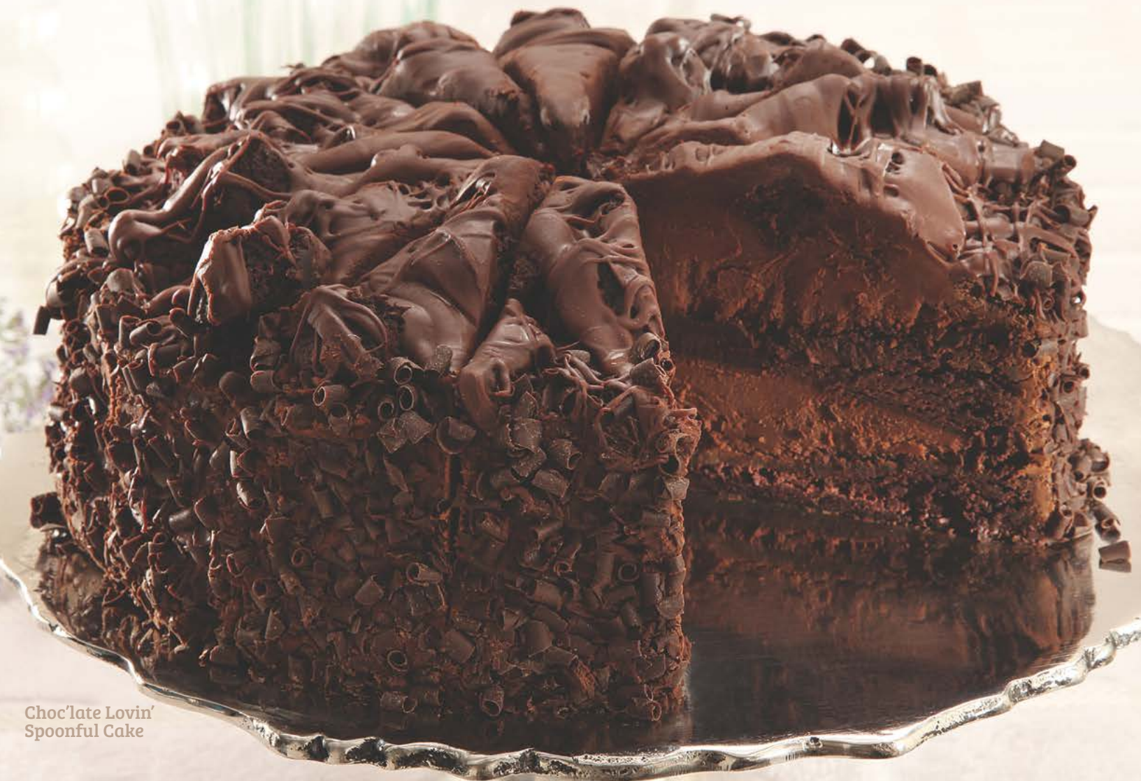
Choc'late Lovin' Spoonful Cake