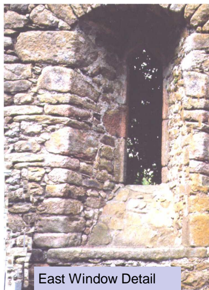
East Window Detail

In the field on opposite side of road may be seen the Holy Well & grotto, with a modern altar in front. Mass is celebrated here every year in July. An inscribed stone in front of the Oratory was erected by a local committee to mark the recent millenium.