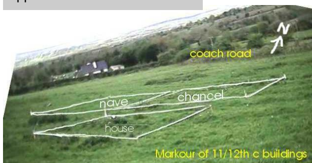
Markout of 11/12 c buildings in Upper field.