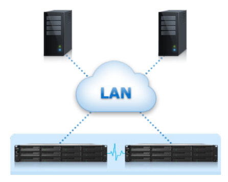
Figure 1) Reliability, Availability & Disaster Recovery

Synology High Availability ensures seamless transition between clustered servers in the event of server failure with minimal impact to businesses.