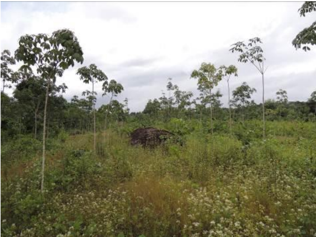
Several farmers complained about the presence of stinging ants, attracted by the piles of old woodchips placed on the farms by BR in 2011. Photo taken at the Barchue farm.

It should also be noted that some of the farmers were still complaining about the presence of these chips, as the presence of stinging ants was still creating difficulties, while others believed that these chips hampered the growth of the rubber trees. The scope of the present research did not allow for further analysis of the exact effects of these woodchips on water quality or on the presence of ants.