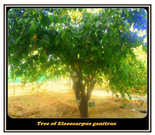
Figure 1: Tree of E. ganitrus

The Elaeocarpus ganitrus fruit have many phytoconstituents such as alkaloids, flavonoids, tannins, steroids, triterpenoids, carbohydrates and cardiac glycosides. Singh<sup>10</sup> says that a significant amount of phytocomponents such as isoelaeocarpicine, elaeocapine