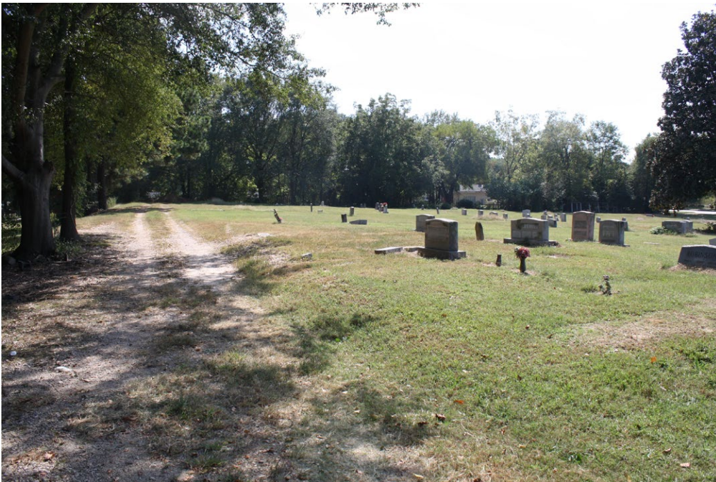
Plate 12: View of driveway and gravemarkers.