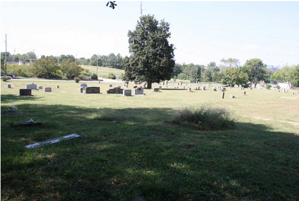
Plate 16: View of gravemarkers.