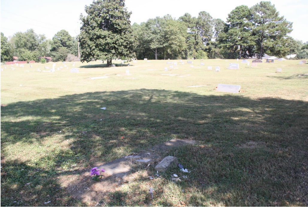
Plate 19: View of gravemarkers.