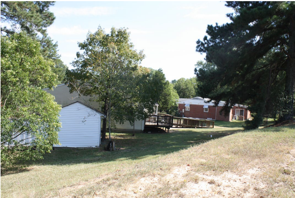
Plate 14: View of driveway and adjacent houses.