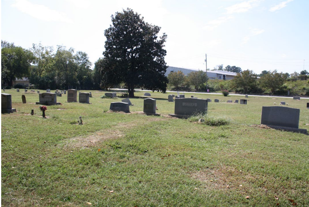
Plate 7: View of gravemarkers.