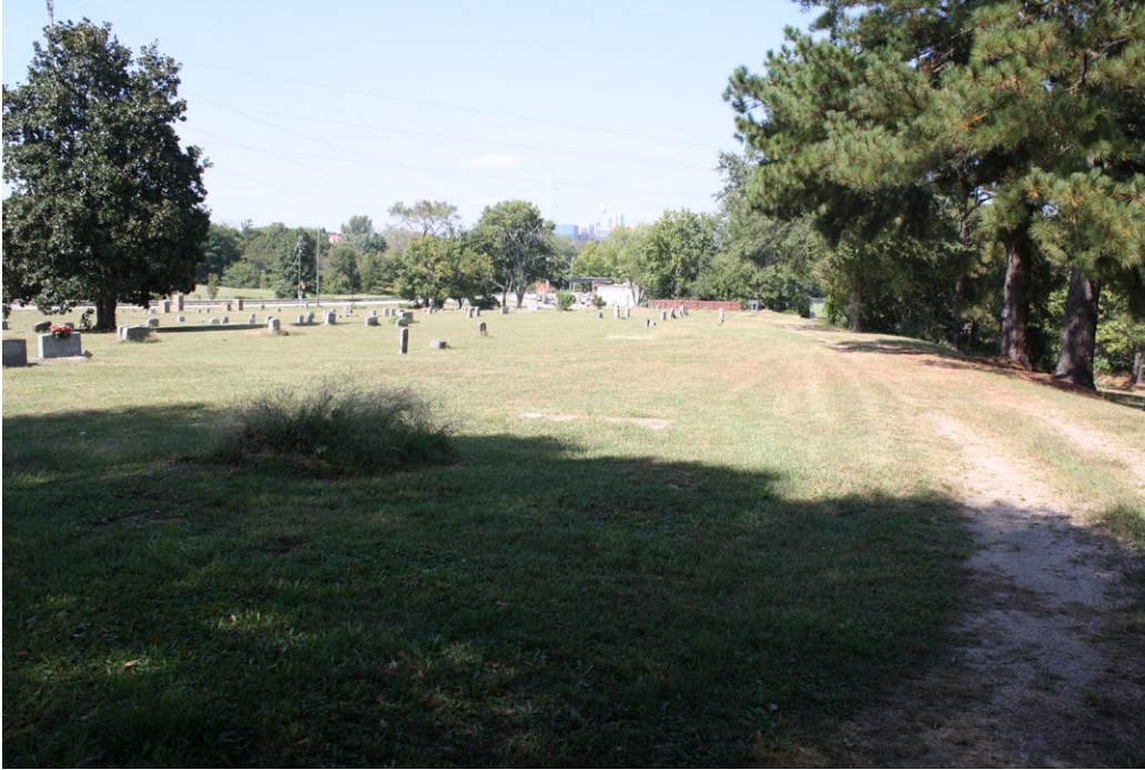
Plate 15: View of driveway and gravemarkers.