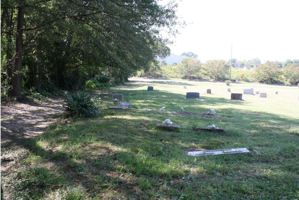
Plate 17: View of driveway and gravemarkers.