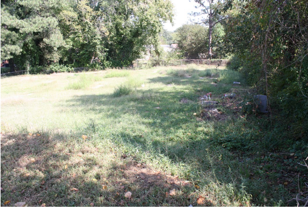
Plate 11: View of gravemarkers.