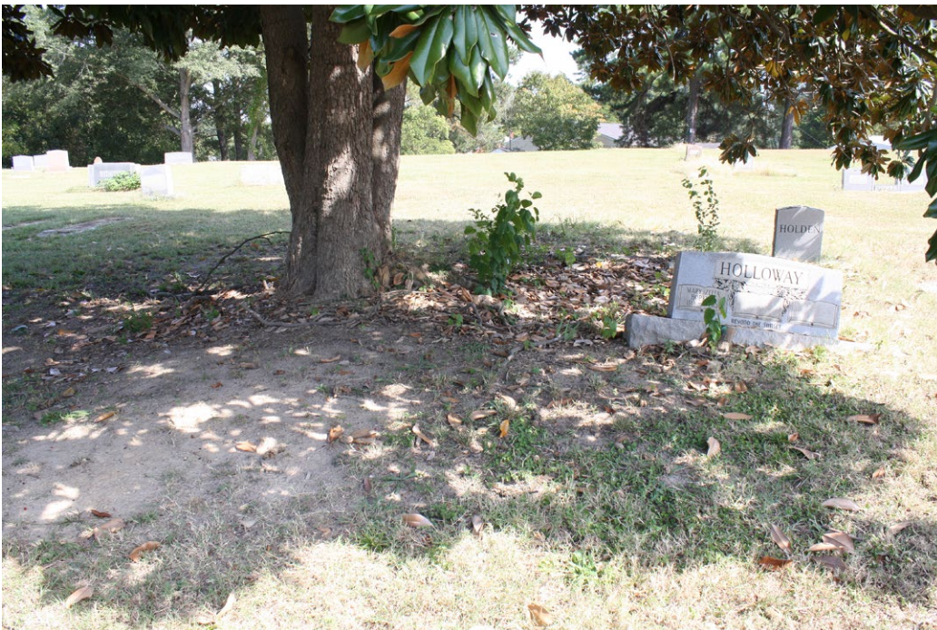
Plate 28: View of granite die on base gravemarkers.