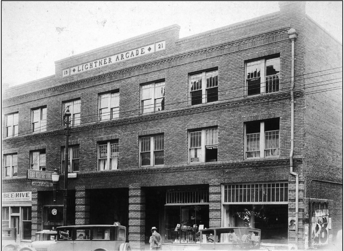
Figure 4: Lightner Arcade and Hotel, 122 East Hargett Street, Raleigh, 1921 (General Negatives Collection, State Archives of North Carolina, Raleigh, NC).