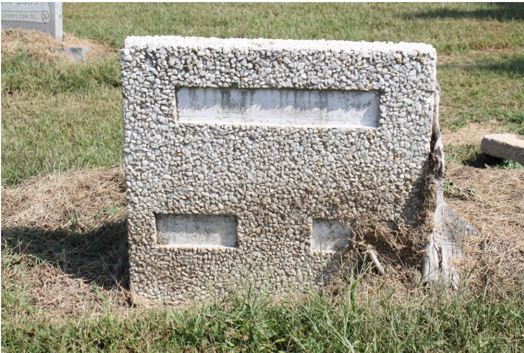
Plate 24: Unmarked concrete and stone gravemarker.