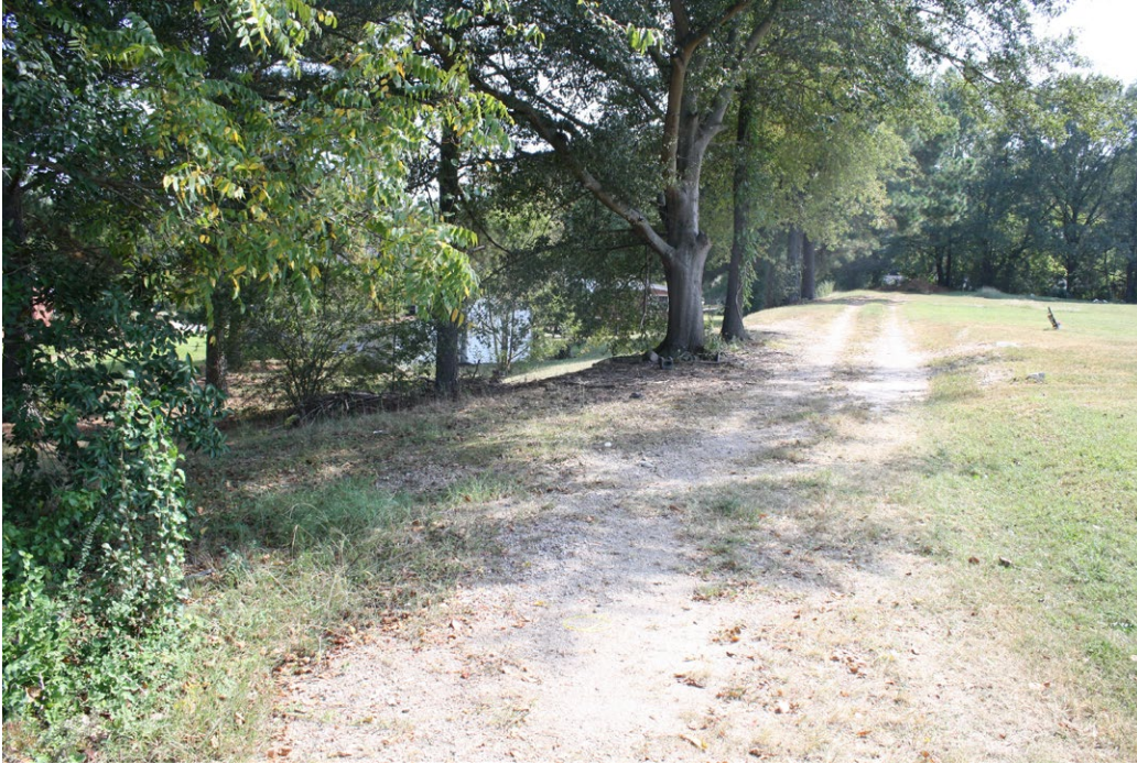
Plate 13: View of driveway and adjoining property.