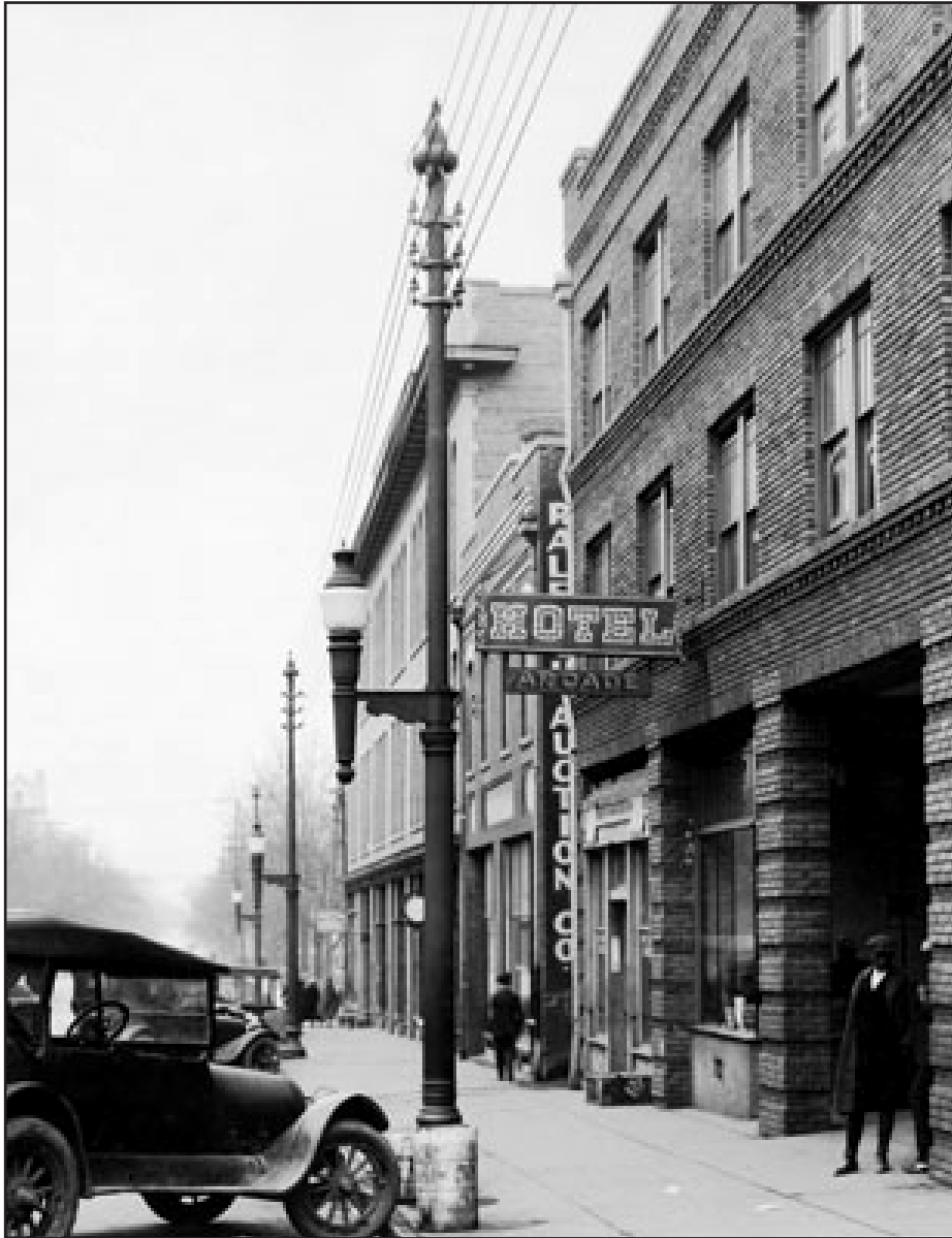
Figure 5: 1926 View of E. Hargett Street looking east in 100 block. Lightner Arcade is visible at the right.