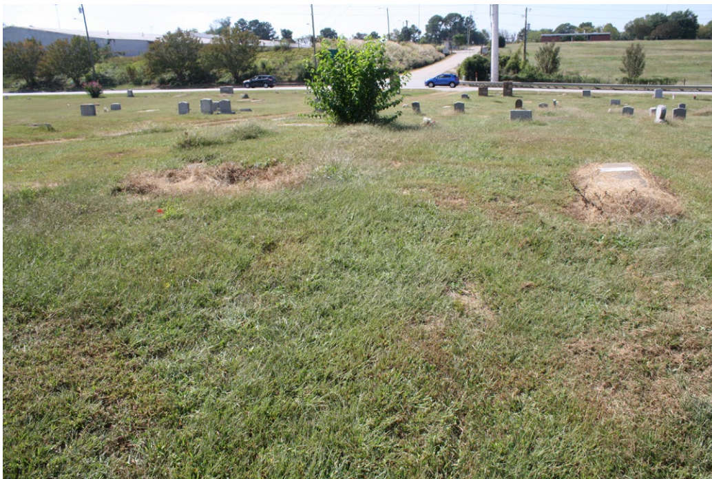
Plate 8: View of gravemarkers.