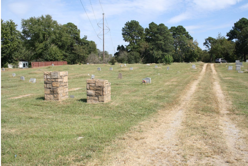
Plate 5: View of stone columns and driveway.