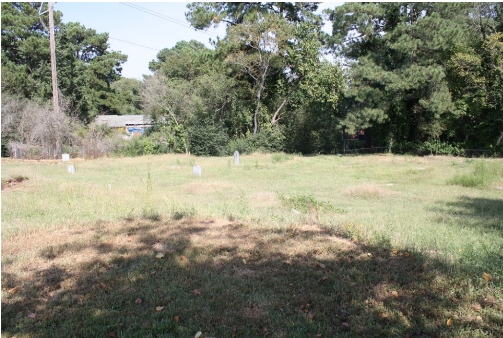
Plate 10: View of gravemarkers.