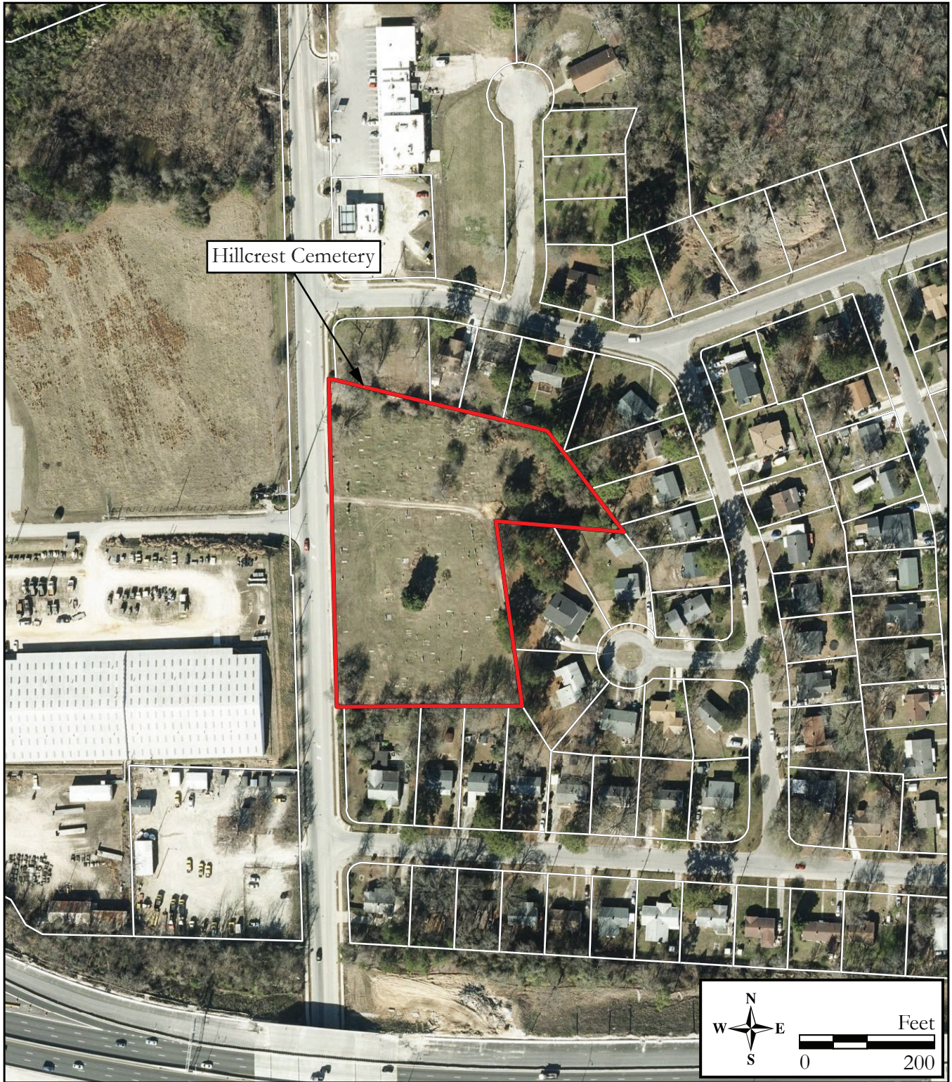
Figure 1: Aerial map showing the recommended landmark boundary for the Hillcrest Cemetery, 1905 Garner Road, Raleigh (World Imagery, ESRI 2009).