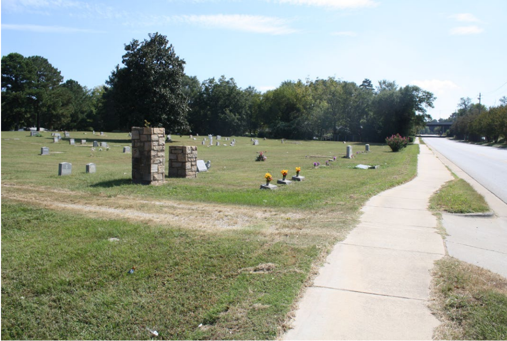
Plate 3: View of Garner Road.