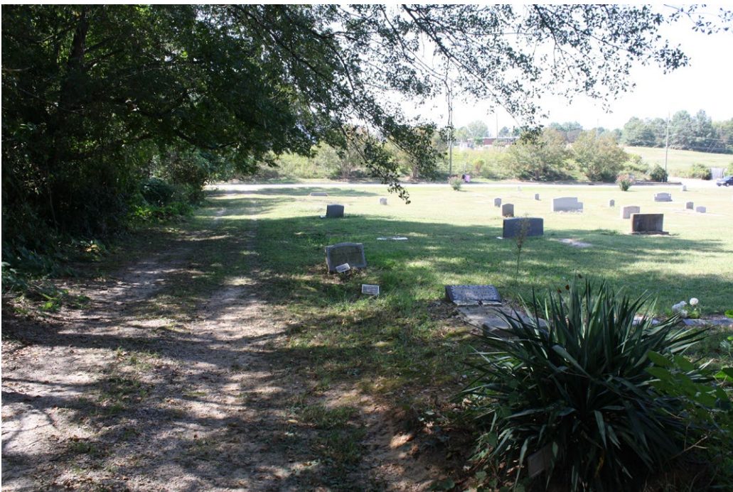
Plate 18: View of driveway and gravemarkers.