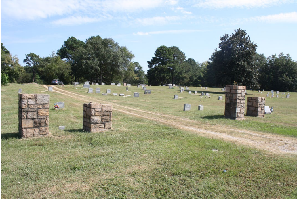
Plate 1: View of stone columns flanking driveway.