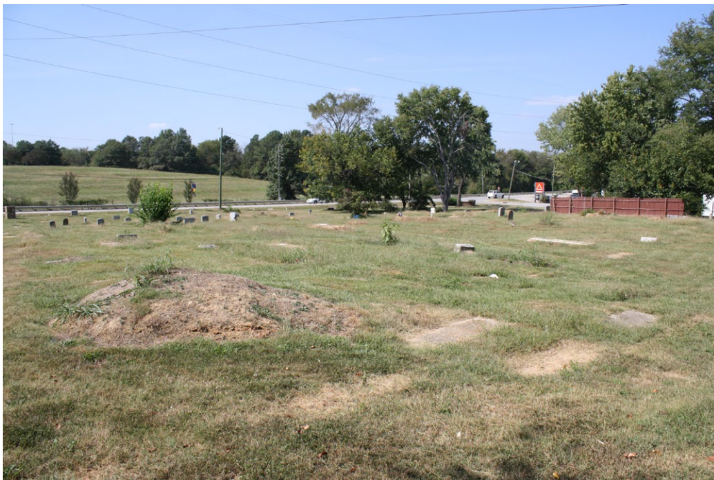
Plate 6: View of gravemarkers.