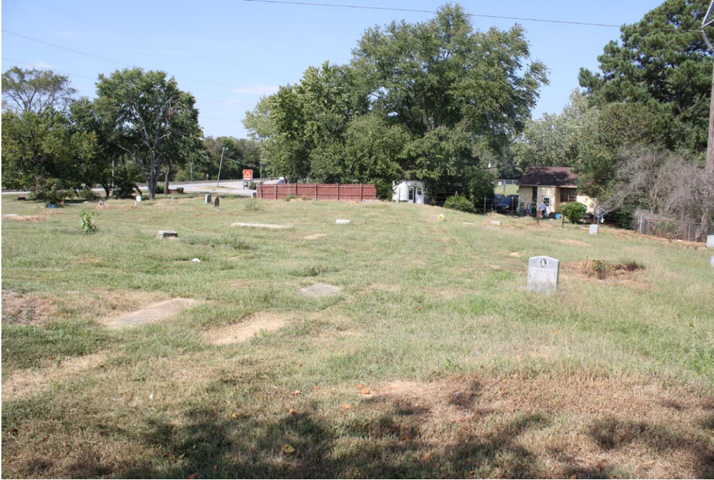
Plate 9: View of gravemarkers.