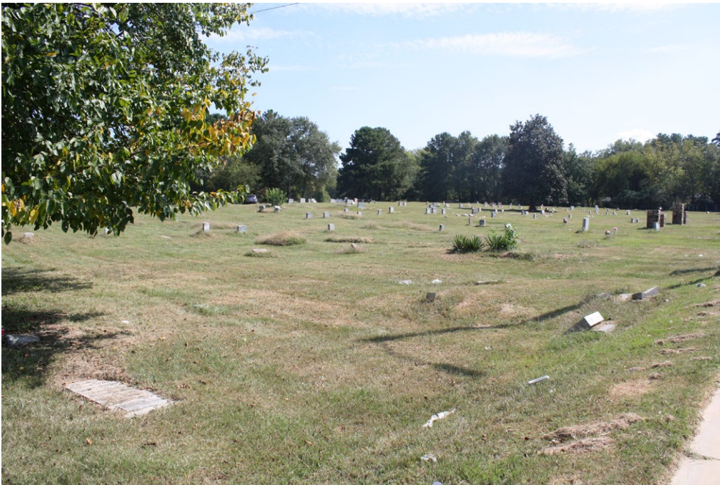
Plate 4: View of gravemarkers.