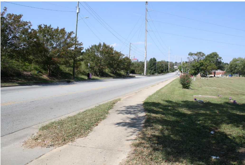
Plate 2: View of Garner Road.