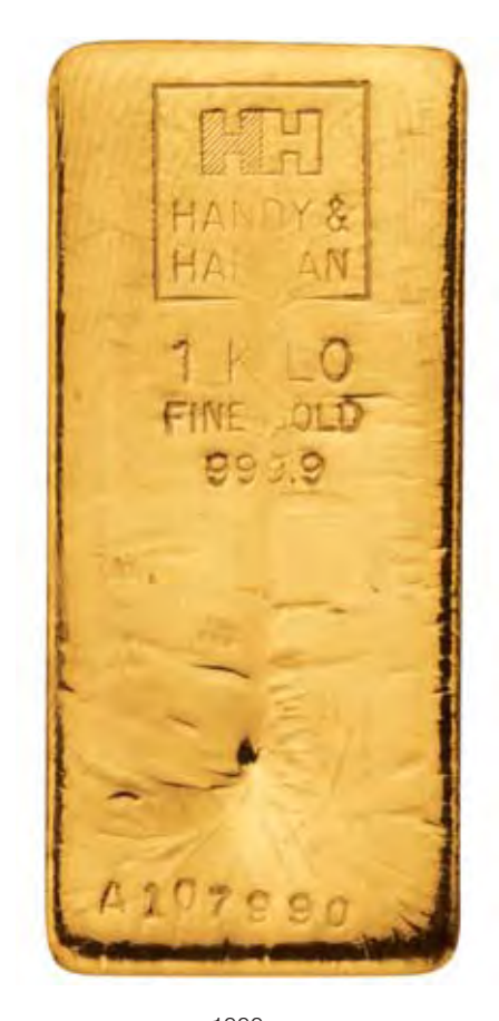
1000 g Handy & Harman 1984 – 1996