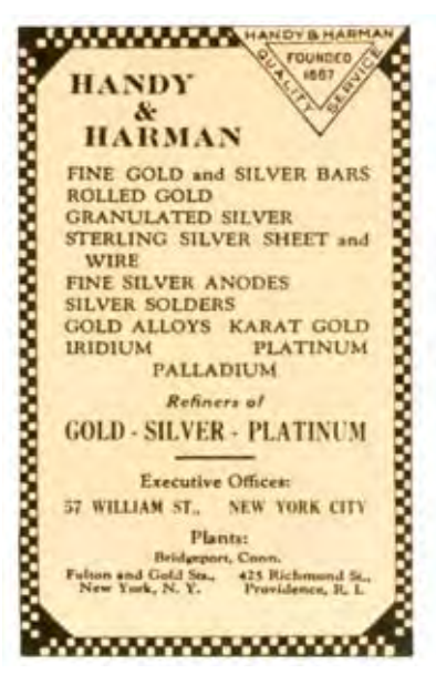
Advertising Handy & Harman in 1906.