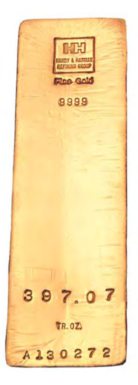
Handy & Harman Refining Group Inc 1996 – 2001