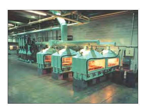
Refining gold at the Attleboro refinery in 1990.

Cast: 400 oz, 100 oz, 1000 g, 10 tola, 5 tola.