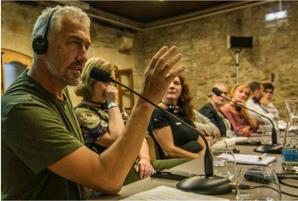
Round Table Minority Language Discussion, Errenteria