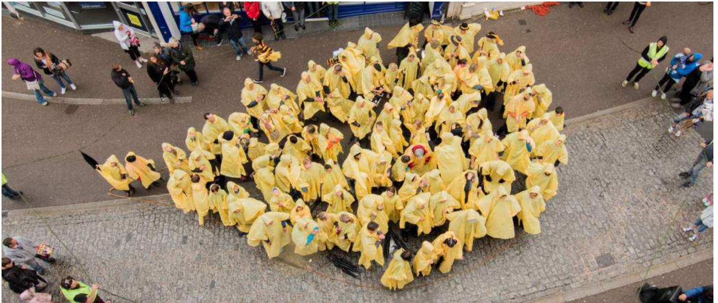
the 'Human Mosaic' in Falmouth

Golden Tree organised and delivered 6 workshops in three primary schools around Falmouth, making Raising awareness of the existence of European minority languages and the Cornish language for year 5 and 6 pupils. They explored the value of linguistic diversity and learned a phrases in Cornish using the Tales from Porth educational material previously developed by Will Coleman. They also learned “Kelmys on dh’Ostrali” a sea shanty in Cornish which was then sung in the Pop-up Village.