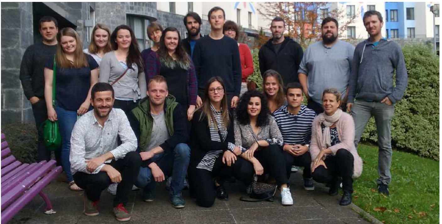
Young Ambassadors from Seven Minority Languages gather in Donostia

Besides being useful for the project, the meetings allowed Golden Tree to become part of an international network of organisations active in the field of European minority languages. Fuelled by food and drink that each of the participating organisations brought from their home region, we shared experiences of living in a small-language nation. We compared our collective histories, shared the experiences of speakers of minority languages and compared strategies that each of the organisations use to promote their native language. Despite being from different parts of Europe we discovered many similarities, as well as valuable differences, which will help us to develop more activities addressing the Cornish language in the future. In working together as colleagues and friends, Golden Tree has gained contacts across Europe that will inevitably lead to more Pan-European projects regarding culture and language.