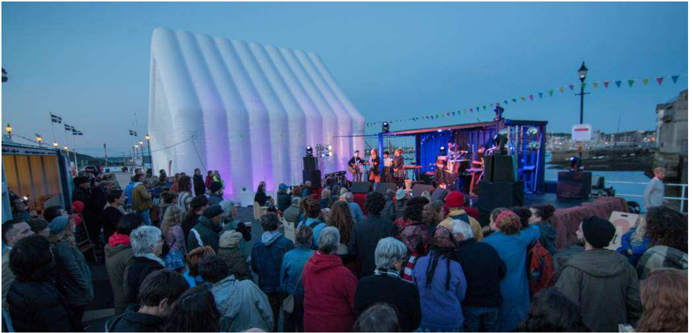
The Pop-Up Festival Village on Prince of Wales Pier, Falmouth