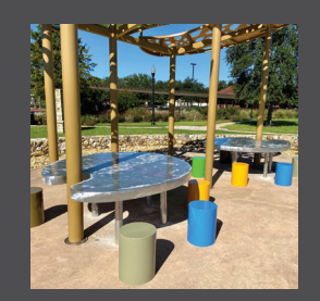
Art Park Seating Mike Zeak Sculptural Seating