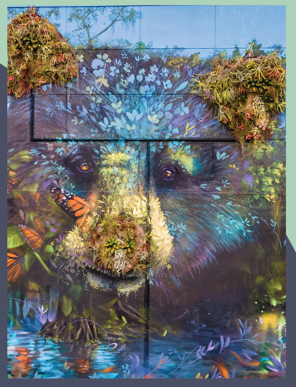
City of Ocala Cultural Arts & Sciences Division