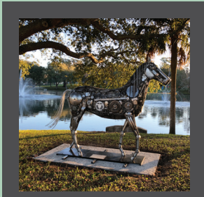
Strength of Perseverance