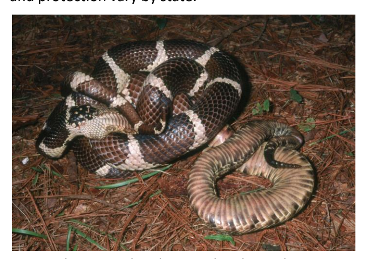
Kingsnakes are ophiophagus. The photo above shows an eastern kingsnake eating an eastern diamondback rattlesnake.

Conservation Challenges: Kingsnakes are in decline throughout their range. The cause of decline is unknown, but contributing factors likely include habitat loss and fragmentation, wetland alteration, pollution, invasive species such as the red imported fire ant, road mortality, and overcollection for the pet trade. Kingsnakes have declined in many protected landscapes where other snake species prosper such as the Conecuh National Forest in Alabama and the Apalachicola and Ocala National Forests in Florida. None of these kingsnake species are state or federally protected, and laws governing their conservation and protection vary by state.