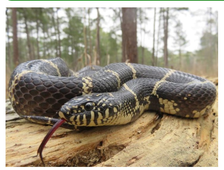
Eastern kingsnakes (pictured above) occur throughout most of the gopher tortoise's range.

Lampropeltis getula, L. floridana, L. holbrooki, L. nigra, & L. meansi Upland Snake Species Profile