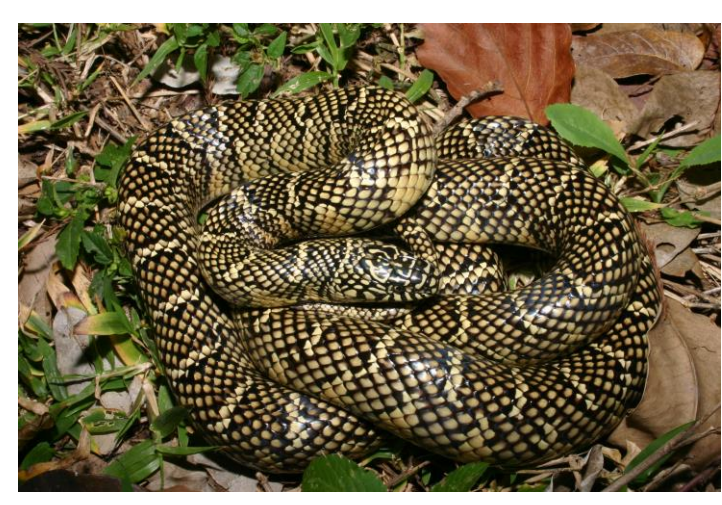
Florida kingsnakes (pictured above) are lighter in coloration than other kingsnake species.

Venom Resistance: Kingsnakes are tolerant of the venoms created by new world vipers, namely rattlesnakes, copperheads, and cottonmouths. Kingsnakes, however, do not appear to have a resistance to coral snake venom, although the reason for this is unclear. Evidence suggests that this venom resistance is an evolved trait, meaning babies are hatched with an inherent resistance to the effects of venom. Several mammals have also evolved a resistance to snake venom including the opossum, honey badger, and mongoose.