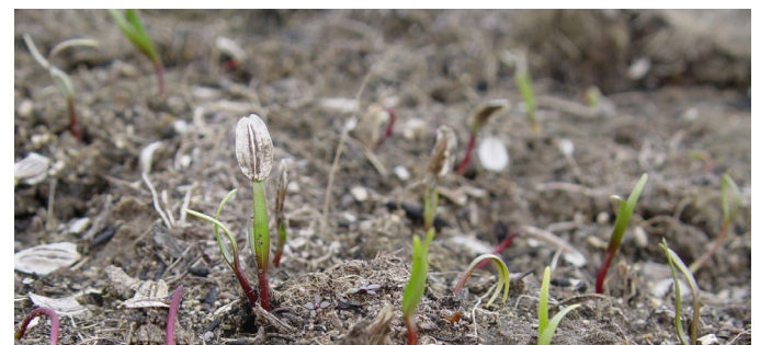
Figure 12. Nineleaf biscuitroot seedlings emerging from a southern Idaho planting.

Establishment and Growth. In its first year of growth, nineleaf biscuitroot produces few leaves and devotes energy to taproot development (Ogle et al. 2012). In the early seedling stage, nineleaf biscuitroot can be mistaken for a grass due to its linear cotyledons (Fig. 12; Pavék et al. 2012). Plants are considered established after a year and flower after 2 to 4 years of growth (Ogle et al. 2012; Shock et al. 2016). Once established, nineleaf biscuitroot is a strong perennial when protected from rodents (Shock et al. 2018). Plants green up, flower, and set seed early in the growing season (Table 6).