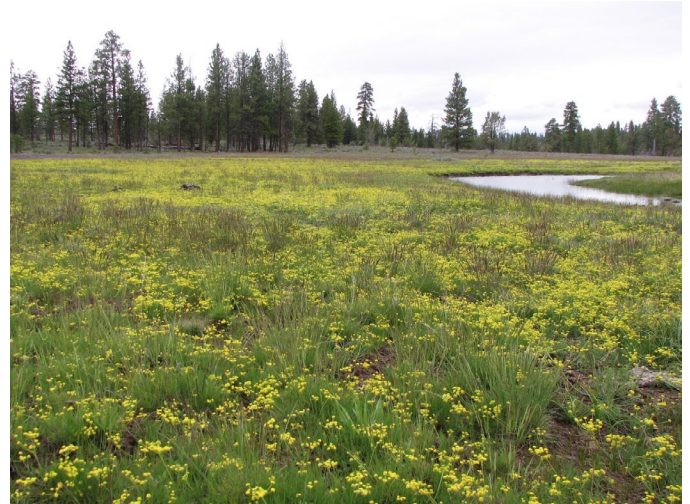
Figure 2. Nineleaf biscuitroot growing in a montane forest opening in Oregon.

woodlands where soil moisture availability was limited by layers of hard clay and duripan (Driscoll 1964; Miller et al. 2000). On pumice soils in central Oregon, nineleaf biscuitroot was most common in the driest, lowest elevation ponderosa pine/antelope bitterbrush communities (Dyrness and Youngberg 1966). In western Montana, nineleaf biscuitroot was an indicator of xeric subalpine larch ( Larix lyallii ) stands based on the species composition of 127 stands found near timberline at cold, rocky sites (Arno and Habeck 1972).