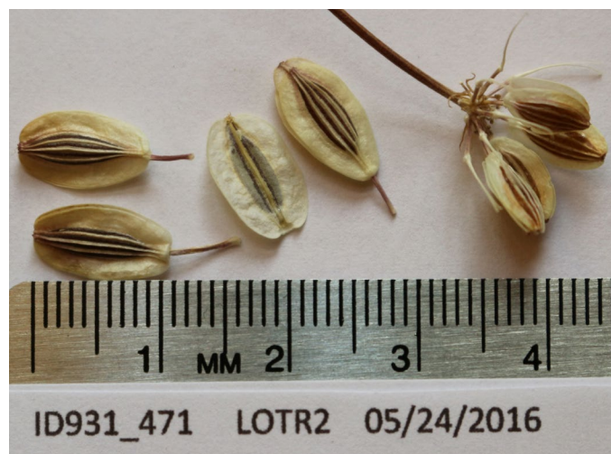
Figure 11. Nineleaf biscuitroot fruits (winged schizocarps with ribs) and a mericarp (center) with the commissure visible.

Seed Cleaning. Seed can be cleaned to high purity with minimal air screening (Ogle et al. 2012). Seeds must be handled carefully as they are fragile and brittle. Small collections can be carefully hand-rubbed to free seeds from the inflorescence then cleaned using an air column separator. Large collections require cleaning with air screen equipment (Skinner 2007).