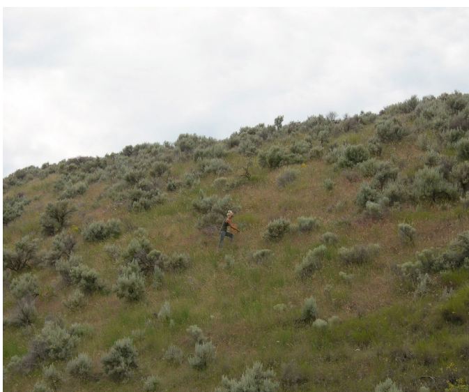
Figure 10. Collecting wildland nineleaf biscuitroot seed in a sagebrush community.

Collection methods. Wildland seed is easily hand collected by stripping or shaking umbels over a container or by clipping the inflorescences (Fig. 10; Jorgensen and Stevens 2004; Parkinson and DeBolt 2005; Skinner 2007). Seed detaches readily from the umbellets. Collections made by shaking ripe inflorescences over a container are very clean (Ogle et al. 2012).