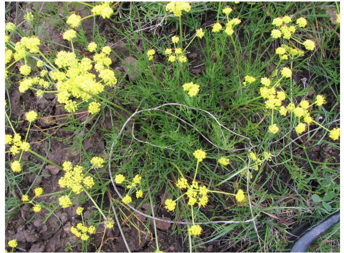
Figure 5. Nineleaf biscuitroot plant with highly dissected leaves and umbellets with small yellow flowers in compound umbels.

flowers with some male flowers, while those on shorter rays support mainly male flowers (Welsh et al. 2016; Hitchcock and Cronquist 2018). Individual flowers have five bright yellow stamens and five yellow petals, which fade to white with age (Welsh et al. 2016). Flowers produce schizocarps, which are fruits with two seeds (mericarps). Schizocarps are dry, oblong to elliptical, and 0.2 to 0.6 inch (6-15 mm) long by 0.2 to 0.4 inch wide (4-11 mm) wide (Patterson et al. 1985). Mericarps separate along their midlines when mature. Mericarps are strongly flattened, unnotched at the base and apex with 5 equal ribs on the dorsal side and thin wings along the sides (USDA FS 1937; Luna et al. 2018).