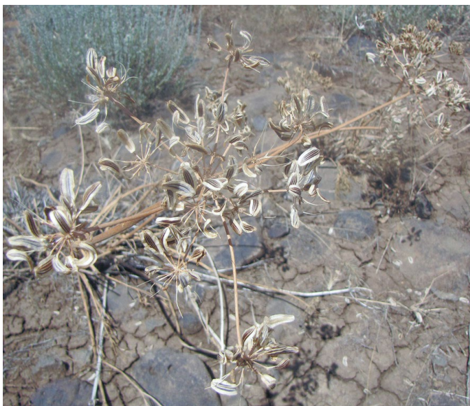
Figure 9. Nineleaf biscuitroot with mature seed dispersing.

Collection methods. Wildland seed is easily hand collected by stripping or shaking umbels over a container or by clipping the inflorescences (Fig. 10; Jorgensen and Stevens 2004; Parkinson and DeBolt 2005; Skinner 2007). Seed detaches readily from the umbellets. Collections made by shaking ripe inflorescences over a container are very clean (Ogle et al. 2012).