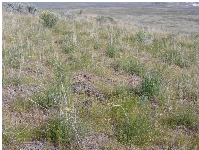
Figure 4. Nineleaf biscuitroot growing with bluebunch wheatgrass near Boise, ID.

Elevation. Nineleaf biscuitroot is most common at low and mid-elevations but also occurs at elevations up to 10,000 feet (3,000 m) (USDA FS