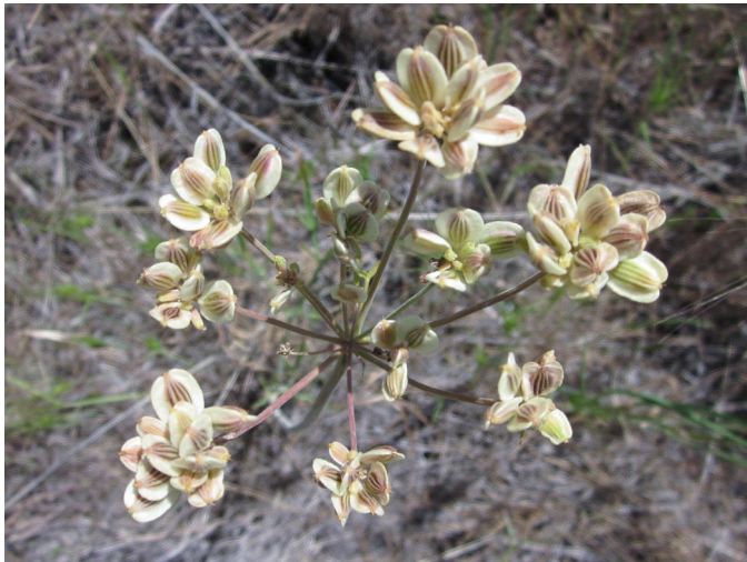
Figure 7. A single nineleaf biscuitroot compound umbel with mature fruits (schizocarps).

Above-ground seedling growth is slow, and plants produce only a few leaves in their first year because energy is devoted to taproot development (Ogle et al. 2012).