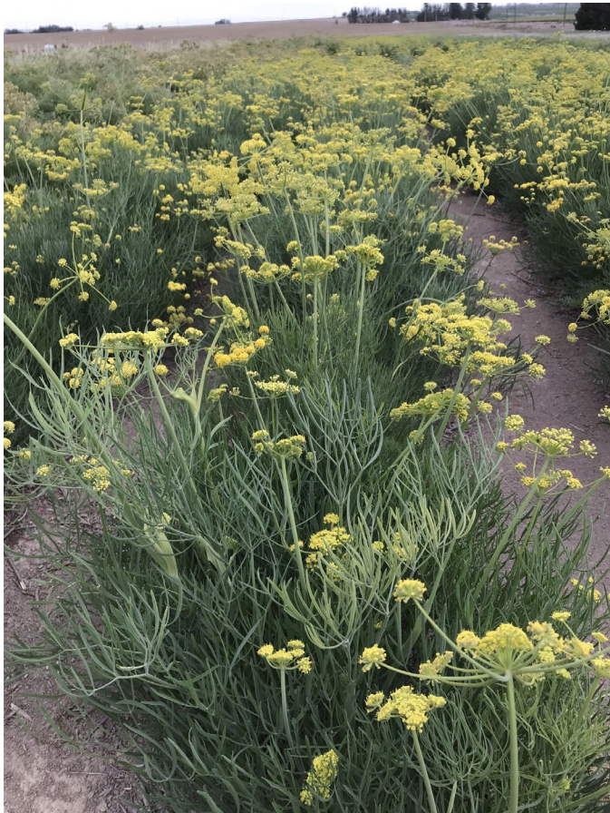
Figure 13. Nineleaf biscuitroot irrigation trial at OSU MES.

hand harvesting, and the seed required little post-harvest cleaning (Tilley and Bair 2011).