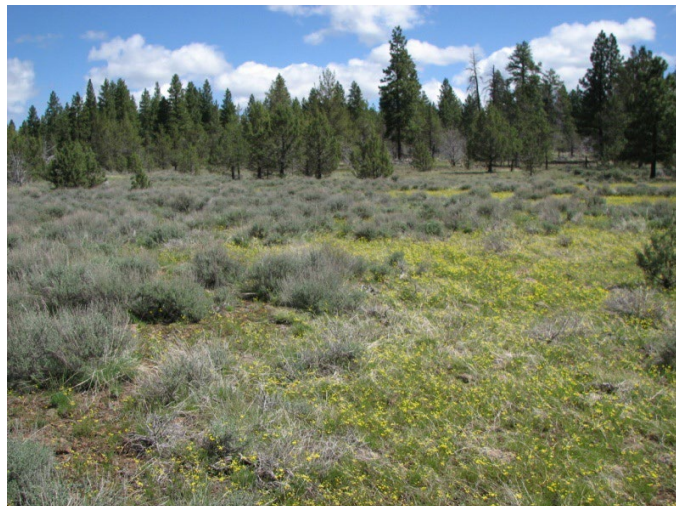
Figure 3. Nineleaf biscuitroot growing in an upper elevation sagebrush community abutting a montane forest in Oregon.

was lower in grasslands on north- (0.9 lbs/acre [1 kg/ha]; 1% freq) than south-facing slopes (7 lbs/acre [8 kg/ha]; 32% freq) with extremely stony, silt loam soils (Shiflet 1975). Nineleaf biscuitroot was also associated with rough fescue ( F. campestris )-bluebunch wheatgrass and rough fescue-Idaho fescue communities in western Montana (Mueggler and Stewart 1980). In the Bitterroot Mountains, nineleaf biscuitroot was common in high-elevation grassland balds (>6000 ft [1,830 m]). The balds are considered climax vegetation and occur on south-facing slopes within the spruce-fir ( Picea-Abies spp.) zone where soils are coarsely fractured and excessive summer moisture deficiencies restrict tree establishment (Root and Habeck 1972).