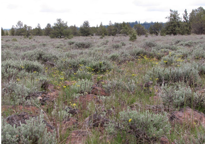
Figure 1. Nineleaf biscuitroot growing in a dry sagebrush community in Oregon.

Habitat and Plant Associations. Nineleaf biscuitroot is adapted to intense sun exposure (Fig. 1). Plants have leaves with very narrow blades that resist water loss with excessive radiation. It is common in open terrain, rocky sites, meadows, and mountain sites with high sun exposure (Daubenmire 1975a). Nineleaf biscuitroot occurs in dry to moist plains, foothills, lower and mid-montane locations, and is occasional at high-elevation sites averaging 90 or more frost-free days (USDA FS 1937; Lambert 2005a; Tilley et al. 2010; Pavék et al. 2012). It occurs at sites receiving 8 to 20 inches (203–508 mm) of annual precipitation that are typically moist in spring but dry by early summer (Taylor 1992; Skinner 2007).