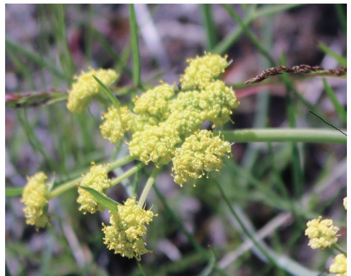
Figure 6. Nineleaf biscuitroot's compound umbel with the typical unequal ray lengths and umbellets in full bloom.

Varieties. Nineleaf biscuitroot varieties in some locations are poorly defined (Hickman 1993) and in other locations are in taxonomic flux