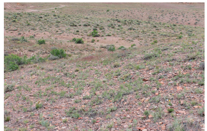
Figure 3. Shaggy fleabane growing with grasses and other forbs on a rocky site in Utah.

Soils. Shaggy fleabane grows on a variety of substrates and commonly occurs on well-drained sandy to gravelly soil textures (Fig. 3) (Taylor 1992; Welsh et al. 2016; USU Ext. 2017).