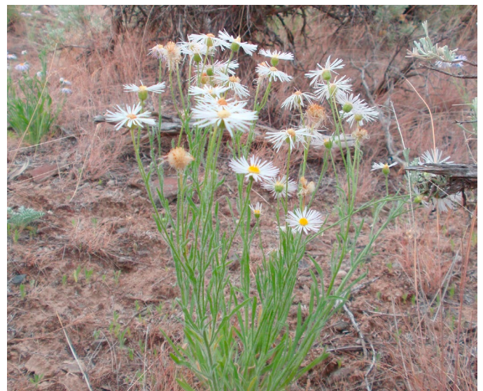
Figure 4. Shaggy fleabane plant with fuzzy stems and leaves growing in Oregon.

Shaggy fleabane is a short- to long-lived perennial from a woody taproot and caudex with short, thick branches (Nesom 2006; Welsh et al. 2016). Caudex branches are typically clothed by withered leaf bases (Welsh et al. 2016). Plants are variable, ranging from rather stout to slender, 2 to 20 inches (5-50 cm) tall. Stems and leaves are often densely covered with spreading hairs of more than 1 mm long, giving the plant a shaggy or unkempt appearance (Fig. 4) (Taylor 1992; Hitchcock and Cronquist 2018; Luna et al. 2018).