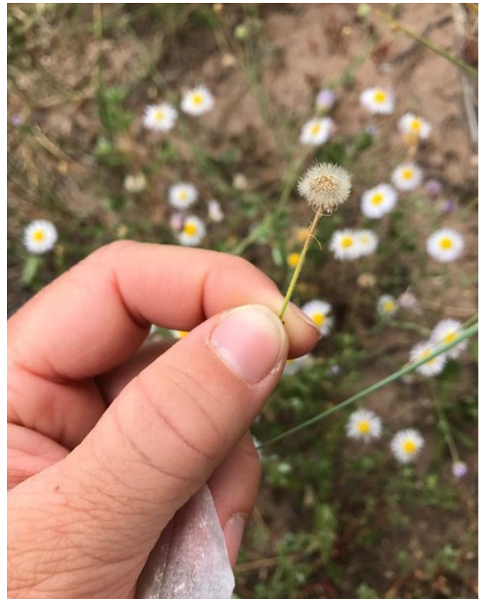
Figure 6. Shaggy fleabane seed head.

Reproduction. Shaggy fleabane reproduces by seed (Fig. 6) (Marlette and Anderson 1986; Pinto et al. 2014). Seeds are generally produced 1 to 2 months after flowers (Pitt and Wikeem 1990). Flower production (abundance and timing) can vary by location and year (Tepedino and Stanton 1980).