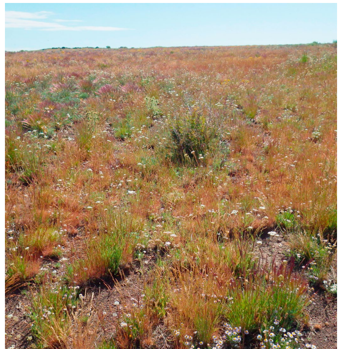
Figure 1. Shaggy fleabane (lower right) growing in a grassland community in Oregon used as a seed collection area by the Bureau of Land Management’s (BLM) Seeds of Success program.

A bluebunch wheatgrass-Sandberg bluegrass-shaggy fleabane community occupied hot, dry sites in the Blue Mountains of southeastern Washington, northeastern Oregon, and west-central Idaho (Powell et al. 2007). In the Snake River Canyon in Idaho and adjacent Washington and Oregon, shaggy fleabane constancy was 55% in wheatgrass-plains pricklypear ( Agropyron spp./ Opuntia polyacantha ) communities on southwest slopes, 44% in Idaho fescue ( Festuca idahoensis )/wheatgrass grasslands on northeastern slopes, and 33% in wheatgrass-Sandberg bluegrass grasslands on western slopes and in Idaho fescue/prairie Junegrass ( Koeleria macrantha ) grasslands on northeastern slopes (Tisdale 1979). In southern Saskatchewan, shaggy fleabane occurred in rough fescue ( F. campestris ) mixed prairie (Coupland and Brayshaw 1953).