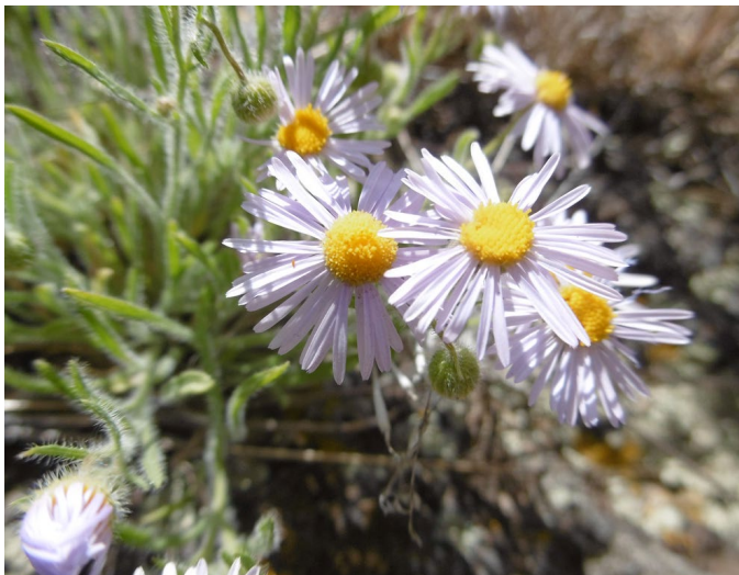
Figure 5. Small shaggy fleabane flowers.

Individual plants produce up to 50 flat-topped to hemispheric flower heads, which often occur singly at the top of stems (Hickman 1993; Nesom 2006; Pavek et al. 2012; Welsh et al. 2016; Hitchcock and Cronquist 2018). Individual heads have 50 to 150 rays, which are pistillate, fertile, white to pink or lavender, and 6 to 15 mm long (Fig. 5). Ray flowers are thin, reflexed or sometimes weakly coiled, and surround yellow to orange disk flowers. Disk corollas are fertile, 3 to 5 mm tall with distinctly indurate and inflated throats (Nesom 2006; Welsh et al. 2016; Hitchcock and Cronquist 2018). Involucre is hairy, 7 to 15 mm wide, and 4 to 7 mm tall with subequal bracts in 2 to 4 series (Nesom 2006; Welsh et al. 2016; Hitchcock and Cronquist 2018; Luna et al. 2018). Bracts are covered with tiny glands, long hairs, and have orange to yellowish or brownish midribs (Nesom 2006; Welsh et al. 2016; Luna et al. 2018).