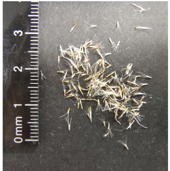
Figure 9. Collection of about 40 freshly collected seeds from shaggy fleabane plants in Idaho.

Collection methods. Wildland seeds (Fig. 9) can be collected by shaking or knocking seed heads into a container or by picking mature seeds from the seed heads (Camp and Sanderson 2007; DeBolt 2016; USDI BLM SOS 2017).