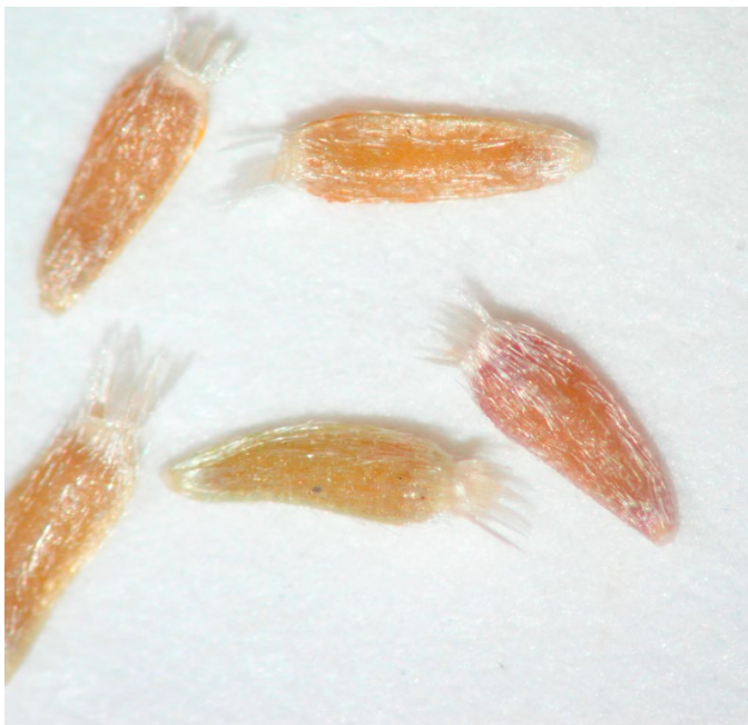
Figure 10. Shaggy fleabane seeds under magnification. Seeds were cleaned and the photo provided by USFS Bend Seed Extractory.

Seed Cleaning. Several mechanical cleaning methods have been described. The Bridger, Montana, Plant Materials Center (PMC) cleaned small quantities of fleabane seed using a blender with duct tape-wrapped blades. Blenders were filled up to 33% and pulsed at low speed. Blending was followed by sieving and winnowing over a small fanning mill (Scianna 2004). The USFS Bend Seed Extractory cleaned small seed lots (Fig. 10) using a small brush machine (mantle #32, speed 1, and medium bristle brushes) followed by hand-sieving with a #40 USGS screen and then processing with an office clipper (DeBolt 2016).