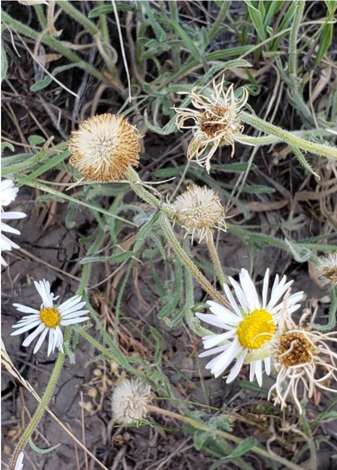
Figure 8. Shaggy fleabane plant growing in Idaho. This plant has flowering stems with mature seed, drying flowers, and fresh flowers.

to making collections. Pre-collection applications and site inspections are handled by the AOSCA member state agency where seed collections will be made (see listings at AOSCA.org).