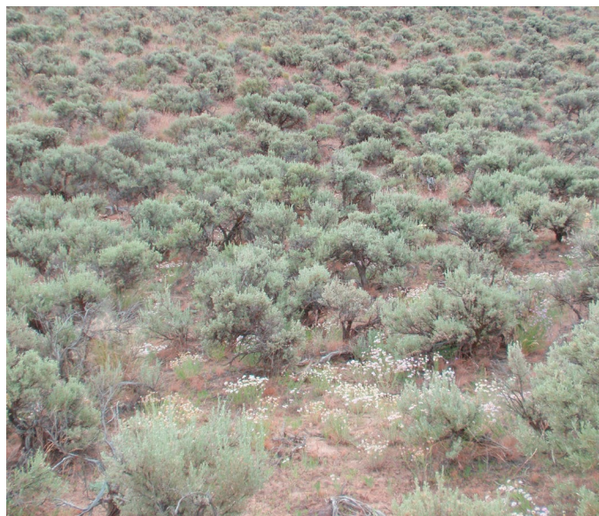
Figure 2. Shaggy fleabane growing in a big sagebrush shrubland in Oregon.

in dry basin big sagebrush ( A. tridentata subsp. tridentata ) types, which occur below 7,000 feet (2,000 m) in eastern Washington, southern Idaho, Montana, Wyoming, and south to Arizona and New Mexico. It occurs in Wyoming big sagebrush ( A. t. subsp. wyomingensis ) communities, which occupy a range like that of basin big sagebrush communities but includes parts of Colorado, Nevada, and northeastern California. Shaggy fleabane grows in threetip sagebrush ( A. tripartita ) shrublands of relatively high-elevation sites (4,000-9,000 feet [1,200-2,700 m]) in Washington, eastern Oregon, southern Idaho, southwestern Montana, Wyoming, and northern Utah and Nevada. It occurs in black sagebrush ( A. nova ) communities found at middle elevations in southern Idaho, western Wyoming, Colorado, Utah, and Nevada (Shiflet 1994). When forb species composition was evaluated at 15 big sagebrush ( A. tridentata )-dominated sites in Oregon, Nevada, Idaho, Utah, Colorado, Wyoming, and Montana, shaggy fleabane was sampled at 6 sites (Pennington et al. 2017).