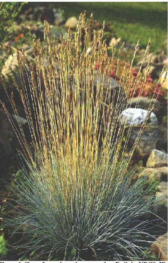
Figure 1. Sheep fescue in xeriscape garden.

Contributed By: USDA, NRCS, Idaho and Washington Plant Materials Staff and the National Plant Data Center