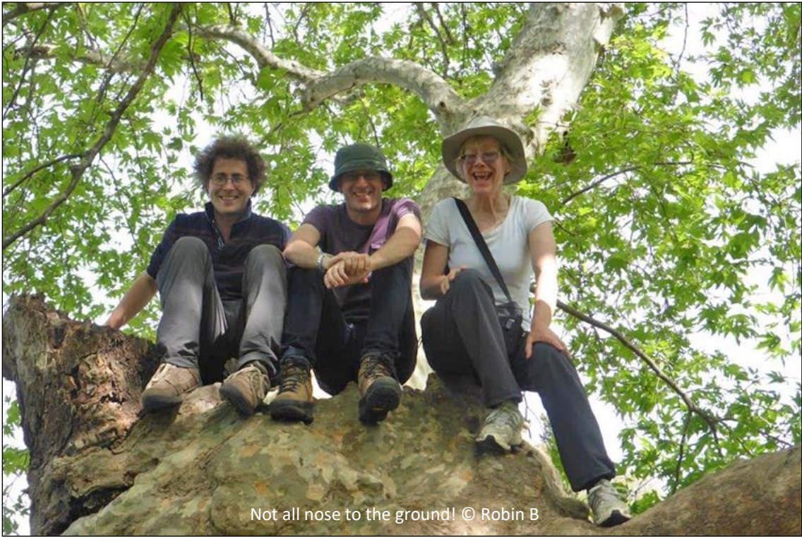
Not all nose to the ground!