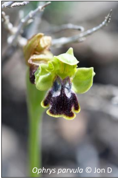
Ophrys parvula