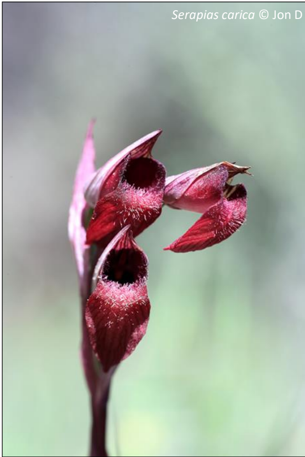
Serapias carica