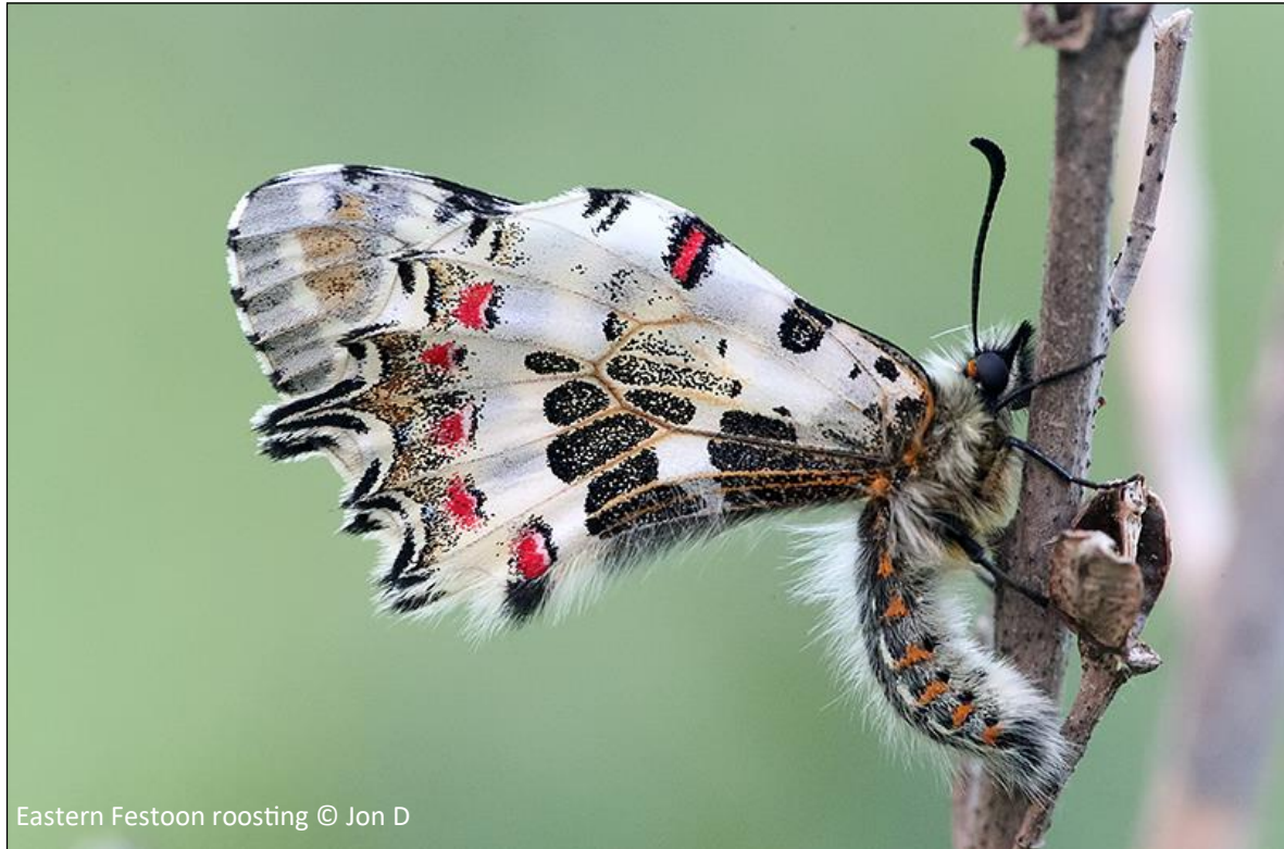
Eastern Festoon roosting