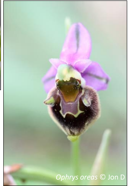
Ophrys areas