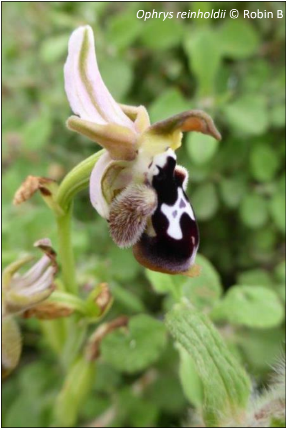
Ophrys reinholdii © Robin B