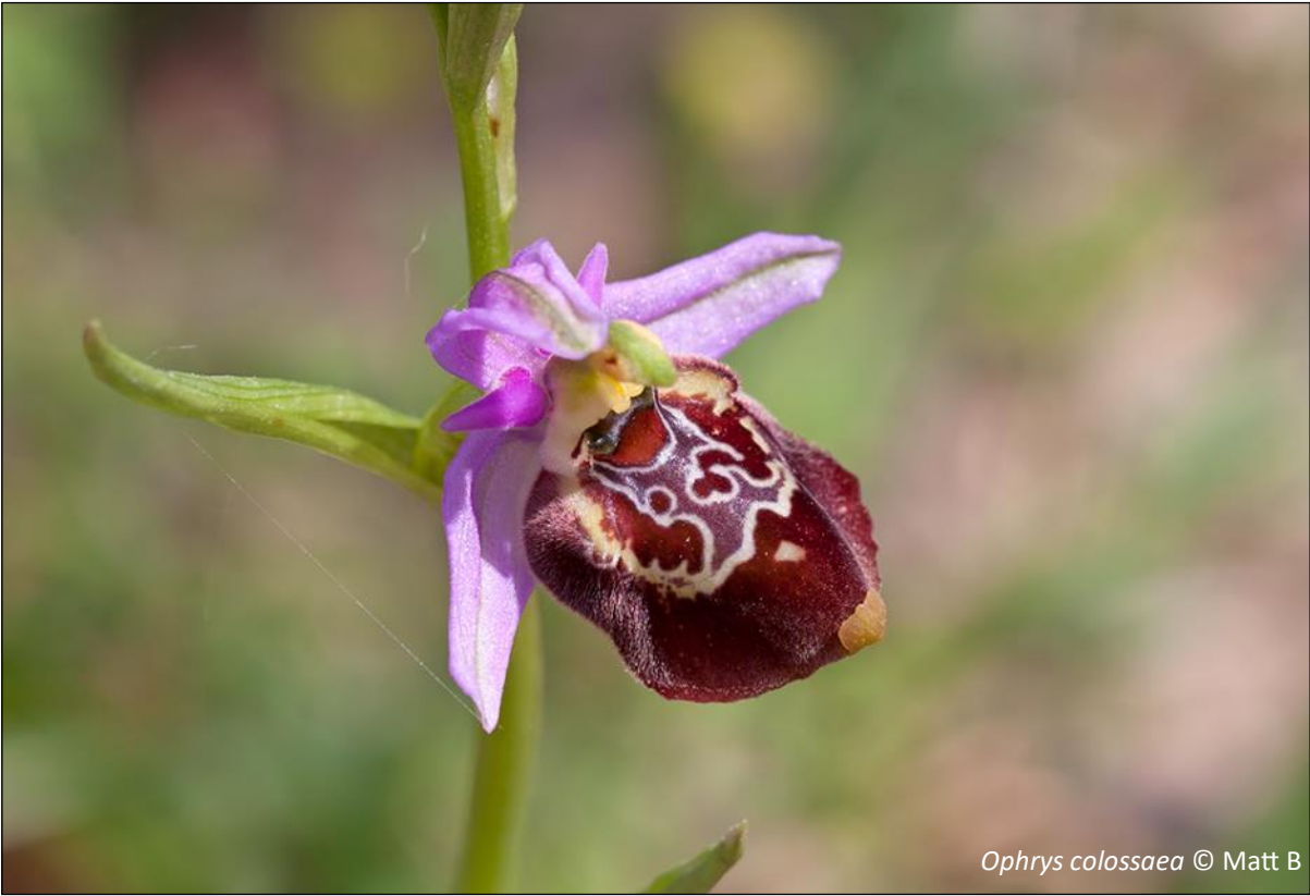
Ophrys colossaea