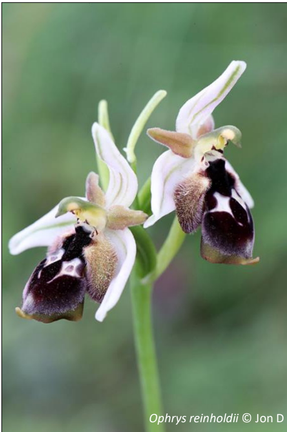
Ophrys reinholdii