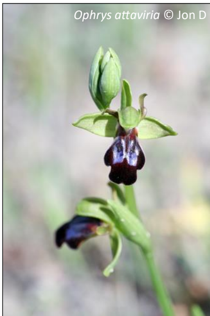
Ophrys attaviria