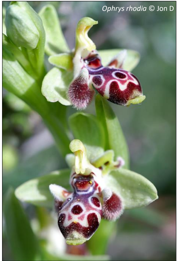
Ophrys rhodia