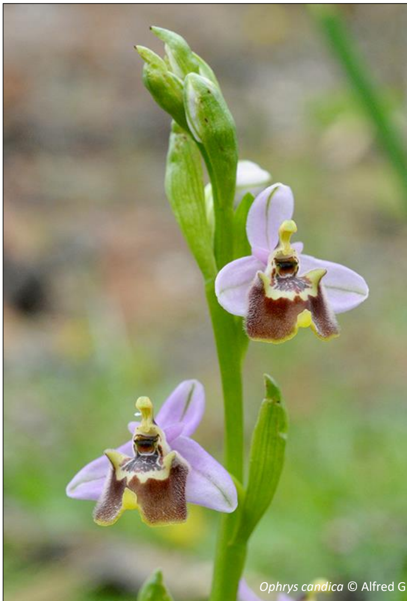
Ophrys candica © Alfred G