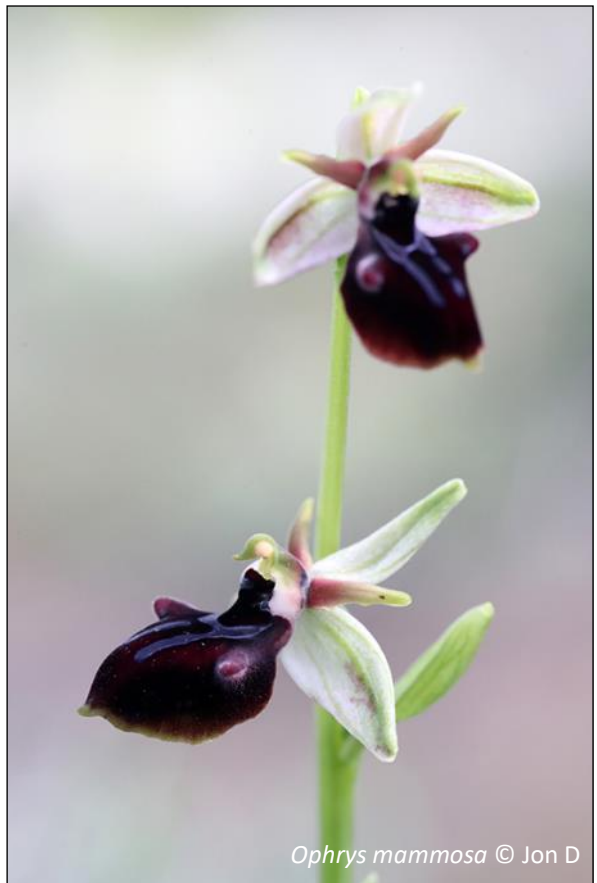
Ophrys mammosa © Jon D