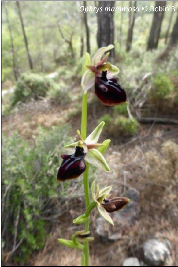
Ophrys mammosa