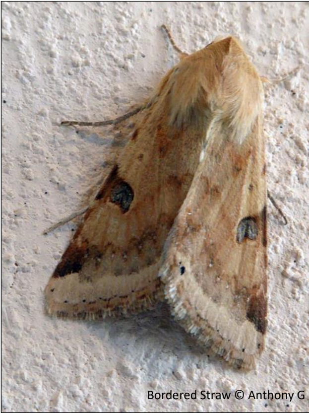
Bordered Straw