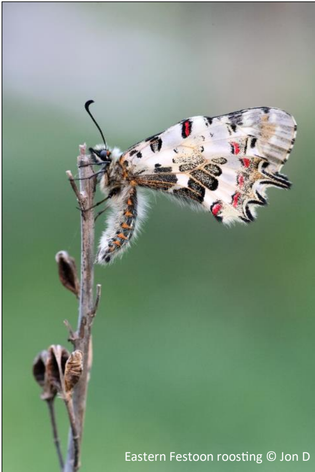
Eastern Festoon roosting