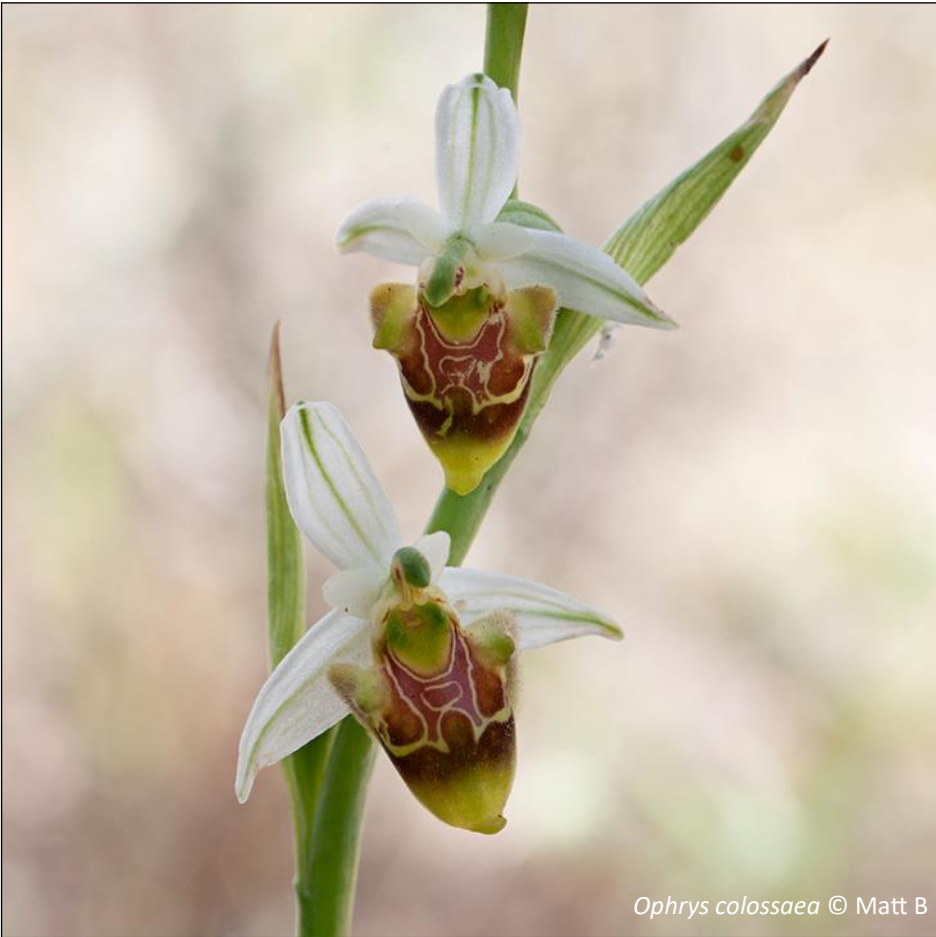
Ophrys colossaea