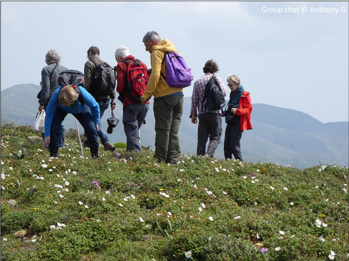
Group shot