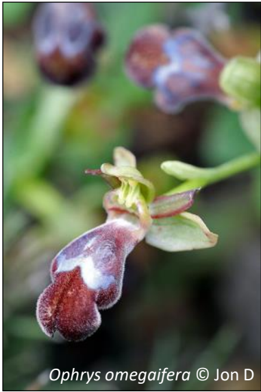
Ophrys omegaifera