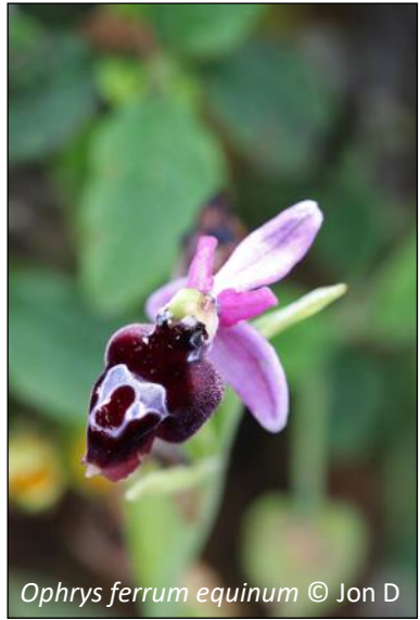
Ophrys ferrum equinum