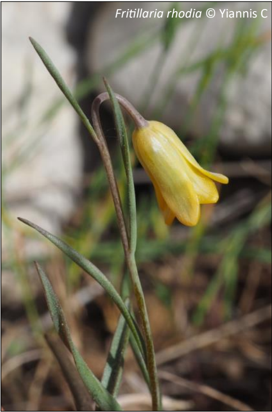
Fritillaria rhodia