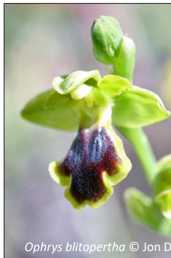
Ophrys blitopertha