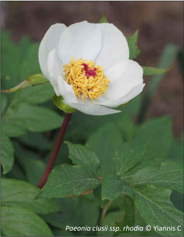
Paeonia clusii ssp. rhodia